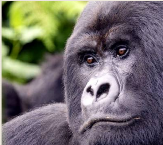
Silverback Mountain gorilla

The Mountain gorilla is restricted to just two highland areas on the borders of Uganda, Rwanda and Congo. They were brought to the brink of extinction by deforestation, poaching, human disease, and war, but a recent census showed an increase in numbers. Still, only a few hundred Mountain gorillas remain in the wild, and since there are none in captivity the future of the entire species depends on their survival.