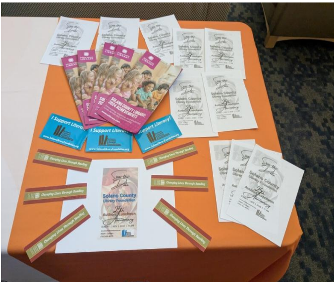
Our Display at the Hispanic Chamber Mixer @ Touro University