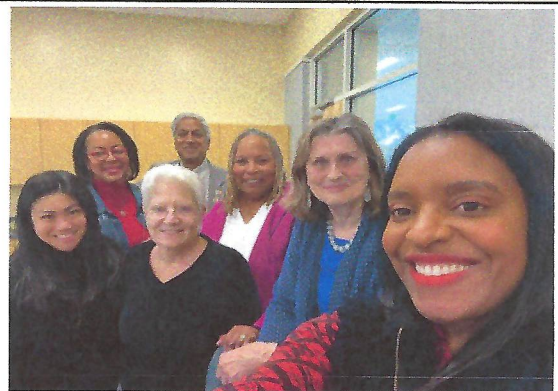
Foundation Board members smile upon concluding a successful Board Retreat!