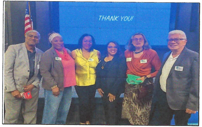
Our networking team from SCLF at the Valley Credit Union Awards