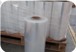
LDPE Stretch Film Roll