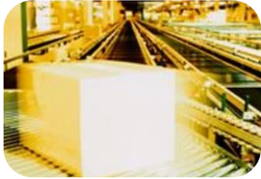
Food processing facilities