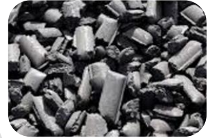
Direct reduced iron (DRI)