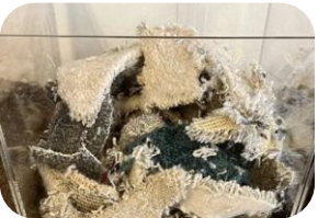
Carpet Waste (in bales)