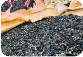
Tire-derived fuel TDF)