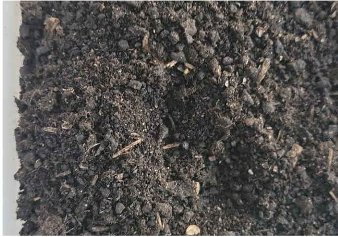
Bitu-RM Binding Solution

CE certified bitumen mixture which can be used as a asphalt binder.