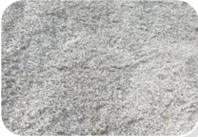
Flint glass cullet