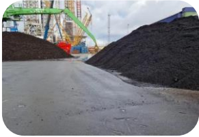
Alternative energy fuel