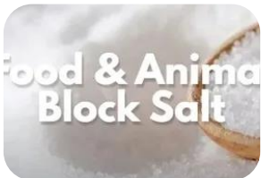
Salt and Sugar (diverse types for several industries and use)