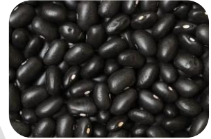
Organic bulk and soft commodities