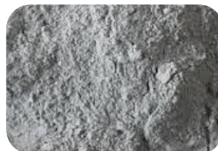
Ground granulated blast-furnace slag (GGBS)