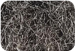
Tire Steel Wire Scrap (TDS)