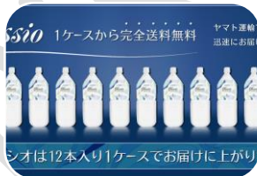
Natural and mineral water