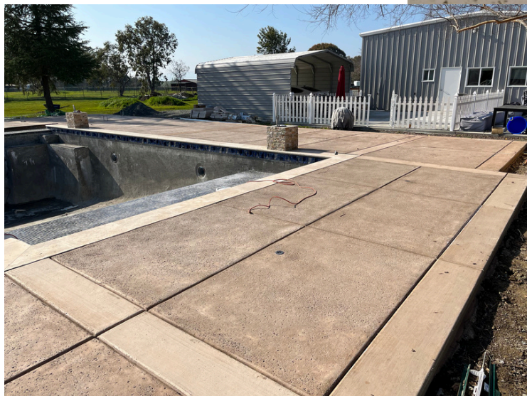
Border edge not salt stamped