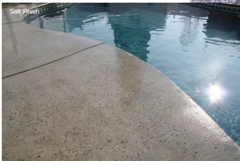
Salt stamped & Sealed