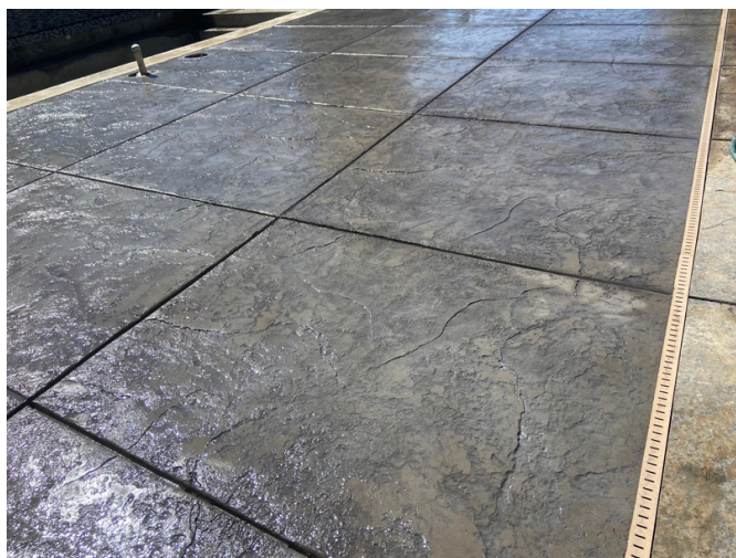
Stamped & Sealed

Sealed concrete refers to a concrete surface that has been treated with a protective coating or penetrating sealer. This process creates a barrier that protects the concrete from environmental damage, stains, and wear. The sealing process can involve various types of sealers, including acrylic, polyaspartic, and urethane, each offering different levels of protection and durability. However, sealed concrete may be more slippery when wet and not always recommended around pools.