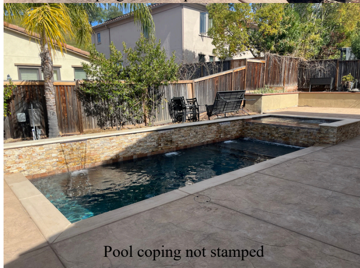
Pool coping not stamped