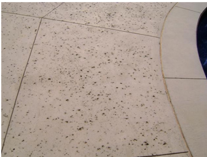
Pool coping not salt stamped

Salt stamped finish concrete is a decorative technique that involves embedding coarse rock salt crystals into freshly poured concrete before it sets. This process creates a textured surface with shallow indentations, enhancing both aesthetics and safety. The salt is washed away after the concrete hardens, resulting in a unique, subtle sparkle that adds character to outdoor spaces like patios, walkways, and driveways.