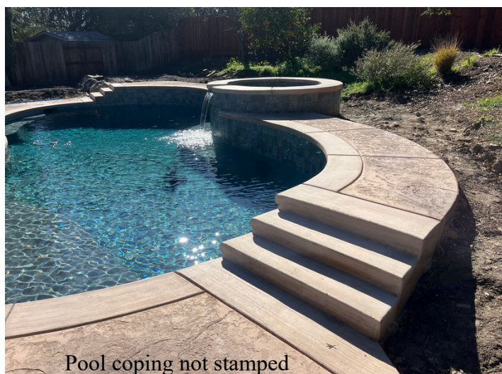
Pool coping not stamped

Stamped concrete involves pouring concrete and then embossing it with patterns or textures before it sets. This technique allows for a wide range of designs, making it a popular choice for patios, driveways, walkways, and pool decks. The process uses special molds and colors to create a surface that resembles high-end materials while maintaining the durability of concrete.