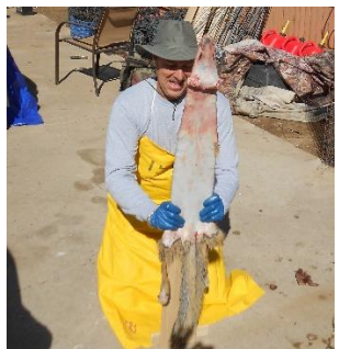
4) Putting on Stretcher Skin side out