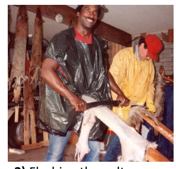
2) Fleshing the pelt on a Fleshing board

WHAT ABOUT FLESHING & STRETCHING? Tools needed: Fleshing Board & knife, knife, wire stretcher, sewing needle & dental floss. 1) We wash the hide in liquid Tide or ALL then wring out. 2) With the skin-side out, put onto fleshing board head up. Put the base of the Fleshing Board against something immoveable. Use a fleshing knife & flesh the hide using a downward motion, removing the flesh. You may need to use the knife for trimming at times. 3) Sew up the bullet holes, etc. on the pelt. 4) With the skin-side out, put pelt onto a stretcher. Leave on stretcher until pelt dries some. 5) Take the pelt off the stretcher, turn fur-side out then put back onto the stretcher fur-side out. Let dry in cool, bug-free place. Once dried & off the stretcher the pelt is now ready to sale or to ship to get tanned. We use Moyle's Tannery in Idaho.