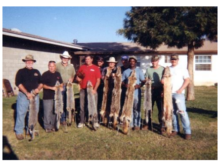
5) Finished Product Fur Side out