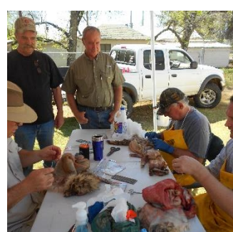
3) Sewing the holes