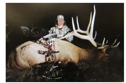
Member w/2017 Archery Bull