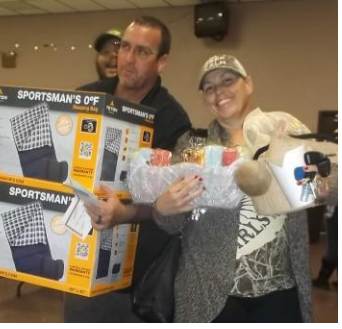
2015 PVCI Christmas Party

***How would you like to receive this Newsletter as a PDF file on the computer INSTEAD OF in Paper form? Let Membership Chairman ?????? know at Meeting. Save the Club Mailing Cost!!