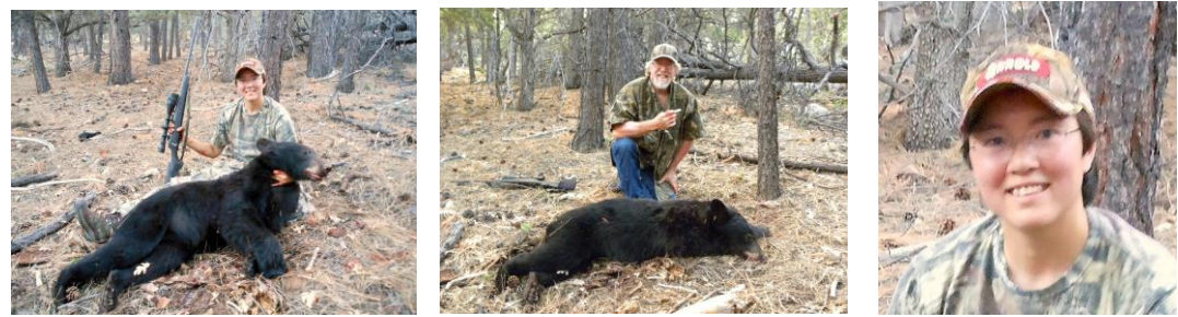
This Story is "NOT" Over!!! More of the story to come in the next issue!!!

Now I too have a bear story to tell. Best of all, I was able to tag it with my best friend and partner at my side. Everything he taught me was truth. Bears are awesome, powerful and command respect. Don't ever underestimate them. They are also one of the most intelligent and elusive creatures that live in the most beautifully rugged terrain. Entering their world will challenge you physically and mentally. But perhaps the most important of all lessons I learned and will stress to anyone that asks me what it's like to be on the receiving end of a charging bear ... "Stay alert. Shoot, don't hesitate, reload and be ready to hit it again."