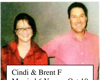
Married 6 Years - Oct 10