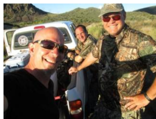
Winning Novice Team