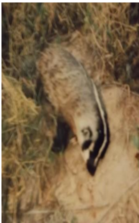
Eddie's First Badger

Is there a badger in your future? Whether you are new to predator calling or have been at it awhile, each calling stand that you do has the potential to be a stand where something may happen that you will never forget. So to answer the question, if you stay at it and keep calling, ANYTHING is possible, including a badger and when it does happen, you probably won't forget the experience. Badgers are awesome! Good Luck in your Calling!