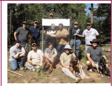
PVCI Trail Clearing Crew 2014