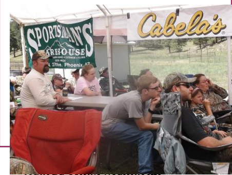
Boot Camp 2014