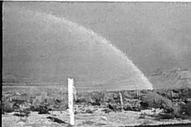
Is there really a pot of gold at the end? Go varmint hunting and find out!