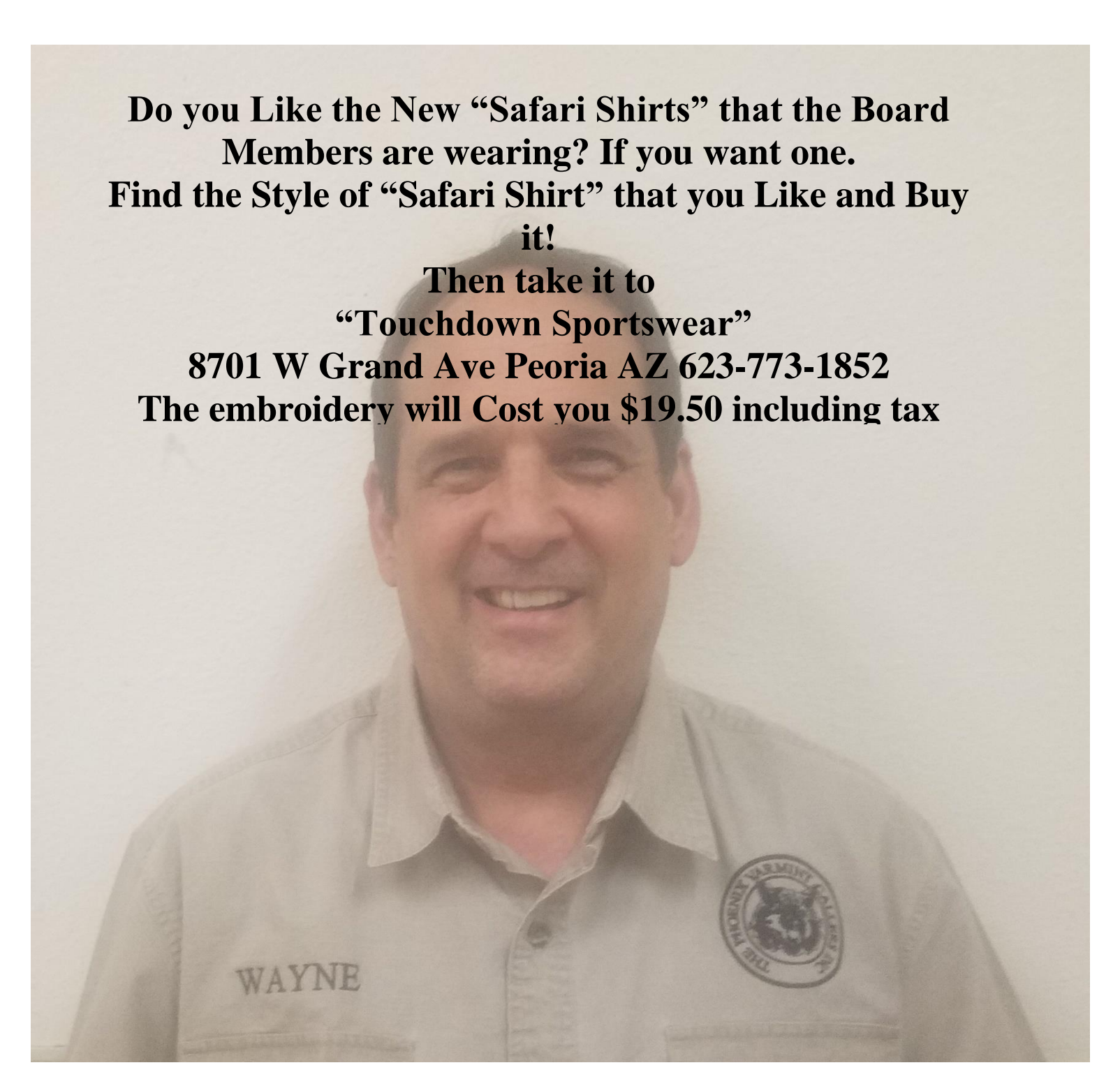
Show Pride in PVCI Wear Your Club LOGO Shirts to all Functions!!!!