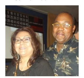
Married 13 years on July 7

Would you like for your Birthday, Anniversary, or other Special Event to show here? Send your info to coyotecaller@cox.net