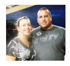
Married 27 years -Aug. 28