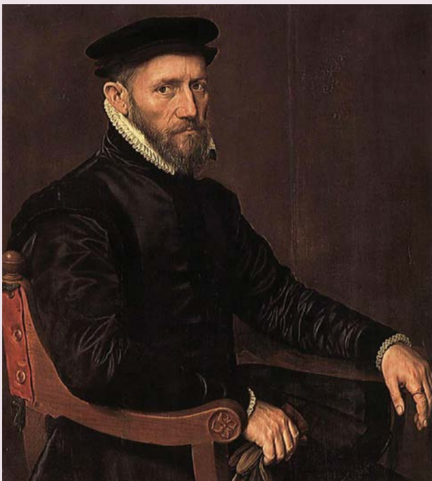
Sir Thomas Gresham