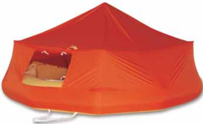
T9 LIFE RAFT Standard Canopy

ALL RAFTS CAN BE CUSTOMIZED WITH CANOPY OPTIONS