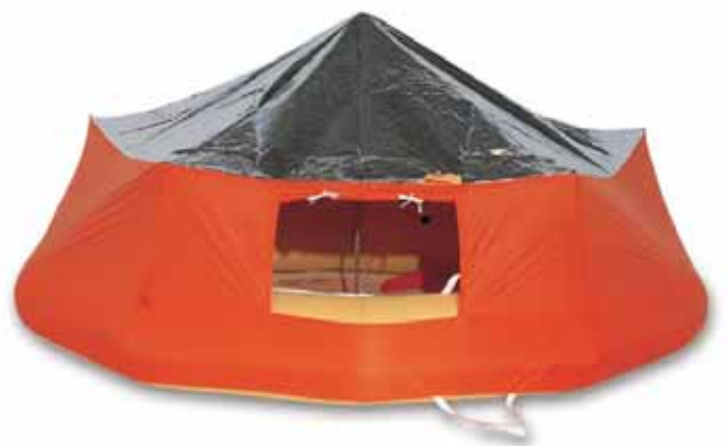
T9 LIFE RAFT Radar Reflective Canopy