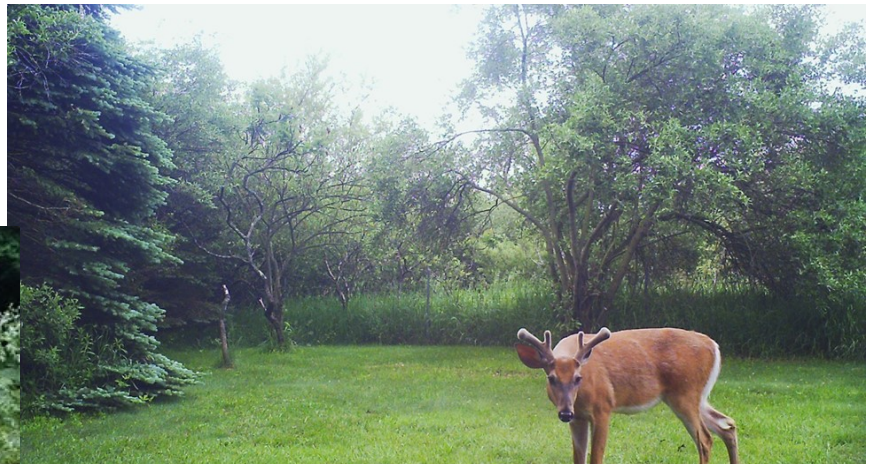
A few young bachelors bucks, and a good size bear visited one of Pat Donovan's mowed open spots.