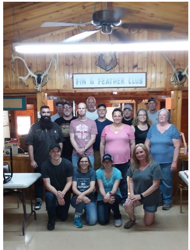
CPL Class of June 7th & 8th,