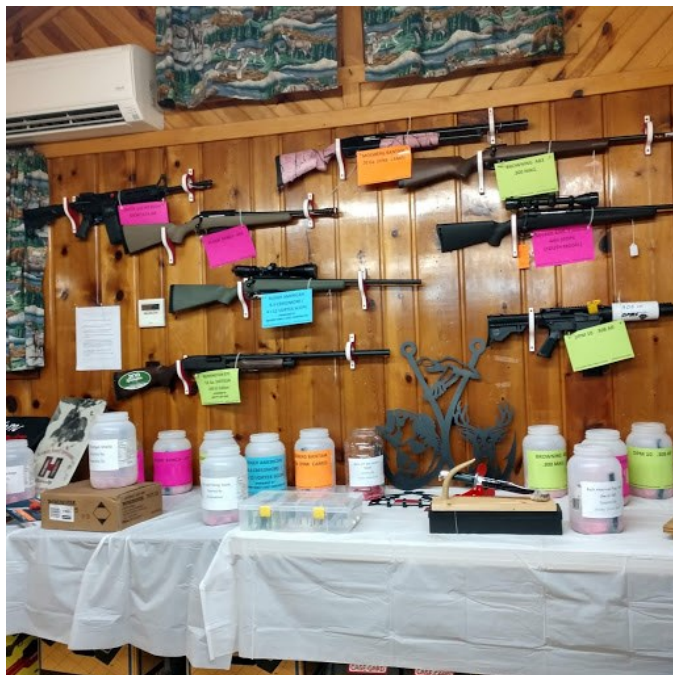
Some of the quality firearms that were raffled off.