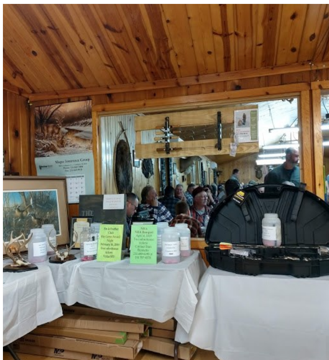
Some of the many raffle items.