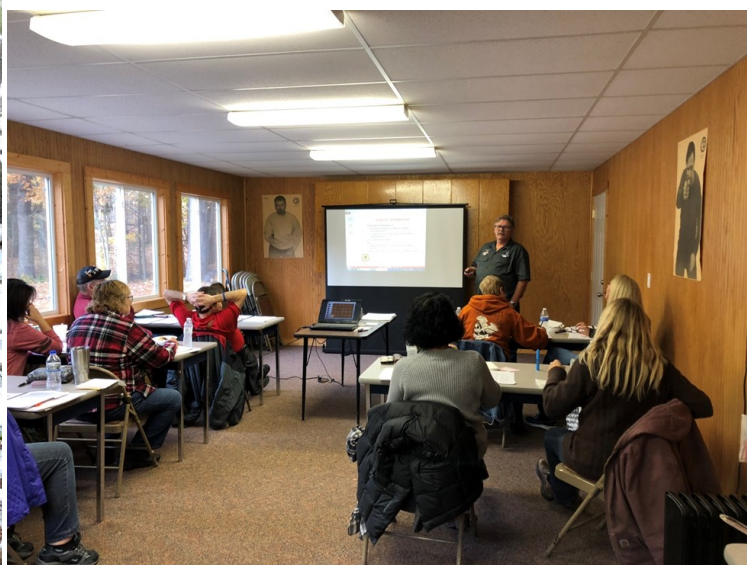
NRA Certification Range Safety Class that was held Nov. 3, 2018 at the Fin & Feather Club.

Your deer photos can be showed here. Send them in!!!!!!!!!!