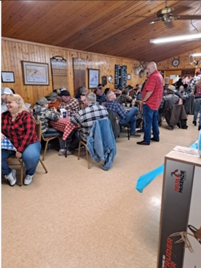
A few of the attendees