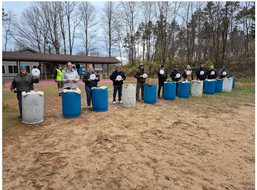
Last CPL class of 2025, there were 11 in the class.