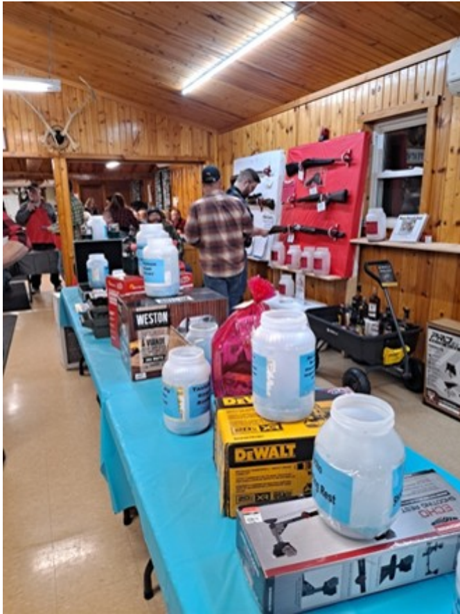
Just a few of the raffle items at Plaid Shirt Night.