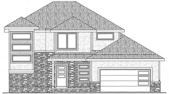
THE CHERRY PARK