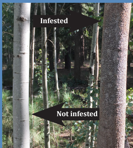
Fig. 2 Severely infested aspen (right) next to an unaffected aspen (left).

Fig. 2 and Fig. 3