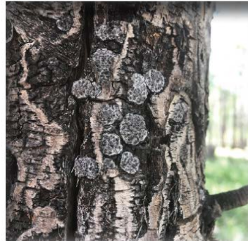
Fig. 5 White and black stromata of E. mammatum . Note the dark, roughen bark caused by the pathogen.