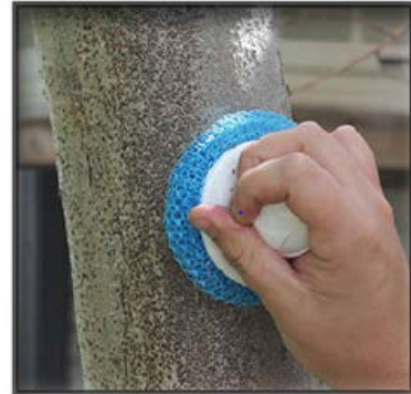
Fig. 6 Physical removal of scales.