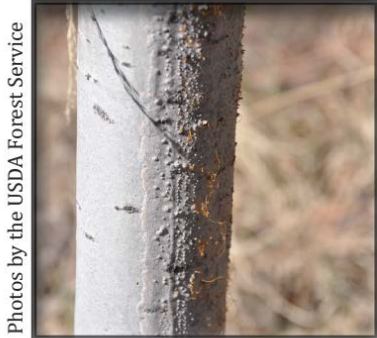
Fig. 4 Orange fruiting bodies emerging from pimple-like structures caused by Cytospora spp.

There are other scales that occur on aspen, but none that will look similar to OSS. However, there are non-insect agents that cause damage which can resemble OSS damage, namely cankers. A variety of fungal pathogens cause canker formation on aspen which may result in sunken and/or roughened bark. From a distance, cankers may appear as darkened patches that may be confused with OSS. Two common aspen cankers that might be confused with OSS are Cytospora canker ( Cytospora spp. ) (Figure 4) and hypoxylon ( Entoleuca mammatum ) (Figure 5). It is important to positively identify OSS as the causal agent before implementing any management strategies.