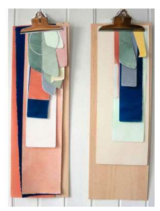
Left © Cheryl Bell Right Fi Brown

In group Z Cheryl Bell says, "This imaginative project allows artists to learn and grow by studying colleagues' work and responding to it in our own way. My passion is nature; fractals and infinitely complex patterns repeated over and over. This is what struck me with Josie Barnes' beautiful image; shapes repeating and undulating, like bubbles, or a cracked landscape, or scaly skin from a dinosaur or a bird. Skin and follicles and feathers – complex, repeating, protecting. 'Flight Risk' is about birds and their feathers, risking all for survival."