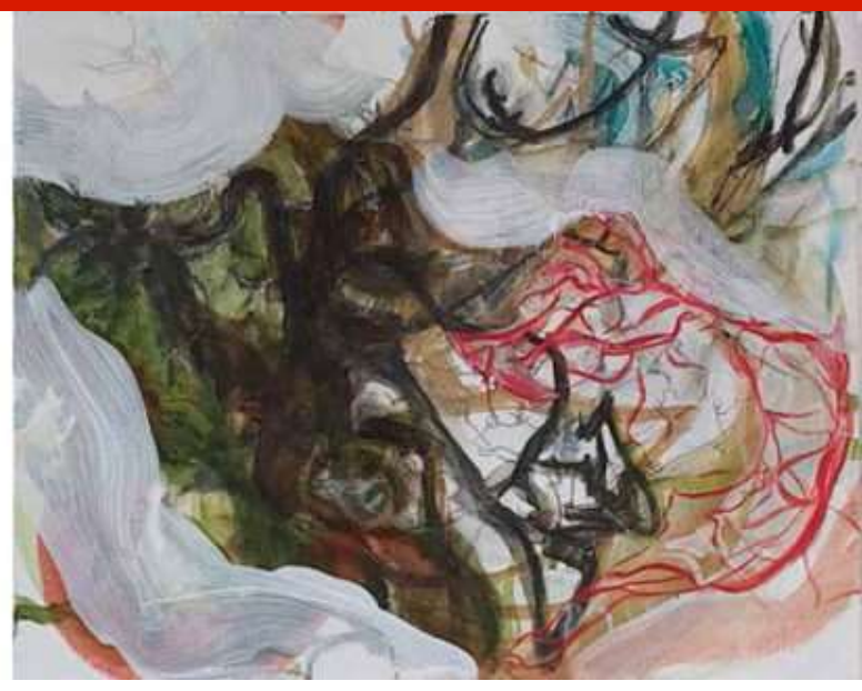
The initial responses to the word Inhabit which began the Relay, Respond, Relay art project. Left Right. Detail.