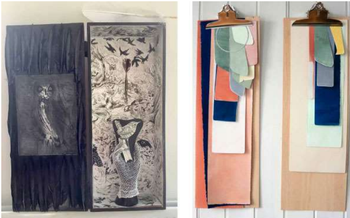
Left © Cheryl Bell Right Fi Brown

In group Z Cheryl Bell says, “This imaginative project allows artists to learn and grow by studying colleagues’ work and responding to it in our own way. My passion is nature; fractals and infinitely complex patterns repeated over and over. This is what struck me with Josie Barnes’ beautiful image; shapes repeating and undulating, like bubbles, or a cracked landscape, or scaly skin from a dinosaur or a bird. Skin and follicles and feathers – complex, repeating, protecting. ‘Flight Risk’ is about birds and their feathers, risking all for survival.”