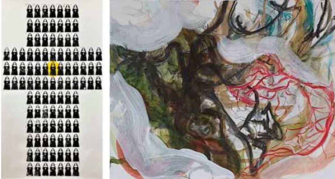
The initial responses to the word Inhabit which began the Relay, Respond, Relay art project. Left Right. Detail.