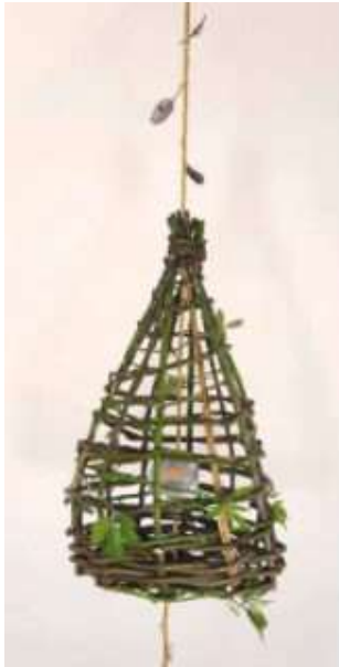
Left

Not knowing what the other was producing it is extraordinary and exciting that both artists instinctively felt a religious resonance to the word.