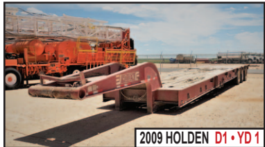
2009 HOLDEN D1 • YD 1