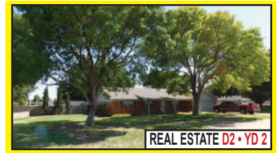
REAL ESTATE D2 • YD 2

(3) 6-1/4" OD X 2-1/2" ID SLICK DRILL COLLAR, SLIP RECESS, W/ 4-1/2" X-HOLE CONNS, COMPLETE W/ THREADED PROTECTORS, INSP. BY PARAMOUNT W/ PAPERS