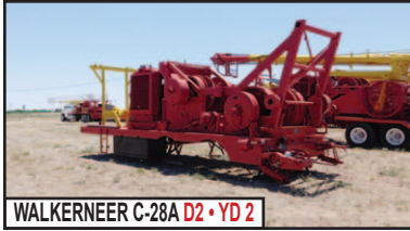
WALKERNEER C-28A D2 • YD 2