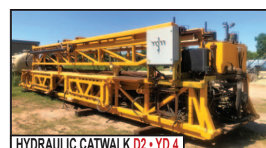
HYDRAULIC CATWALK D2 • YD 4