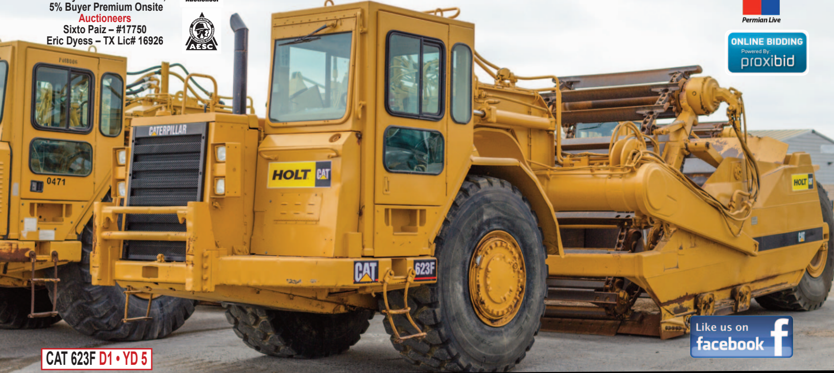
CAT 623F D1 • YD 5