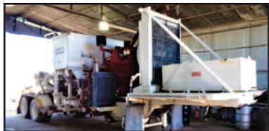
WESTERN RB-80 TRIPLEX CEMENT PUMP D1 • YD 3