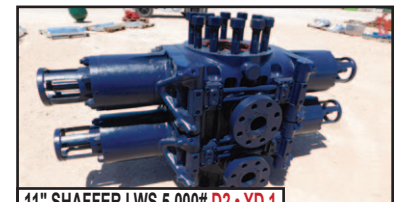
11" SHAFFER LWS 5,000# D2 • YD 1