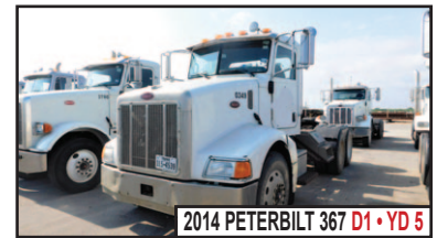
2014 PETERBILT 367 D1 • YD 5