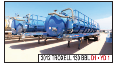
2012 TROXELL 130 BBL D1 • YD 1