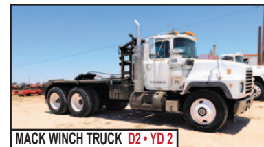
MACK WINCH TRUCK D2 • YD 2

1994 PETERBILT 357 T/A DAY CAB 6X6 TRUCK, 205"WB, P/B CAT 3306 DIESEL ENGINE, 7 SPD TRANS., 445/65R22.5" FRONT, 11R22.5" REAR TIRES, 286,646 MILES 1989 MACK R690ST T/A WINCH TRUCK, 205"WB, P/B 6 CYL MACK DIESEL ENGINE, MANUAL TRANS., 12' OFS WINCH BED W/ POLES, 5TH WHEEL, ROLLING TAILBOARD, TULSA 64 WINCH, HEADACHE RACK, 11R22.5" FRONT & 11R24.5" REAR 1986 INTERNATIONAL T/A SLEEPER HAUL TRUCK, 228"WB, P/B CUMMINS NTC-350 DIESEL ENGINE, MANUAL TRANS., BLOWER, 5TH WHEEL, 11R24.5" TIRES 1979 INTERNATIONAL PAYSTAR 5000 T/A WINCH TRUCK, 182"WB, P/B DETROIT 8V-72T DIESEL ENGINE, EATON FULLER RT9513 TRANS., TULSA M64 WINCH, HEADACHE RACK, 5TH WHEEL, FRAME WIDTH, ROLLING TAIL BOARD, 10.00R20" TIRES MACK RWS786LST SUPER LINER T/A DAY CAB TRUCK, 240"WB, P/B MACK 6 CYL DIESEL ENGINE, MANUAL TRANS., 5TH WHEEL, 1124.5" TIRES 1977 MACK T/A WATER TRUCK, P/B 300 MACK DIESEL ENGINE, MANUAL TRANS., W/ 2000 GALLON WATER TANK, SPREADER BAR F/ WETTING ROADS 1995 MACK RD6885 T/A WINCH TRUCK, W/ OILFIELD BED, POLES, BRADEN MS-32 WINCH, 5TH WHEEL, ROLLING TAIL BOARD, HEADACHE RACK MACK R685 T/A WINCH TRUCK, P/B 6 CYL DIESEL ENGINE, MANUAL TRANS., W/ 11' OILFIELD BED, 11' POLES, HEADACHE RACK, TULSA 64 WINCH, 5TH WHEEL, ROLLING TAIL BOARD, 10.00R20" TIRES 1974 FORD 900 S/A WINCH TRUCK, 162"WB, P/B FORD 477 CU. IN. V-8 GAS ENGINE, MANUAL TRANS., 11' LELAND BED W/ POLES, TULSA WINCH, ROLLING TAILBOARD, HEADACHE RACK, 10.00-20" TIRES