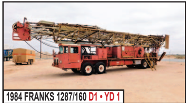
1984 FRANKS 1287/160 D1 • YD 1