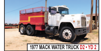
1977 MACK WATER TRUCK D2 • YD 2