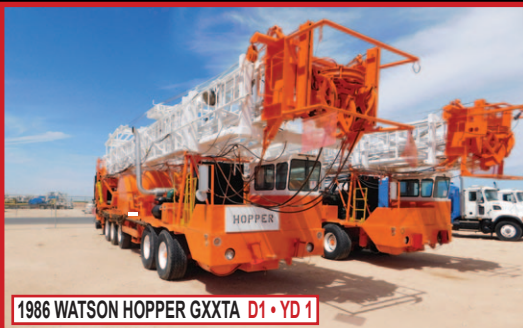
1986 WATSON HOPPER GXXTA D1 • YD 1

9:00AM (CST) Each Day REGISTER TO BID ONLINE!