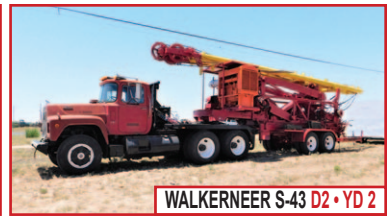
WALKERNEER S-43 D2 • YD 2