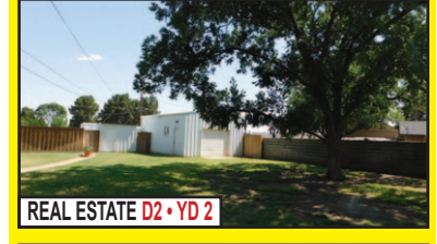
REAL ESTATE D2 • YD 2