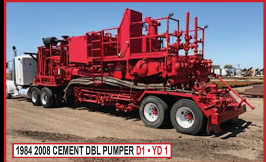
1984 2008 CEMENT DBL PUMPER D1 • YD 1

TUESDAY & WEDNESDAY JULY 28th & 29th, 2020