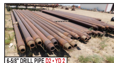
6-5/8" DRILL PIPE D2 • YD 2