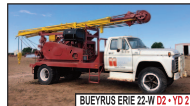
BUEYRUS ERIE 22-W D2 • YD 2