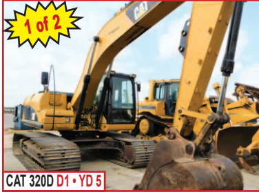
CAT 320D D1 • YD 5