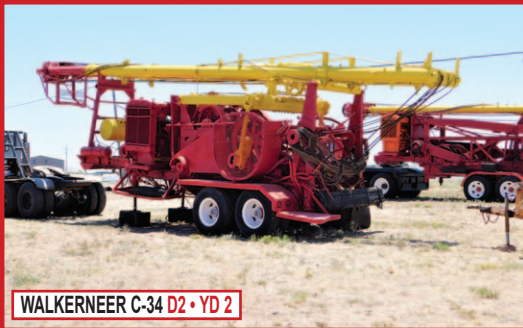
WALKERNEER C-34 D2 • YD 2

CONSTRUCTION • TRUCKS • TRAILERS • PICK UPS • WATER WELL RIGS • DRILLING TOOLS • DRILL COLLARS DRILL PIPE • WELL SERVICE RIGS • WELL SERVICING TOOLS • CEMENT PUMPS • BULK TRAILERS