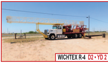
WICHTEX R-4 D2 • YD 2