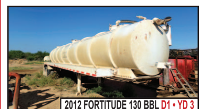
2012 FORTITUDE 130 BBL D1 • YD 3