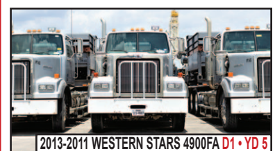
2013-2011 WESTERN STARS 4900FA D1 • YD 5