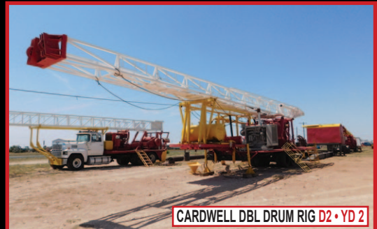
CARDWELL DBL DRUM RIG D2 • YD 2

9:00AM (CST) Each Day REGISTER TO BID ONLINE!