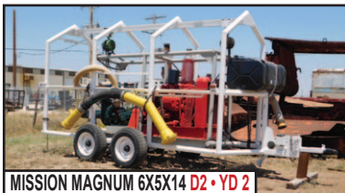
MISSION MAGNUM 6X5X14 D2 • YD 2