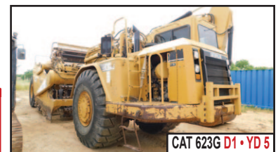
CAT 623G D1 • YD 5