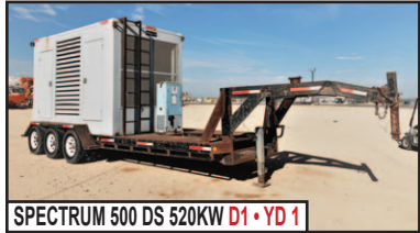
SPECTRUM 500 DS 520KW D1 • YD 1