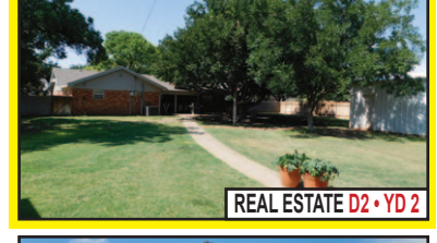
REAL ESTATE D2 • YD 2