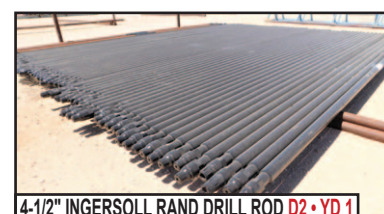
4-1/2" INGERSOLL RAND DRILL ROD D2 • YD 1