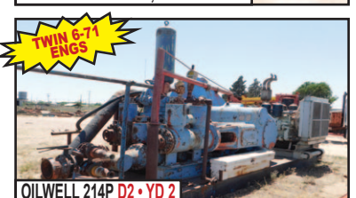
OILWELL 214P D2 • YD 2