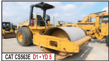
CAT CS563E D1 • YD 5