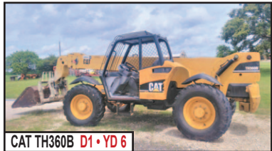
CAT TH360B D1 • YD 6