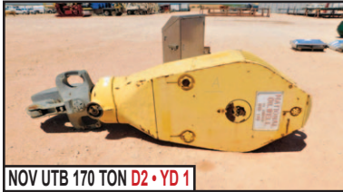
NOV UTB 170 TON D2 • YD 1