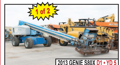
2013 GENIE S80X D1 • YD 5