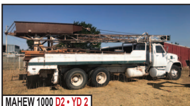
MAHEW 1000 D2 • YD 2