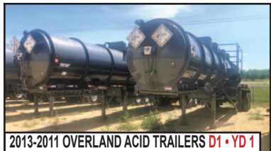
2013-2011 OVERLAND ACID TRAILERS D1 • YD 1