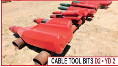
CABLE TOOL BITS D2 • YD 2