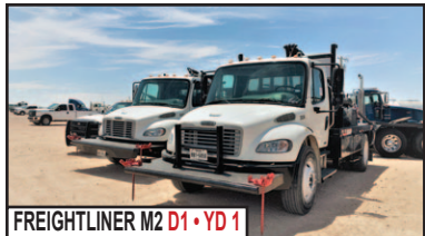
FREIGHTLINER M2 D1 • YD 1