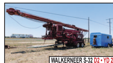
WALKERNEER S-32 D2 • YD 2