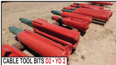
CABLE TOOL BITS D2 • YD 2