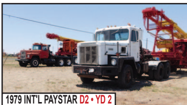
1979 INT'L PAYSTAR D2 • YD 2

(5) LINCOLN ARC WELDER SA-300-163 GAS WELDERS