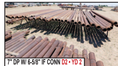
7" DP W/ 6-5/8" IF CONN D2 • YD 2