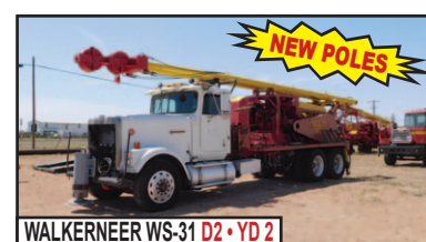
WALKERNEER WS-31 D2 • YD 2