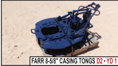
FARR 8-5/8" CASING TONGS D2 • YD 1