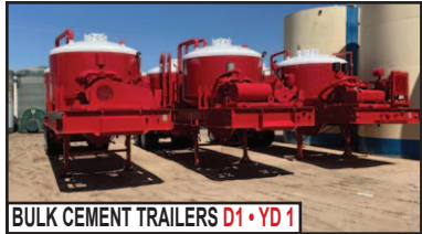
BULK CEMENT TRAILERS D1 • YD 1