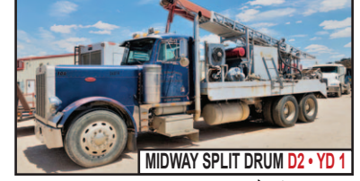
MIDWAY SPLIT DRUM D2 • YD 1