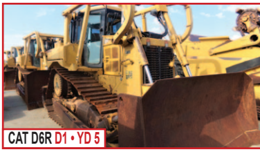
CAT D6R D1 • YD 5