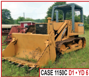
CASE 1150C D1 • YD 6