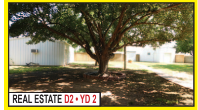
REAL ESTATE D2 • YD 2