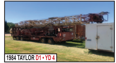
1984 TAYLOR D1 • YD 4