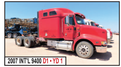
2007 INT'L 9400 D1 • YD 1

SPECTRUM 500 DS 520 KW GENERATOR, SN- 606436, P/B 12V92T DETROIT DIESEL ENGINE, MTD ON TRI-AXLE GOOSENECK TRAILERS, SHOWS 1,340 HRS