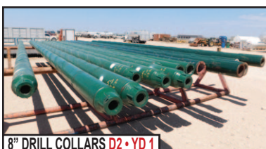
8" DRILL COLLARS D2 • YD 1