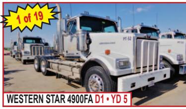
WESTERN STAR 4900FA D1 • YD 5