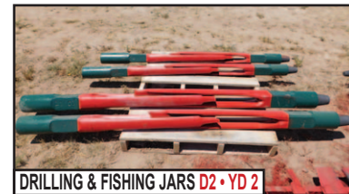
DRILLING & FISHING JARS D2 • YD 2