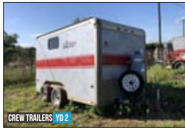
CREW TRAILERS YD 2