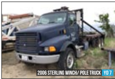
2006 STERLING WINCH/ POLE TRUCK YD 7