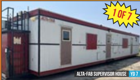
ALTA-FAB SUPERVISOR HOUSE YD 7