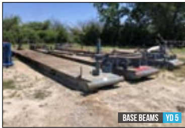
BASE BEAMS YD 5