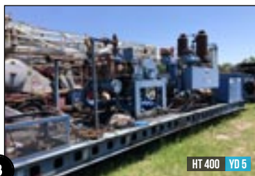
HT 400 YD 5