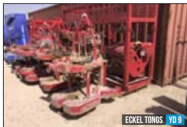
ECKEL TONGS YD 9

GARDNER DENVER TEE TYPE TRIPLEX PUMP , P/B DETROIT S-60 DIESEL ENGINE, ELEC START, GAUGES, RADIATOR, 5 SPD MANUAL TRANS., CHAIN DRIVEN, 3X4 CENT PUMP, MANIFOLD, SHEAR RELIEF VALVE, GAUGES, CONTROL PANEL, EXP STORAGE BOX, HARDLINE RACKS, FUEL TANK,