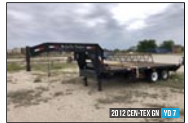
2012 CEN-TEX GN YD 7