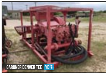
GARDNER DENVER TEE YD 7