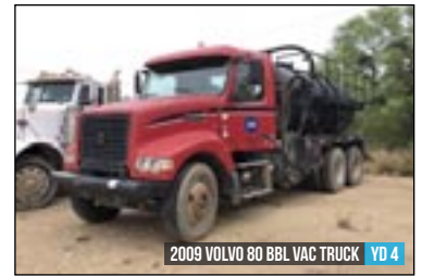
2009 VOLVO 80 BBL VAC TRUCK YD 4