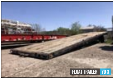
FLOAT TRAILER YD 3

(2) 210 BBL 2 COMP OPEN TOP SHAKER PITS, W/NOV BRANDT CABRA SHELL SHAKER