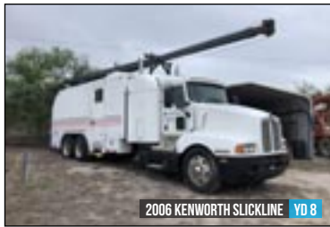
2006 KENWORTH SLICKLINE YD 8

4X6 CENT PUMP, MUD VALVES, OPERATOR CONSOLE, ENGINE ELECTRONIC CONTROLS, SKIDDED DRAGON WORK FORCE 660 TRIPLEX PUMPS , SKID, 660 HP, 1.181 STROKE, LESS ENGINE, W/ PULSATION DAMPENER, SHEAR RELIEF, 4X6 CENT PUMP, MUD VALVE, MUD GAUGE, MTD ON 8'W X 20'L SKID