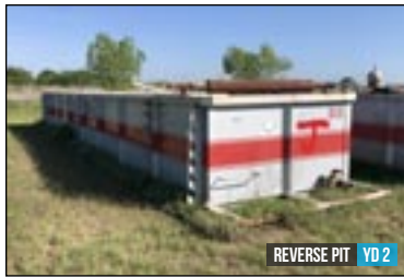
REVERSE PIT YD 2