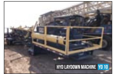
HYD LAYDOWN MACHINE YD 10

(7) ALTA-FAB 50' DUPLEX STYLE SUPERVISOR HOUSES, W/ 2 BEDROOMS, 2 KITCHENS, LIVING AREA, WASHER/ DRYER, SKIDDED