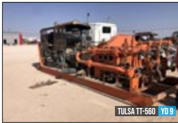
TULSA TT-660 YD 9

(12) MAVRICK 58-93 TYPE HYD POWER TONGS (INCOMPLETE)