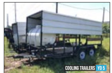
COOLING TRAILERS YD 5

(2) 2- COMP CHEMICAL/ MUD MIXING 35 X 7 X 4 OPEN TOP TANKS, SKIDDED