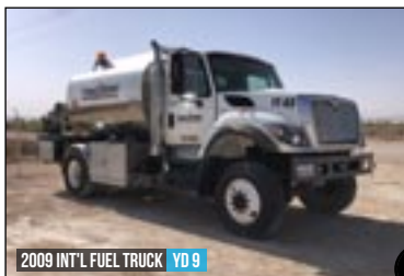
2009 INT'L FUEL TRUCK YD 9

DRAGON WORKFORCE 660 TRIPLEX PUMP , 660 HP, 1.181 STROKE, P/B DETROIT S-60 DIESEL ENGINE, RADIATOR, GAUGES, ELEC START, ALLISON CLT-5861-4 TRANS.,