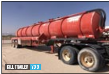
KILL TRAILER YD 9

W/ (2) OUTLETS, LESS RAMS SHOPBUILT S/A BP BOP TRAILER, W/ MAN WINCH, LESS TIRES & WHEELS