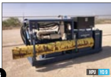
HPU YD 9

20' X 7' X 4' 2 COMP OPEN TOP PIT, SKIDDED