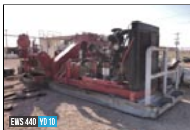
EWS 440 YD 10

(1) 150 GAL WASTE LIQUID TANK, (1) 3'H X 30"W X 6'L METAL WORK TABLE W/ LIGHT