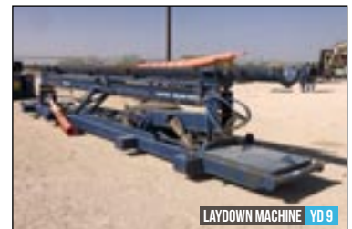
LAYDOWN MACHINE YD 9

CAMERON "U", 11", 10K DBL BOP W/ (4) OUTLETS, LESS RAMS CAMERON "U" 11", 5K DBL BOP W/ (4) OUTLETS, LESS RAMS CONTROL FLOW "U", 11", 10K SGL BOP W/ (2) OUTLETS, LESS RAMS CAMERON "U" 11", 10K SGL BOP