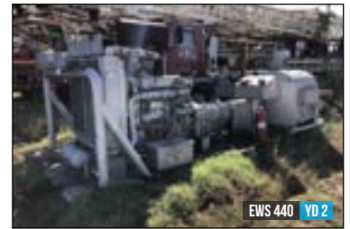
EWS 440 YD 2