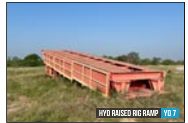
HYD RAISED RIG RAMP YD 7