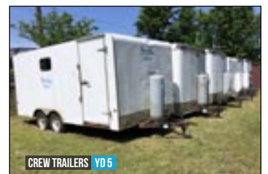
CREW TRAILERS YD 5

1998 INT'L NAVISTAR 2674 T/A CRANE TRUCK, W/TEREX BT-4792 23.5 TON, P/B: 6 CYL T DIESEL INTERNATIONAL EATON 8 SPEED TRANSMISSION, WET KIT W/20' BED, HYD OUTRIGGER, W/B: 255", SPRING SUSPENSION