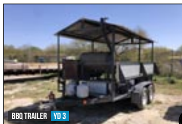
BBQ TRAILER YD 3