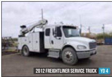
2012 FREIGHTLINER SERVICE TRUCK YD 4

BACK SUSP., SHOWS 222,490 HRS 2008 PETERBILT 388 T/A DAY CAB HAUL TRUCK, P/B CAT C15 ACERT TWIN TURBO ENGINE, EATON 18 SPD TRANS., 212" WB, AIR RIDE SUSP., 6,160 GVWR, SHOWS 91,696 MILES & 6314 HRS