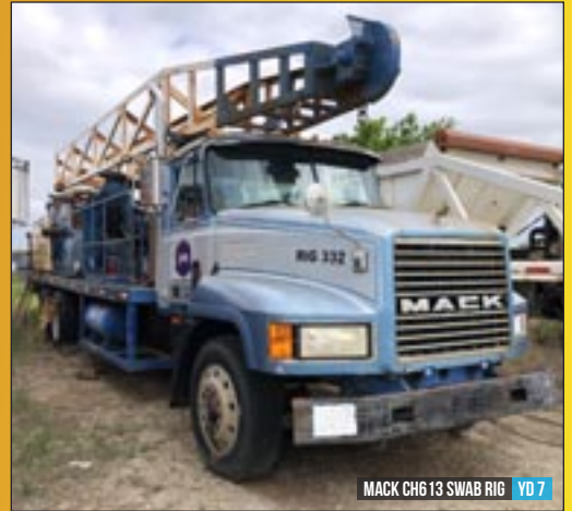
MACK CH613 SWAB RIG YD 7