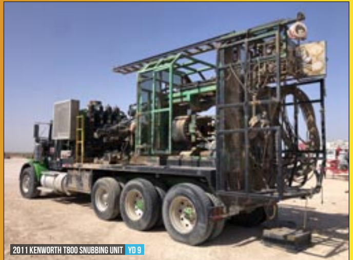
2011 KENWORTH T800 SNUBBING UNIT YD 9