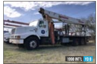
1998 INT'L YD 8

COMP., FLAT BOTTOM, HARDLINE RACKS, SKIDDED