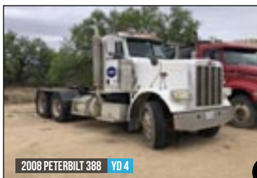
2008 PETERBILT 388 YD 4

3 POD PORTABLE BULK CEMENT TRAILER, W/ GARDNER DENVER 7-7/8" BLOWER, P/B DEUTZ DIESEL ENGINE