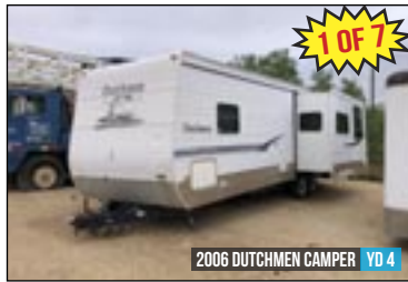
2006 DUTCHMEN CAMPER YD 4