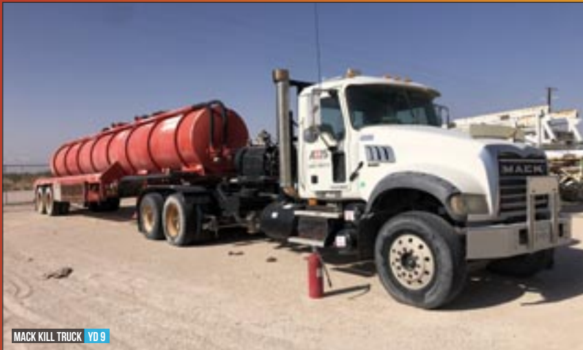
MACK KILL TRUCK YD 9