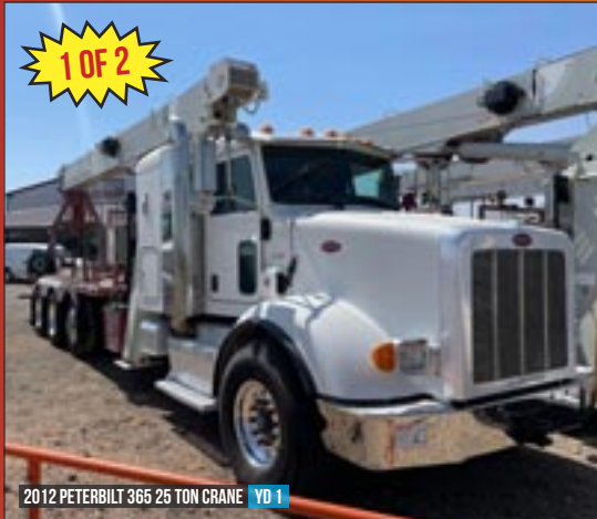
2012 PETERBILT 365 25 TON CRANE YD 1

DRILLING RIGS & COMPONENTS • WELL SERVICE RIGS & COMPONENTS • CONSTRUCTION • TRUCKS • TRAILERS