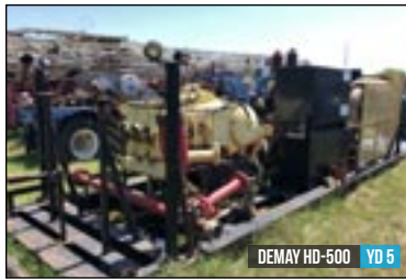
DEMAY HD-500 YD 5