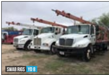
SWAB RIGS YD 8

MTD ON 8'W X 20'L SKID GARDNER DENVER TGH TRIPLEX PUMP , SN- 0010668, 8" STROKE, 400 HP, 10K WP, 175 MAX RPM, P/B DETROIT S-60 DIESEL ENGINE, ELEC START, GAUGES, RADIATOR, ALLISON 750 TRANS., 3X4 CENT PUMP, MANIFOLD, HYD OIL & FUEL TANKS, OPERATORS CONSOLE, MTD ON 8'W X 20'L SKID