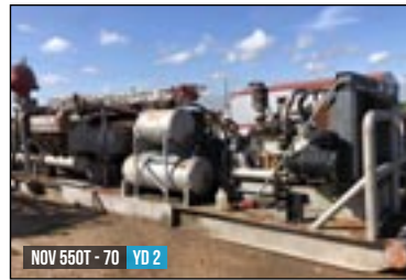
NOV 550T - 70 YD 2