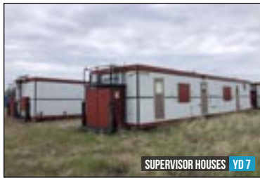
SUPERVISOR HOUSES YD 7

RADIATOR, ALLISON 750 TRANS., NOV PLUNGER PUMP GEAR REDUCER, SURGE CHAMBER, SHEAR RELIEF, MANIFOLD, 4X5 CENT PUMP, CONTROL PANEL, FUEL TANK, MTD ON 8'W X 25'L SKID (NOTE: PUMP INCOMPLETE)