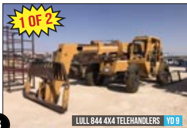
LULL 844 4X4 TELEHANDLERS YD 9