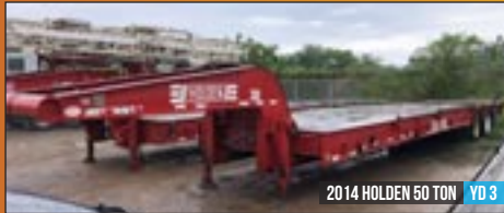
2014 HOLDEN 50 TON YD 3