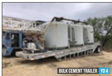
BULK CEMENT TRAILER YD 4

2009 VOLVO T/A DAY CAB 80 BBL BOBTAIL VAC TRUCK, P/B B13 VOLVO EATON ELEC SHIFT TRANS., W/ CLUTCH, 225" WB, DUAL PTO NVE VAC PUMP, ROPER PUMP, CAMEL