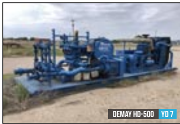
DEMAY HD-500 YD 7

EWS 400 TRIPLEX PUMP, 400 HP, 6" STROKE, P/B DETROIT S-60 DIESEL ENGINE, ELEC START, RADIATOR, GAUGES, ALLISON 750 TRANS., 4X5 CENT CHARGING PUMP, MANIFOLD, OPERATORS CONTROL, PANEL, FUEL TANK, MTD ON 8'W X 20'L SKID NOV JWS 165 TRIPLEX PUMP, SKIDDLESS ENGINE, W/ ENGINE