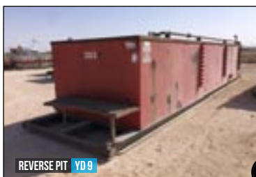
REVERSE PIT YD 9