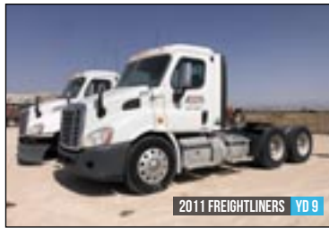
2011 FREIGHTLINERS YD 9

ROUGH RIDER TRIPLEX W/S PUMP SKID W/ ALLISON 750 TRANS., SKIDDED (PARTS)