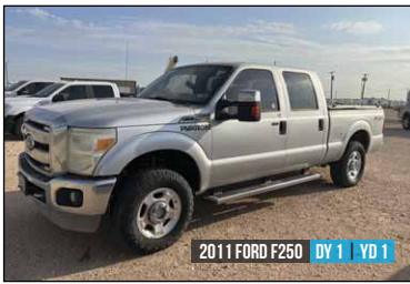
2011 FORD F250 DY 1 YD 1