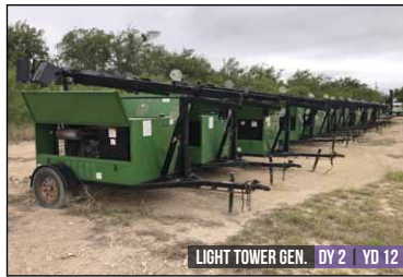
LIGHT TOWER GEN. DY 2 YD 12