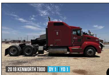
2018 KENWORTH T800 DY 1 YD 1

(2) 2012 - 2011 OVERLAND 2-COMP 120 BBL ACID TRANSPORT TRAILERS • 1979 HALLIBURTON T/A 2-COMP ACID TRAILER • (2) 2008 TREM CAR USA DOT 407 ALUMINUM TANK TRAILERS • 2016 TANKKO 130 BBL. VACUUM TRAILER • (2) 2015 TROXELL 140 BBL. VACUUM TRAILERS • (2) 2014 TROXELL TRI-AXLE VACUUM TRAILERS • 2014 TROXELL 140 BBL. VACUUM TRAILER • (6) 2014 TROXELL 130 BBL. VACUUM TRAILERS • (4) 2012-2005 130 BBL. VACUUM TRAILERS • (2) DRAGON VACUUM TRAILERS