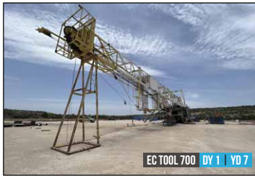
EC TOOL 700 DY 1 YD 7