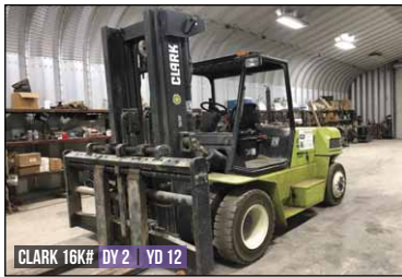
CLARK 16K# DY 2 YD 12