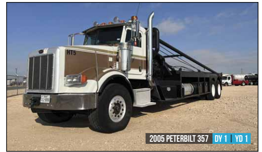
2005 PETERBILT 357 DY 1 YD 1