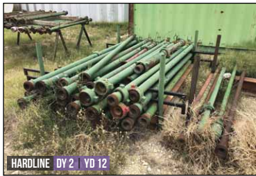
HARDLINE DY 2 YD 12