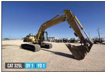
CAT 325L DY 1 YD 1