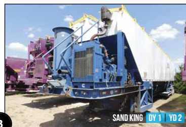
SAND KING DY 1 YD 2