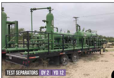
TEST SEPARATORS DY 2 YD 12