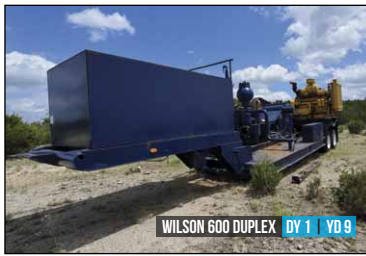
WILSON 600 DUPLEX DY 1 YD 9