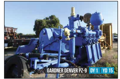
GARDNER DENVER PZ-9 DY 1 YD 15