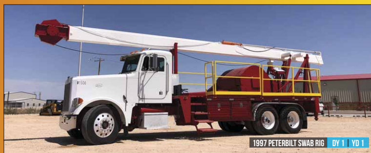
1997 PETERBILT SWAB RIG DY 1 | YD 1