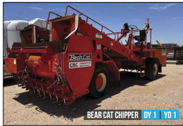
BEAR CAT CHIPPER DY 1 YD 1