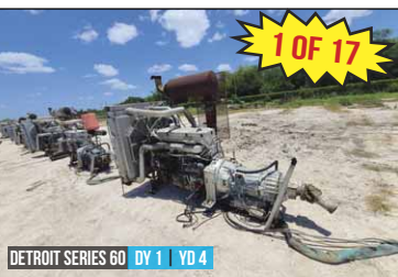
DETROIT SERIES 60 DY 1 YD 4

REAL ESTATE TO BE OFFERED @ 12:00 CST SUBJECT TO OWNERS CONFIRMATION: CALEB MATOTT 432-349-3330 LIC#453625