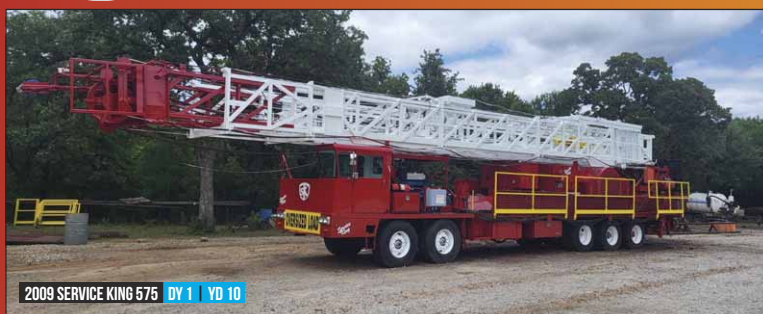
2009 SERVICE KING 576 DY 1 | YD 10

WELL SERVICE / DRILLING RIGS & COMPONENTS CONSTRUCTION • TRUCKS • TRAILERS • PICKUPS COMPLETE LIQUIDATION OF ARCHER WELL TESTING