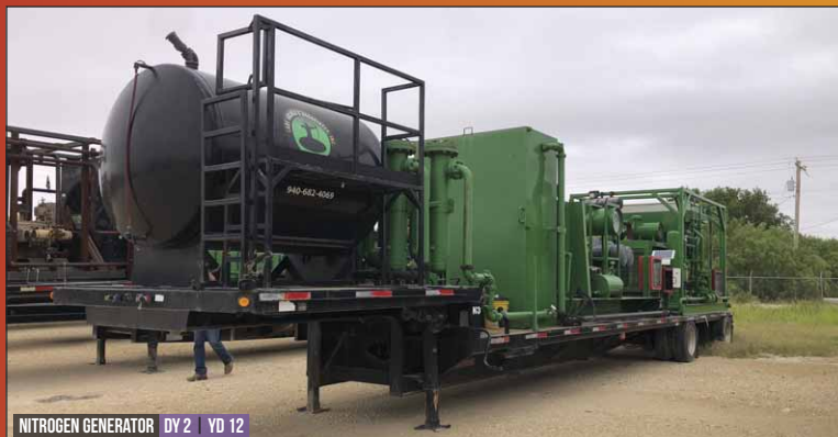
NITROGEN GENERATOR DY 2 | YD 12