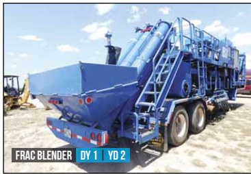
FRAC BLENDER DY 1 YD 2