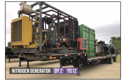
NITROGEN GENERATOR DY 2 YD 12