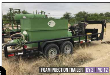
FOAM INJECTION TRAILER DY 2 YD 12

2003 S & H 16' T/A BP CREW / PARTS TRAILERS