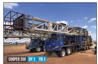
COOPER 350 DY 1 YD 1

PORTABLE FMC QUINTAPLEX Q16DRIVE 400 HP 10K# PUMP, P/B: CAT 3408T, SPICER TRANS, WET KIT, FILTER POD,