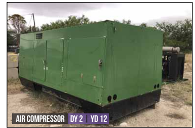
AIR COMPRESSOR DY 2 YD 12