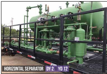
HORIZONTAL SEPARATOR DY 2 YD 12