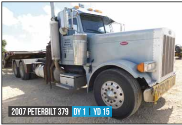
2007 PETERBILT 379 DY 1 YD 15