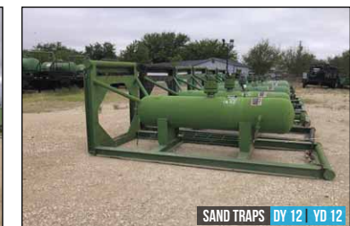
SAND TRAPS DY 12 YD 12