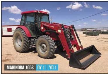
MAHINDRA 105S DY 1 YD 1