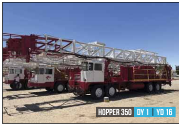
HOPPER 350 DY 1 YD 16