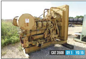
CAT 3508 DY 1 YD 15