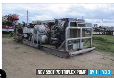
NOV 550T-7D TRIPLEX PUMP DY 1 YD 3

(3) 2015-2011 FORD F250 SUPER DUTY XLT 4X4 CREW CAB PICKUPS, P/B 6.2L GAS,