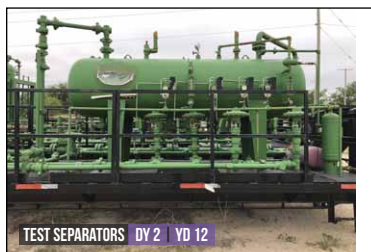
TEST SEPARATORS DY 2 YD 12