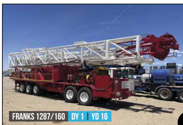
FRANKS 1287/160 DY 1 YD 16