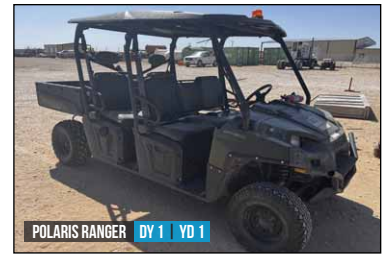
POLARIS RANGER DY 1 YD 1