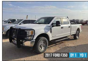
2017 FORD F350 DY 1 YD 1