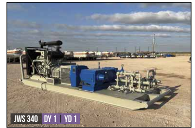
JWS 340 DY 1 YD 1