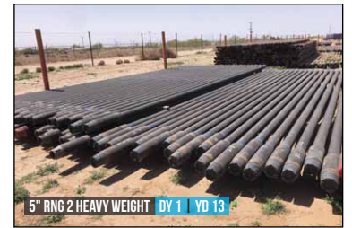
5' RING 2 HEAVY WEIGHT DY 1 YD 13

(12) BOP SKIDS, 14' X 8' W/ TOOL BASKETS, BOP STUMP