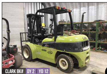
CLARK 8K# DY 2 YD 12

500 BBL S/A ROUND BOTTOM FRAC TANK 250 BBL S/A OPEN TOP TANK 6'W X 5'H X 24'L 3-COMPARTMENT REVERSE PIT W/ GAS BUSTER