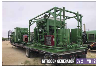
NITROGEN GENERATOR DY 2 YD 12