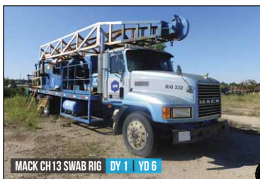
MACK CH13 SWAB RIG DY 1 YD 6

1996 INT'L 4900 DAY CAB WIRELINE TRUCK , P/B DT466 DIESEL ENGINE, 6 SPD TRANS., 254" WB W/ MTD ENCLOSED WIRELINE UNIT