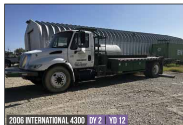
2006 INTERNATIONAL 4300 DY 2 YD 12