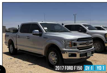
2017 FORD F150 DY 1 YD 1