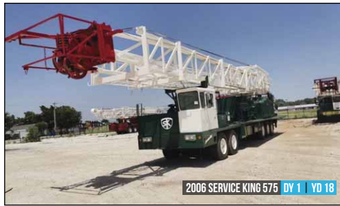
2006 SERVICE KING 575 DY 1 YD 1B