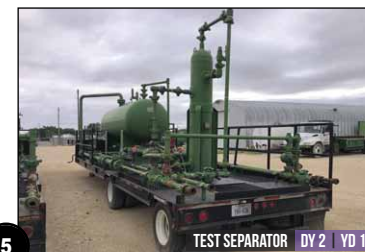
TEST SEPARATOR DY 2 YD 12

2009 SERVICE KING D/D 5 AXLE BACK IN WELL SERVICE RIG, P/B DETROIT S-60 DIESEL ENGINE, ALLISON 4500 OFS TRANSMISSION, 104 FT. X 250,000 HYD. RAISED & SCOPED MAST, DISC BRAKE, W/ 83A 24" 1" BLOCK, SHEAVE PLATE F/ FOSTER TONG, GUY WIRES, ROD TRANSFER CYL. W/ PEDAL & HOSES, LIFT LINE, TONGS, SLIPS, ELEVATORS, ROD ELEVATORS.