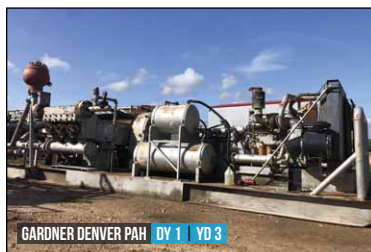
GARDNER DENVER PAH DY 1 YD 3

(4) 15K TRAILER MTD TEST SEPERATORS TRAILER MTD METER RUN MULTIPLE TRAILER MTD FLARE IGNITOR SYSTEMS 6K LINE HEATER, SKIDDED