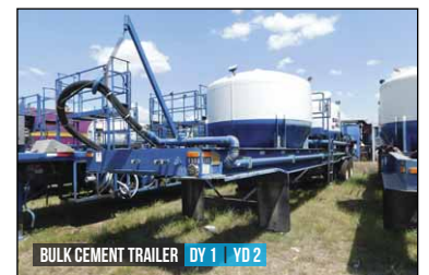
BULK CEMENT TRAILER DY 1 YD 2