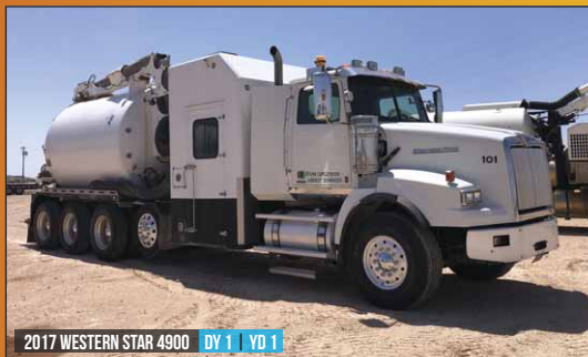
2017 WESTERN STAR 4900 DY 1 | YD 1