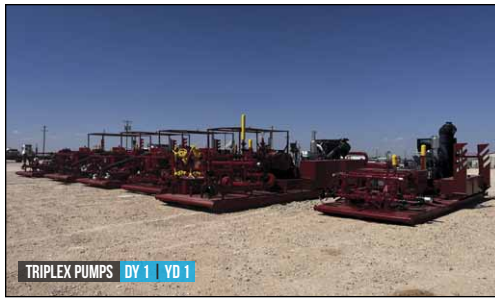
TRIPLEX PUMPS DY 1 YD 1