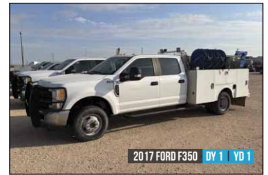
2017 FORD F350 DY 1 YD 1