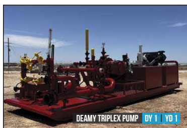
DEAMY TRIPLEX PUMP DY 1 YD 1

SKYTOP 650 BACK IN W/S RIG, P/B DETROIT S-60, ALLISON 5860 W/ 110'-275# MAST, MTD ON 5-AXLE CARRIER COOPER 350 BACK IN W/S RIG, P/B