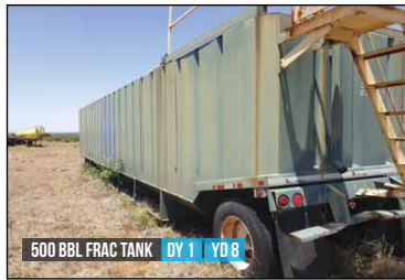
500 BBL FRAC TANK DY 1 YD 8