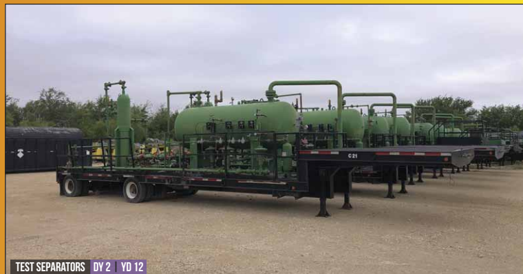
TEST SEPARATORS DY 2 | YD 12