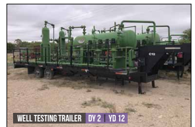
WELL TESTING TRAILER DY 2 YD 12