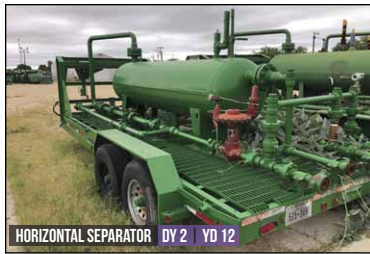
HORIZONTAL SEPARATOR DY 2 YD 12