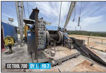
EC TOOL 700 DY 1 YD 7