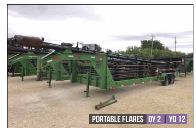
PORTABLE FLARES DY 2 YD 12

NATIONAL 10-P-130 TRIPLEX MUD PUMP, P/B CAT 3508 910 HP DIESEL