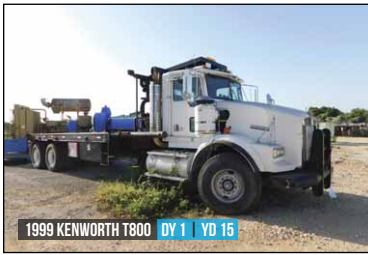
1999 KENWORTH T800 DY 1 YD 15