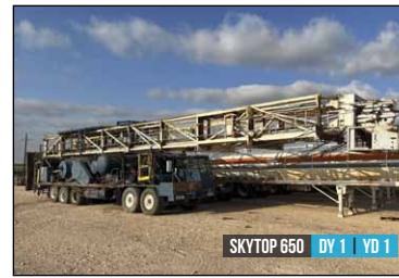
SKYTOP 650 DY 1 YD 1