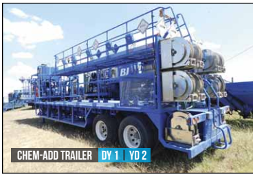
CHEM-ADD TRAILER DY 1 YD 2