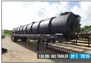
130 BBL VAC TRAILER DY 1 YD 15