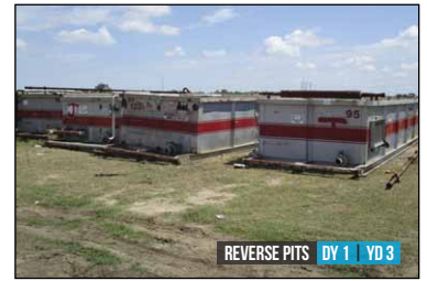
REVERSE PITS DY 1 YD 3