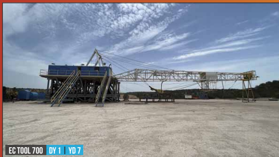
EC TOOL 700 DY 1 | YD 7