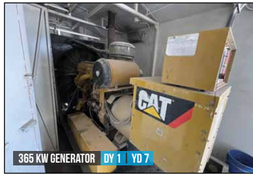
365 KW GENERATOR DY 1 YD 7