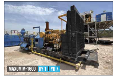
MAXUM M-1600 DY 1 YD 7