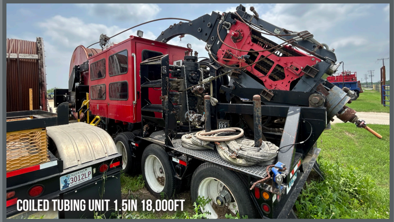
COILED TUBING UNIT 1.5IN 18,000FT