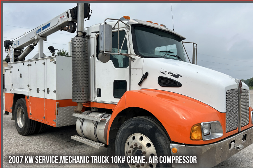
2007 KW SERVICE, MECHANIC TRUCK 10K# CRANE, AIR COMPRESSOR