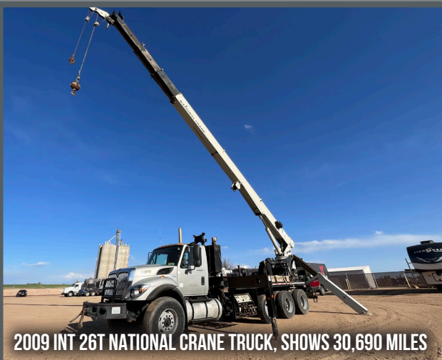
2009 INT 26T NATIONAL CRANE TRUCK, SHOWS 30,690 MILES