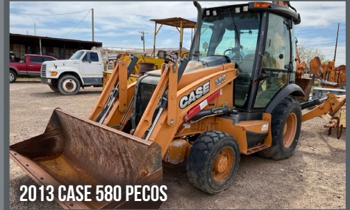
2013 CASE 580 PECOS