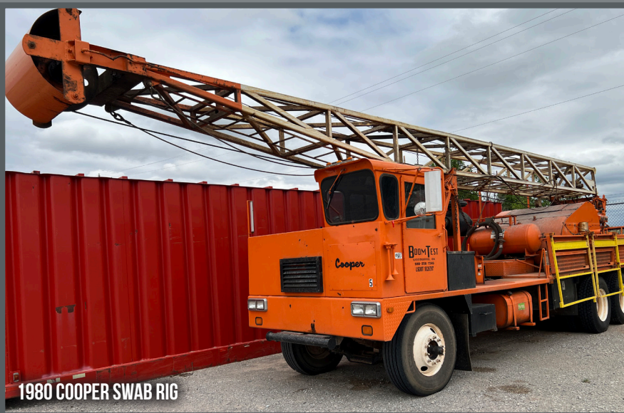
1980 COOPER SWAB RIG