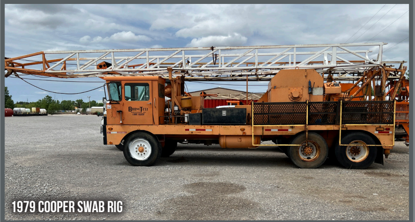
1979 COOPER SWAB RIG