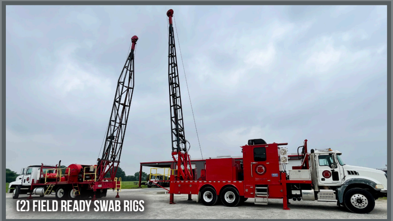
(2) FIELD READY SWAB RIGS