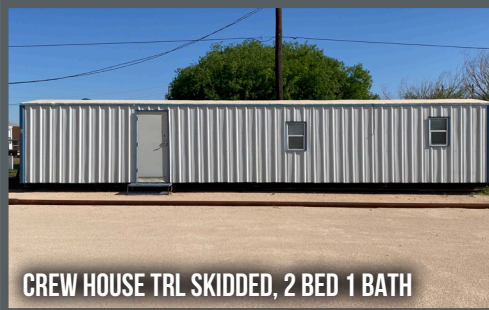
CREW HOUSE TRL SKIDDED, 2 BED 1 BATH