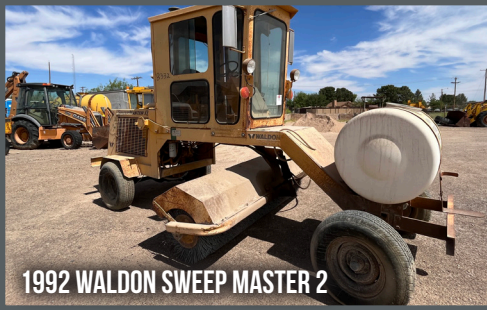
1992 WALDON SWEEP MASTER 2