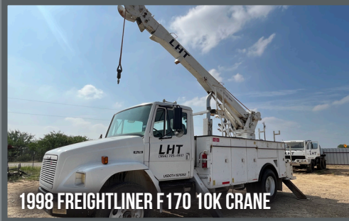
1998 FREIGHTLINER F170 10K CRANE