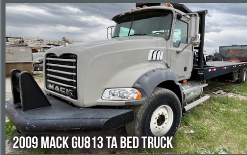
2009 MACK GU813 TA BED TRUCK