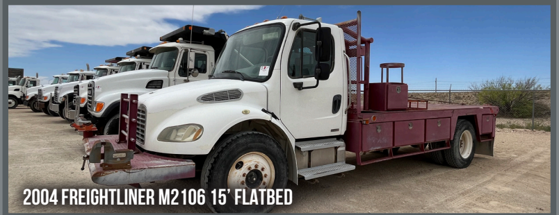
2004 FREIGHTLINER M2 106 15' FLATBED