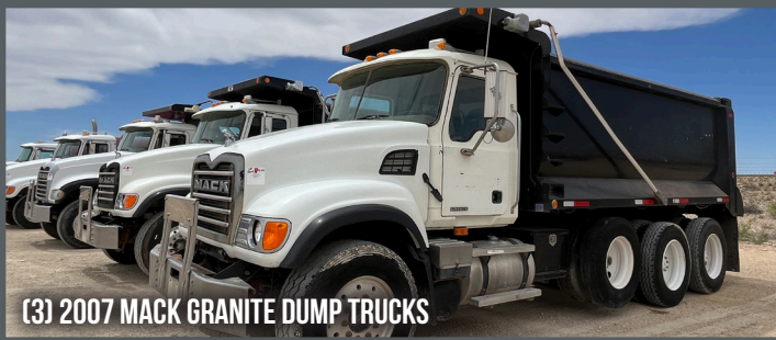
(3) 2007 MACK GRANITE DUMP TRUCKS