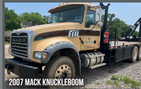
2007 MACK KNUCKLEBOOM