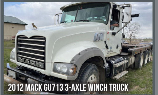
2012 MACK GU713 3-AXLE WINCH TRUCK