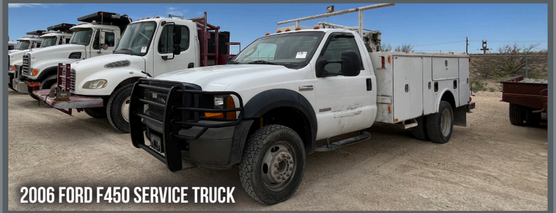
2006 FORD F450 SERVICE TRUCK