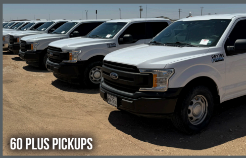
60 PLUS PICKUPS