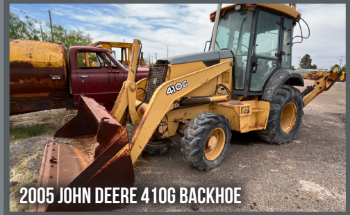
2005 JOHN DEERE 410G BACKHOE