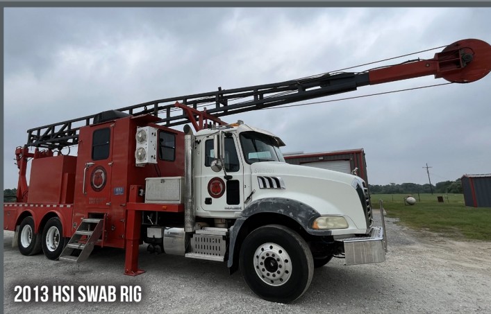
2013 HSI SWAB RIG