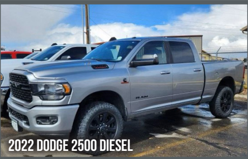
2022 DODGE 2500 DIESEL