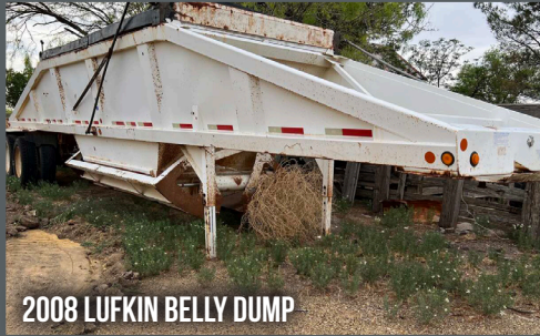
2008 LUFKIN BELLY DUMP