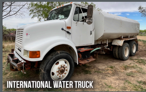
INTERNATIONAL WATER TRUCK