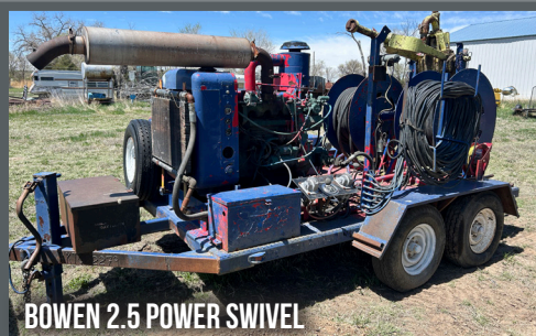
BOWEN 2.5 POWER SWIVEL