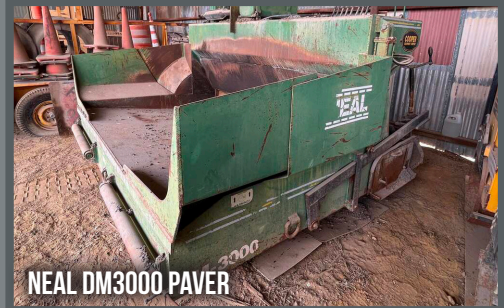
NEAL DM3000 PAVER