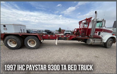
1997 IHC PAYSTAR 9300 TA BED TRUCK