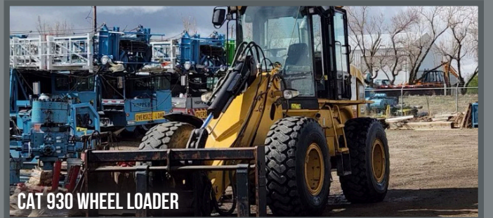
CAT 930 WHEEL LOADER