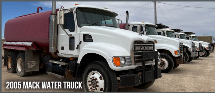
2005 MACK WATER TRUCK