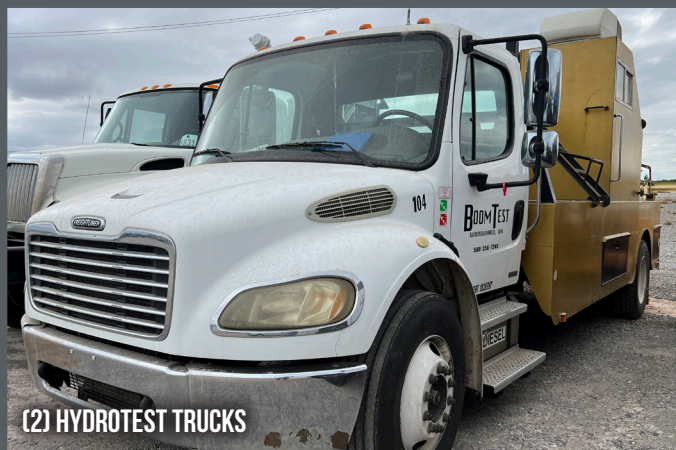
(2) HYDROTEST TRUCKS