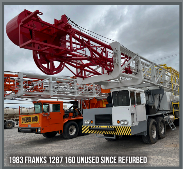
1983 FRANKS 1287 160 UNUSED SINCE REURBED