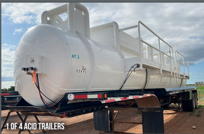
1 OF 4 ACID TRAILERS