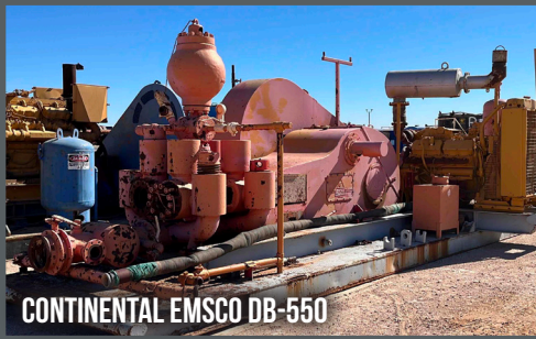
CONTINENTAL EMSCO DB-550