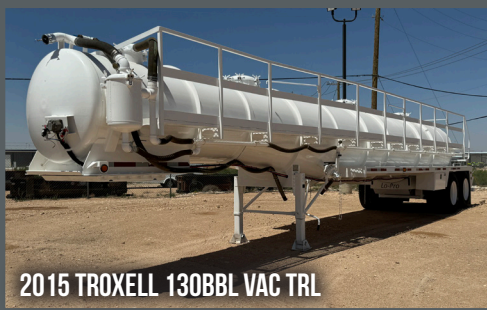
2015 TROXELL 130BBL VAC TRL