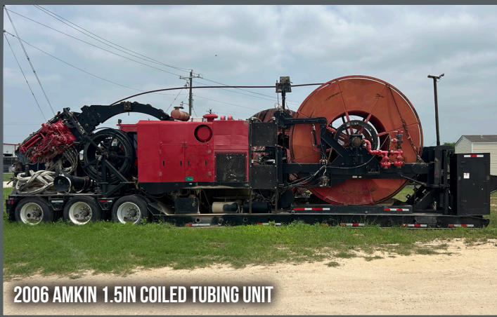
2006 AMKIN 1.5IN COILED TUBING UNIT