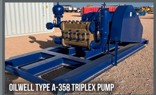
OILWELL TYPE A-358 TRIPLEX PUMP