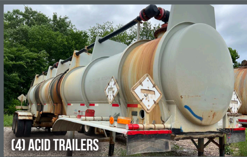
(4) ACID TRAILERS