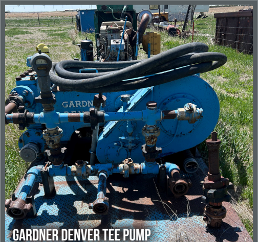
GARDNER DENVER TEE PUMP