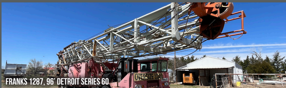
FRANKS 1287, 96' DETROIT SERIES 60