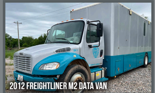
2012 FREIGHTLINER M2 DATA VAN