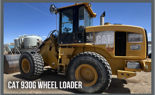
CAT 930G WHEEL LOADER