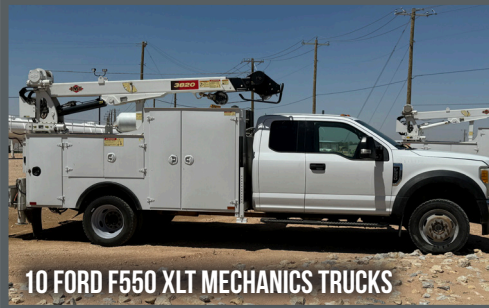
10 FORD F550 XLT MECHANICS TRUCKS