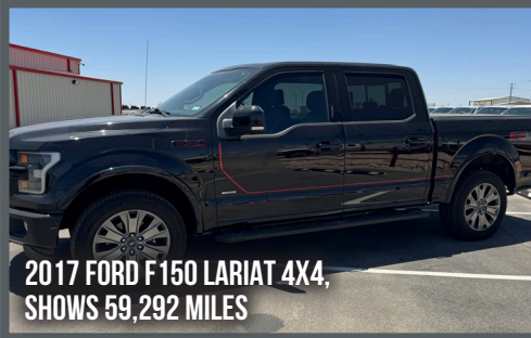
2017 FORD F150 LARIAT 4X4, SHOWS 59,292 MILES