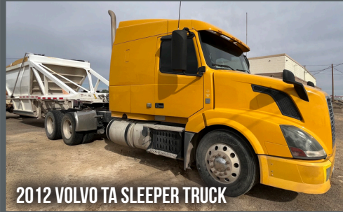
2012 VOLVO TA SLEEPER TRUCK