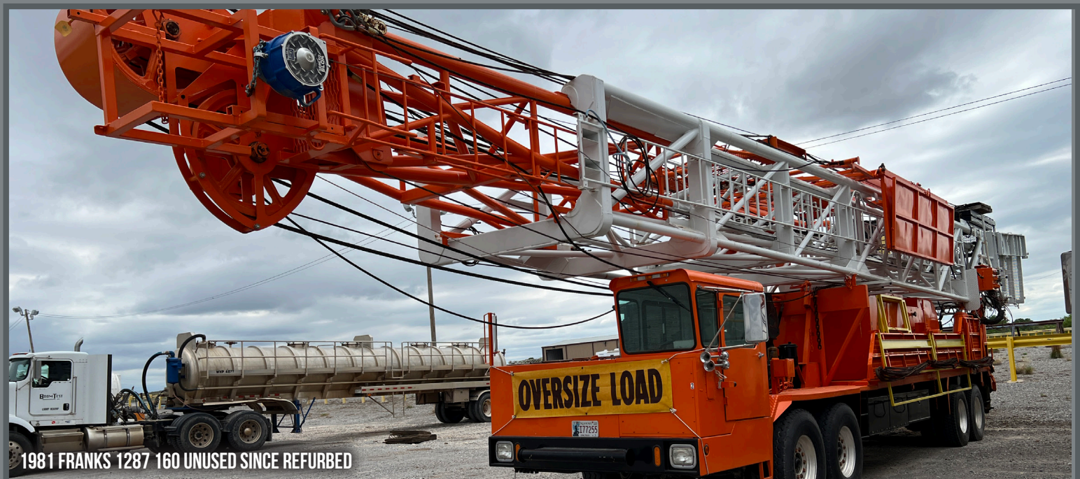
1981 FRANKS 1287 160 UNUSED SINCE REURBED