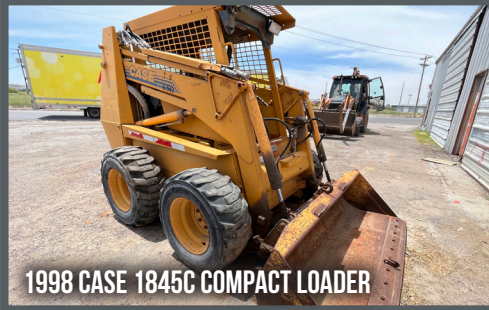
1998 CASE 1845C COMPACT LOADER