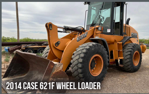
2014 CASE 621F WHEEL LOADER