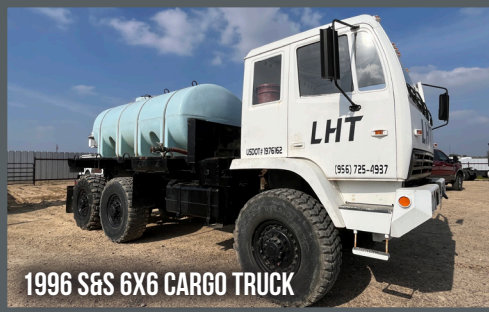
1996 S&S 6X6 CARGO TRUCK