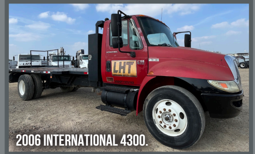
2006 INTERNATIONAL 4300.