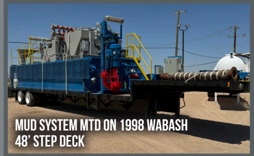
MUD SYSTEM MTD ON 1998 WABASH 48' STEP DECK