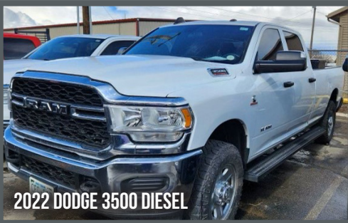
2022 DODGE 3500 DIESEL