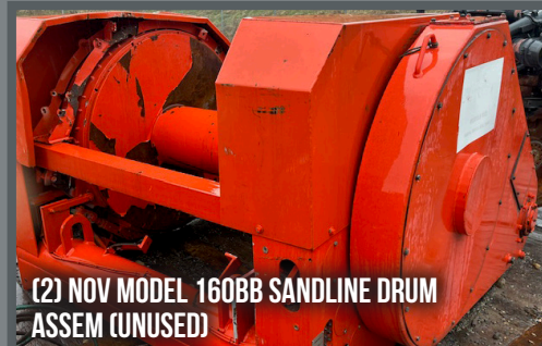
(2) NOV MODEL 160BB SANDLINE DRUM ASSEM (UNUSED)