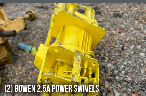
(2) BOWEN 2.5A POWER SWIVELS