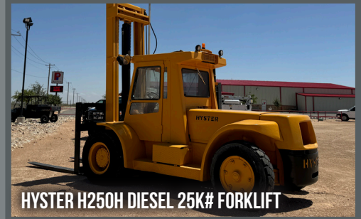
HYSTER H250H DIESEL 25K# FORKLIFT