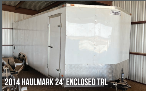
2014 HAULMARK 24' ENCLOSED TRL