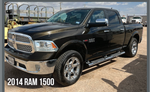
2014 RAM 1500