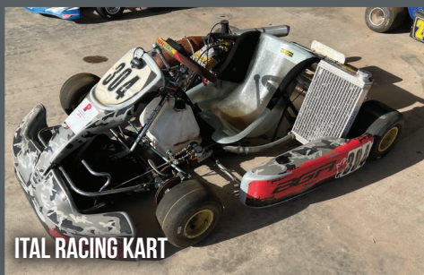
ITAL RACING KART