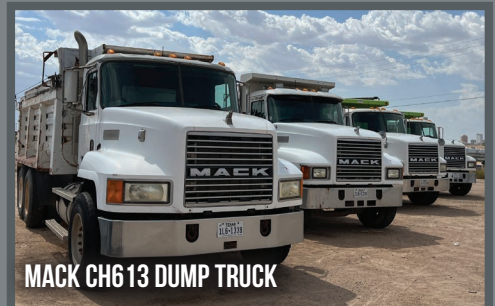
MACK CH613 DUMP TRUCK

VISIT OUR WEBSITE FOR UPDATES & MORE INFORMATION!