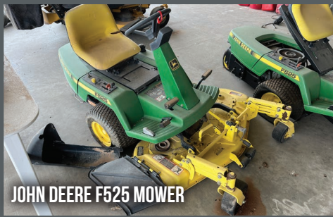
JOHN DEERE F525 MOWER