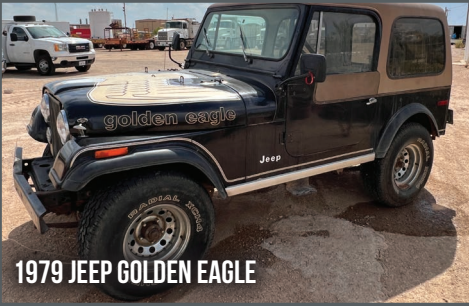
1979 JEEP GOLDEN EAGLE