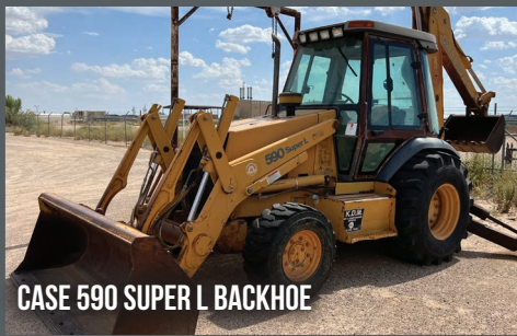
CASE 590 SUPER L BACKHOE