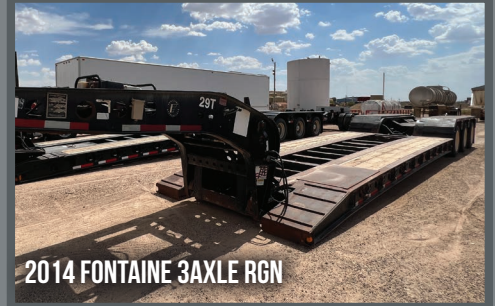
2014 FONTAINE 3AXLE RGN