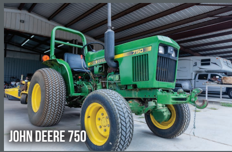
JOHN DEERE 750