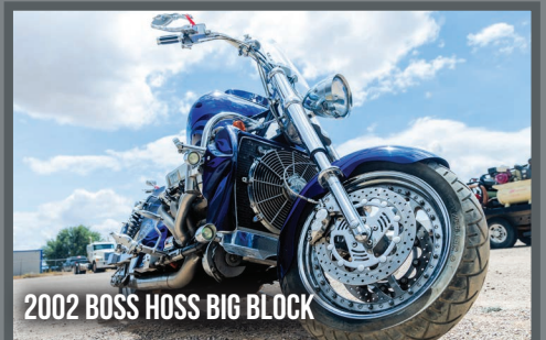
2002 BOSS HOSS BIG BLOCK