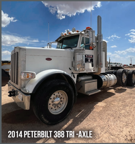
2014 PETERBILT 388 TRI-AXLE