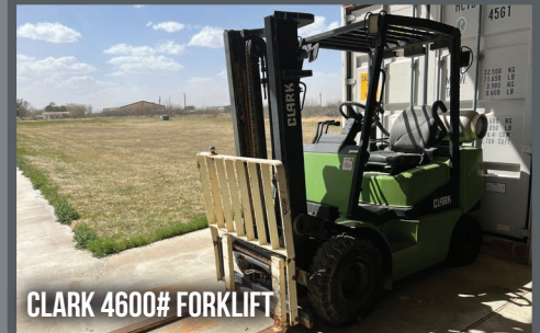
CLARK 4600# FORKLIFT

VISIT OUR WEBSITE FOR UPDATES & MORE INFORMATION!