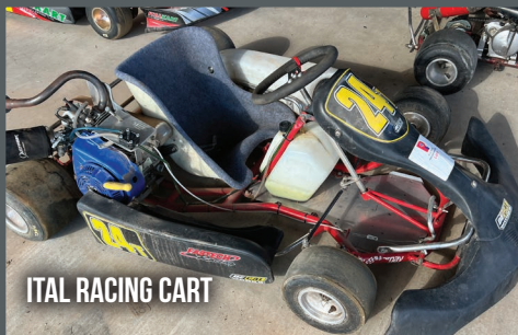
ITAL RACING KART