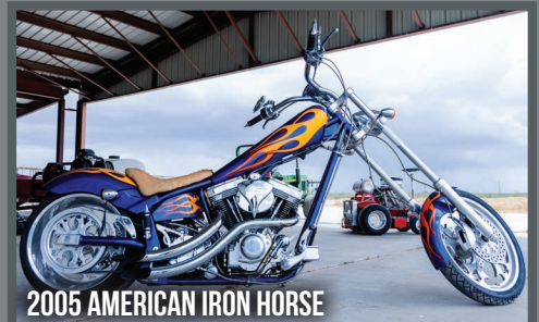
2005 AMERICAN IRON HORSE