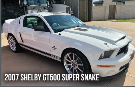
2007 SHELBY GT500 SUPER SNAKE