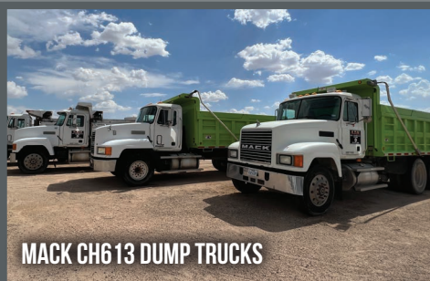
MACK CH613 DUMP TRUCKS