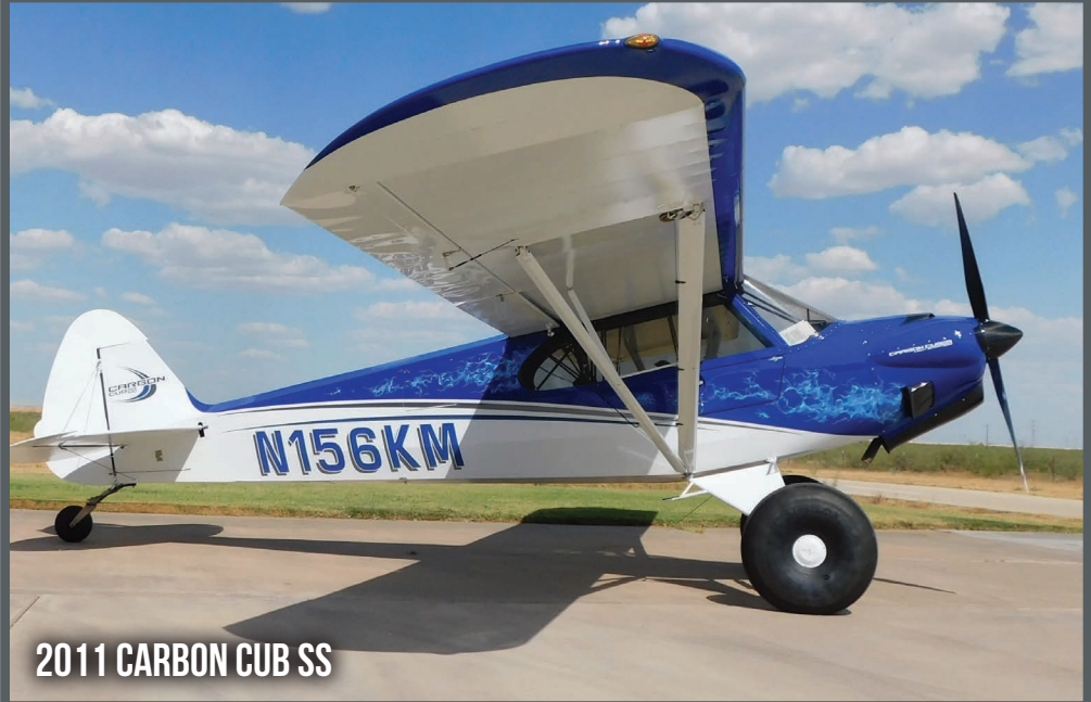
2011 CARBON CUB SS