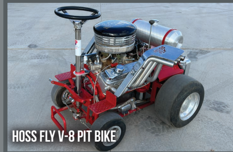
HOSS FLY V-8 PIT BIKE