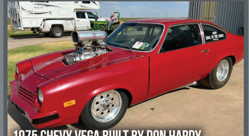
1975 CHEVY VEGA BUILT BY DON HARDY