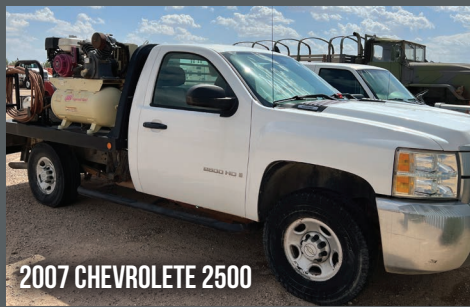
2007 CHEVROLETE 2500