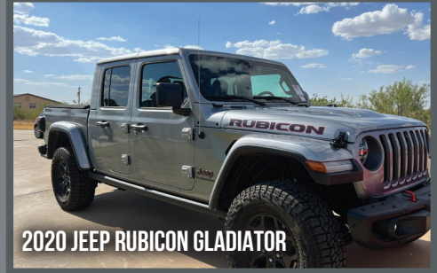
2020 JEEP RUBICON GLADIATOR