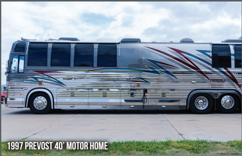
1997 PREVOST 40' MOTOR HOME