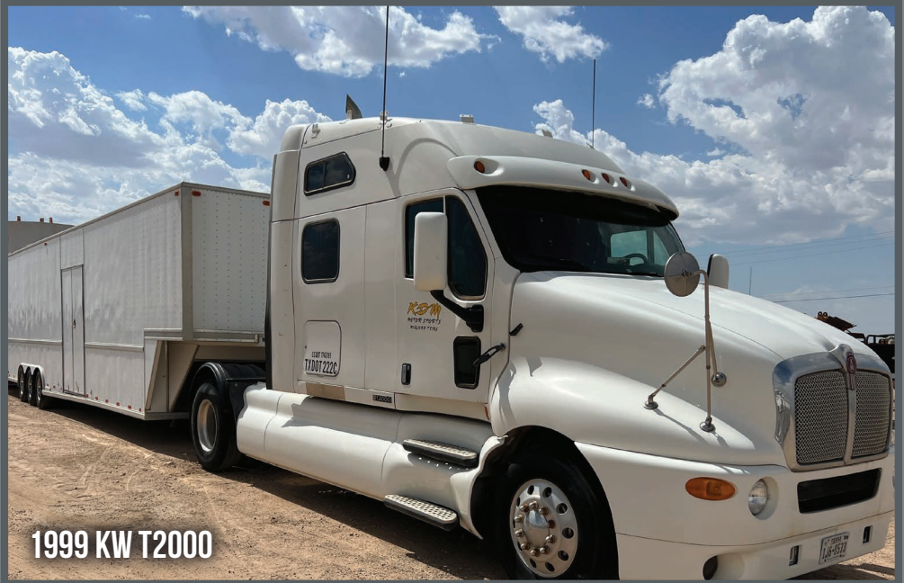
1999 KW T2000