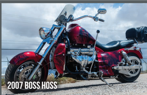
2007 BOSS HOSS