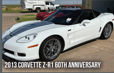
2013 CORVETTE Z-R1 60TH ANNIVERSARY