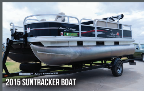
2015 SUNTRACKER BOAT