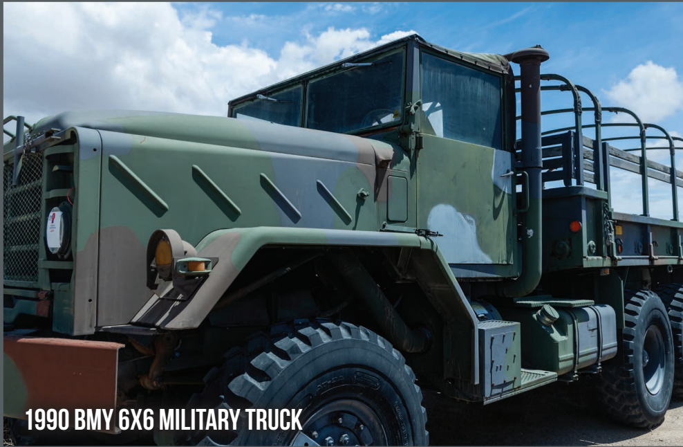
1990 BMY 6X6 MILITARY TRUCK