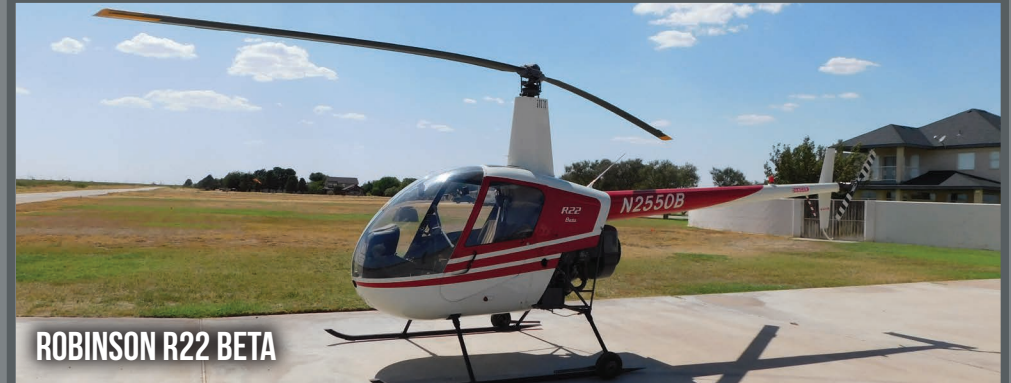
ROBINSON R22 BETA