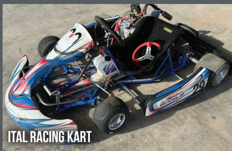
ITAL RACING KART