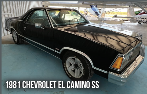
1981 CHEVROLET EL CAMINO SS