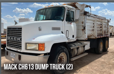
MACK CH613 DUMP TRUCK (2)