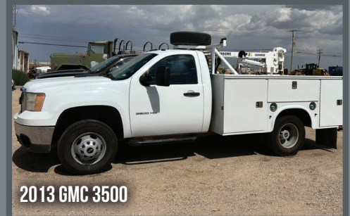
2013 GMC 3500