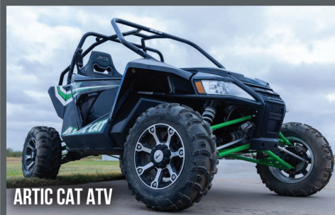
ARTIC CAT ATV