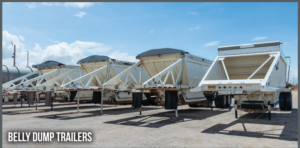
BELLY DUMP TRAILERS