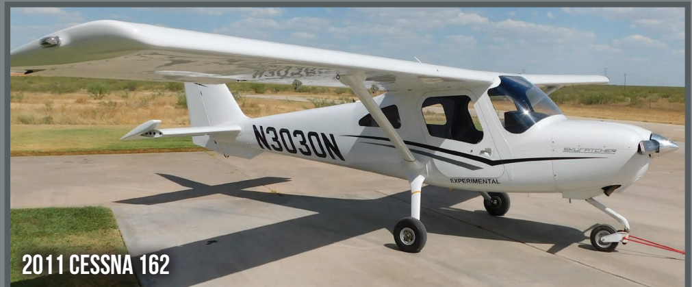
2011 CESSNA 162