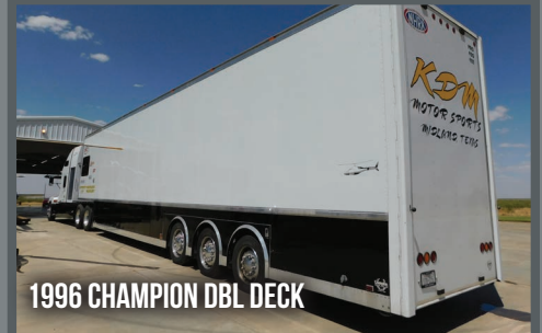
1996 CHAMPION DBL DECK