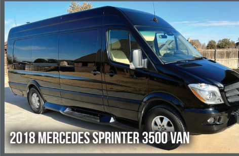
2018 MERCEDES SPRINTER 3500 VAN