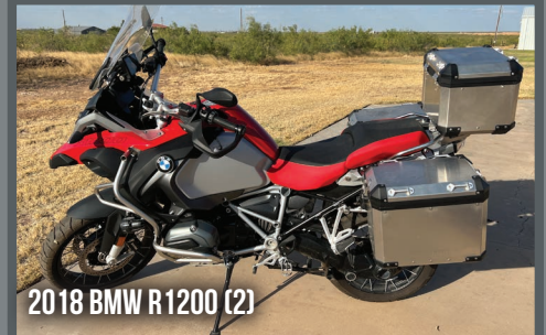
2018 BMW R1200 (2)

VISIT OUR WEBSITE FOR UPDATES & MORE INFORMATION!