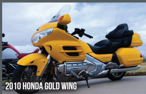
2010 HONDA GOLD WING