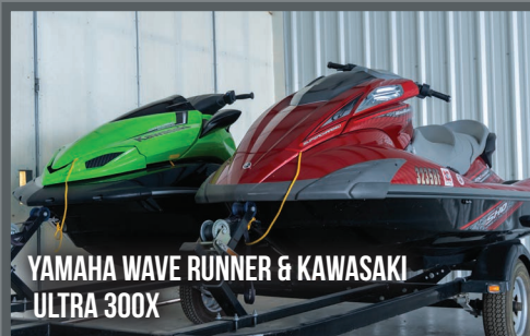
YAMAHA WAVE RUNNER & KAWASAKI ULTRA 300X