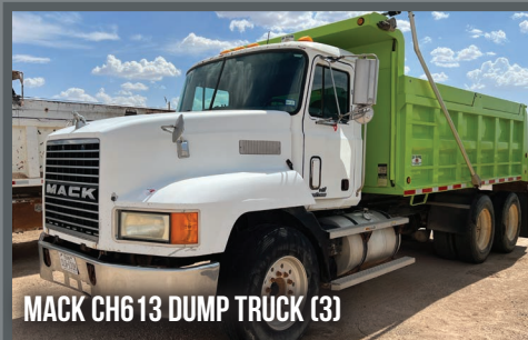
MACK CH613 DUMP TRUCK (3)