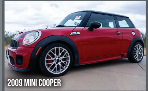
2009 MINI COOPER