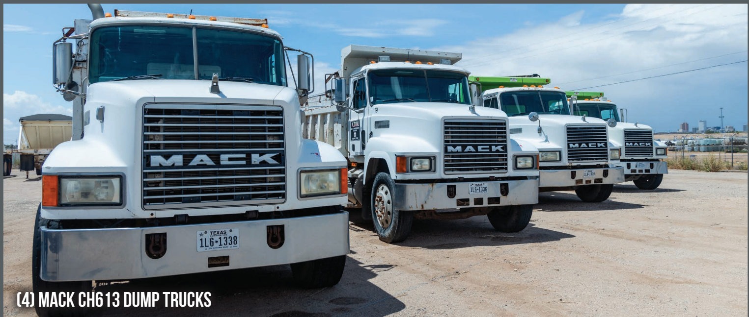
(4) MACK CH613 DUMP TRUCKS

VISIT OUR WEBSITE FOR UPDATES & MORE INFORMATION!