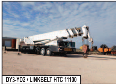
DY3-YD2 • LINKBELT HTC 11100