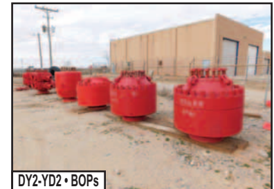
DY2-YD2 • BOPs