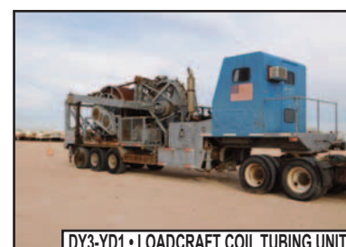
DY3-YD1 • LOADCRAFT COIL TUBING UNIT