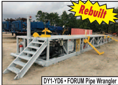
DY1-YD6 • FORUM Pipe Wrangler