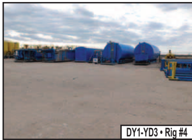
DY1-YD3 • Rig #4