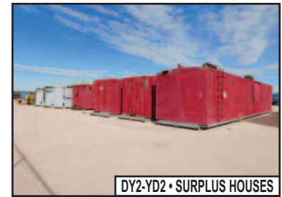
DY2-YD2 • SURPLUS HOUSES

(50)-6-1/2" & (15)-8" DRILL COLLARS APPROX. 22,000'- 4-1/2" XH 16.60, G- 105 DRILL PIPE