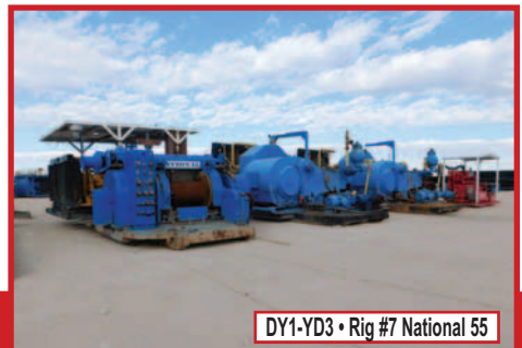
DY1-YD3 • Rig #7 National 55