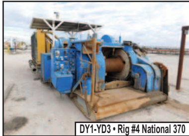
DY1-YD3 • Rig #4 National 370