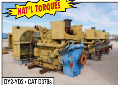
DY2-YD2 • CAT D379s