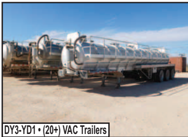
DY3-YD1 • (20+) VAC Trailers