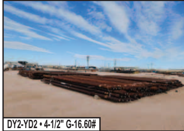
DY2-YD2 • 4-1/2" G-16.60#