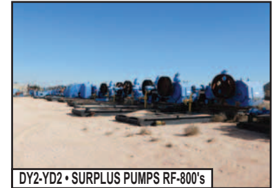
DY2-YD2 • SURPLUS PUMPS RF-800's