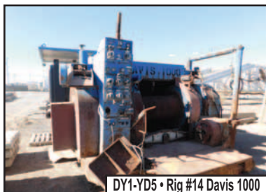
DY1-YD5 • Rig #14 Davis 1000