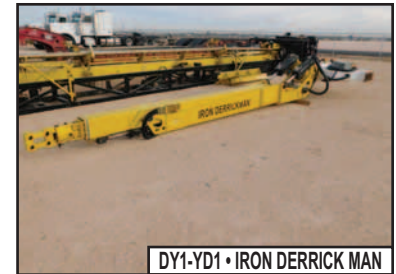
DY1-YD1 • IRON DERRICK MAN