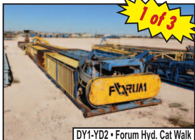
DY1-YD2 • Forum Hyd. Cat Walk