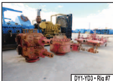
DY1-YD3 • Rig #7