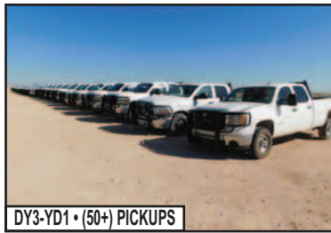
DY3-YD1 • (50+) PICKUPS