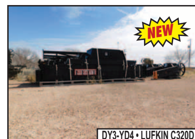
DY3-YD4 • LUFKIN C320D