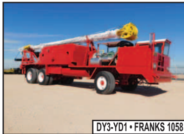
DY3-YD1 • FRANKS 1058