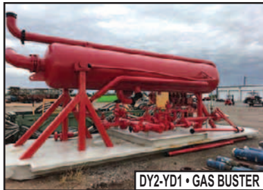
DY2-YD1 • GAS BUSTER