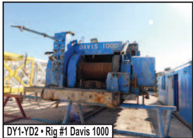
DY1-YD2 • Rig #1 Davis 1000