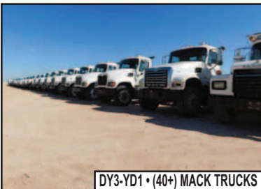
DY3-YD1 • (40+) MACK TRUCKS