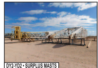
DY2-YD2 • SURPLUS MASTS