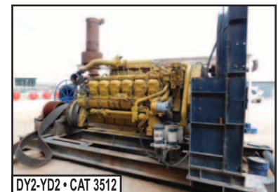
DY2-YD2 • CAT 3512