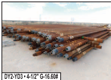
DY2-YD3 • 4-1/2" G-16.60#