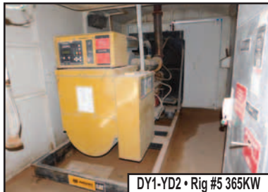
DY1-YD2 • Rig #5 365KW