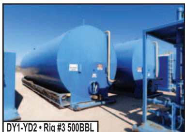
DY1-YD2 • Rig #3 500BBL