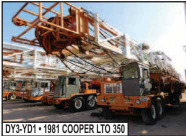
DY3-YD1 • 1981 COOPER LTO 350