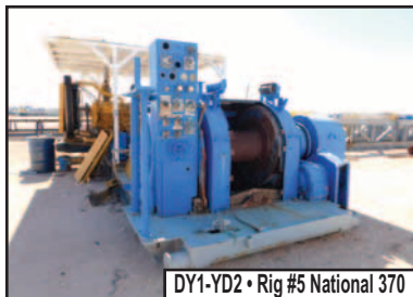
DY1-YD2 • Rig #5 National 370