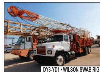
DY3-YD1 • WILSON SWAB RIG