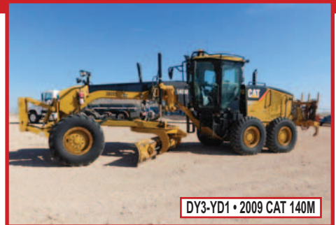
DY3-YD1 • 2009 CAT 140M

(12) COMPLETE DRILLING RIGS (SOME STILL WORKING) DRILLING COMPONENTS PIPE & COLLARS • PICKUPS WELL SERVICE RIGS TRUCKS • COIL TUBING RIG TRAILERS • CREW TRAILERS WELL SERVICE TOOLS CREW TRAILERS