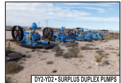
DY2-YD2 • SURPLUS DUPLEX PUMPS