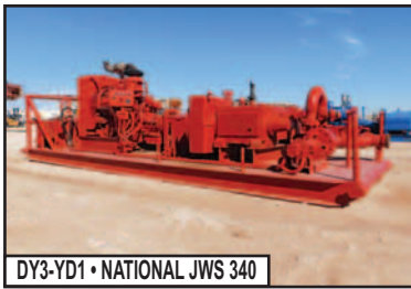
DY3-YD1 • NATIONAL JWS 340