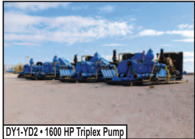
DY1-YD2 • 1600 HP Triplex Pump