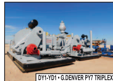
DY1-YD1 • G.DENVER PY7 TRIPLEX

WELD ON FITTINGS • BALL VALVES • CHECK VALVES • WELL HEADS & COMPONENTS • TUBING SUBS • FILTERS • HAND TOOLS • SWAB MANDERALS • SWAB CUPS • ROD ELEVATOR PLATES & PARTS • TONG & SLIP DIES • ROLLER CHAIN • NIPPLES • BULL PLUGS • SWAGES • COUPLINGS • PPE • BOLTS • CABLE CLAMPS • HAMMER WRENCHES • GASKETS • V-BELTS • HOSES • PIPE THREADER COMPONENTS • MUCH, MUCH MORE