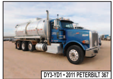
DY3-YD1 • 2011 PETERBILT 367