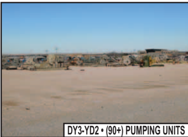
DY3-YD2 • (90+) PUMPING UNITS