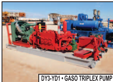
DY3-YD1 • GASO TRIPLEX PUMP