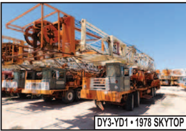
DY3-YD1 • 1978 SKYTOP