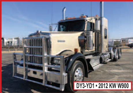
DY3-YD1 • 2012 KW W900

WED/THURS/FRI • MARCH 20/21/22, 2019 9:00A.M. (CST) @ THE MIDLAND COUNTY HORSESHOE ARENA