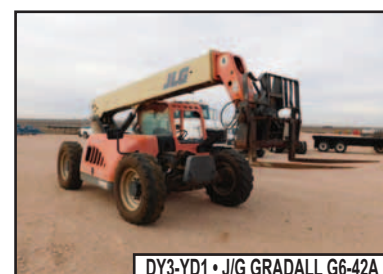
DY3-YD1 • J/G GRADALL G6-42A