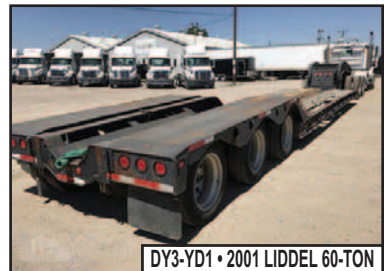
DY3-YD1 • 2001 LIDDEL 60-TON