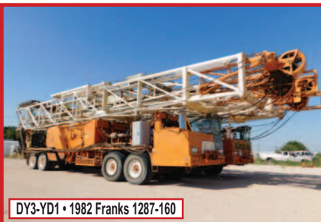
DY3-YD1 • 1982 Franks 1287-160