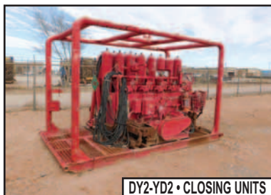
DY2-YD2 • CLOSING UNITS