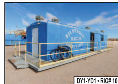
DY1-YD1 • RIG# 10