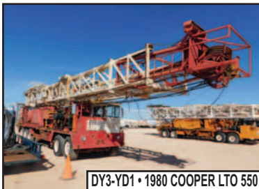
DY3-YD1 • 1980 COOPER LTO 550