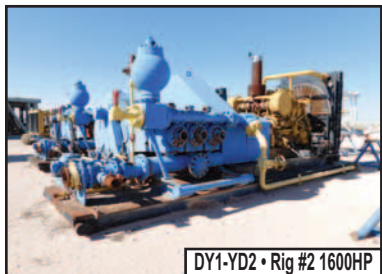
DY1-YD2 • Rig #2 1600HP