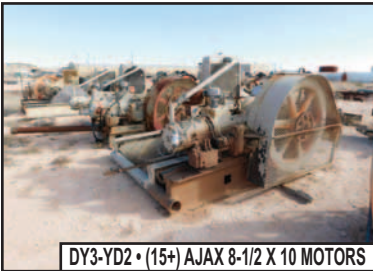
DY3-YD2 • (15+) AJAX 8-1/2 X 10 MOTORS