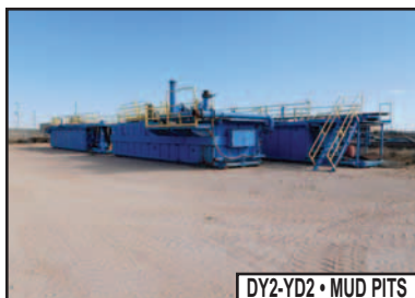
DY2-YD2 • MUD PITS