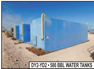
DY2-YD2 • 500 BBL WATER TANKS