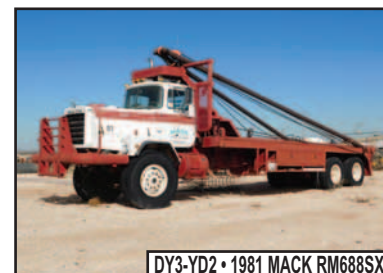
DY3-YD2 • 1981 MACK RM688SX