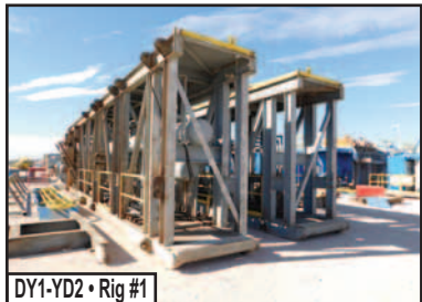
DY1-YD2 • Rig #1