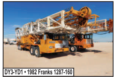
DY3-YD1 • 1982 Franks 1287-160