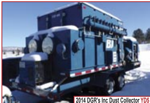
2014 DGR's Inc Dust Collector YD5