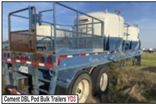
Cement DBL Pod Bulk Trailers YD3