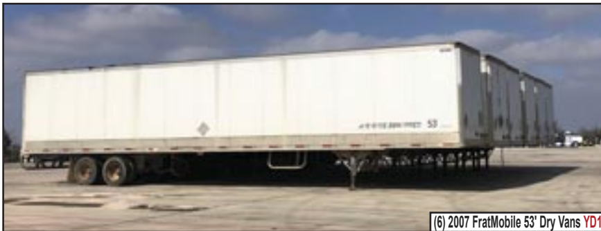
(6) 2007 FratMobile 53' Dry Vans YD1

GORILLA GARDNER DENVER TRIPLEX FRAC PUMP, P/B