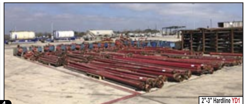
2"-3" Hardline YD1