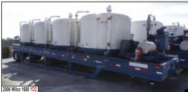
2006 Wilco 1600 YD2

FMC TECHNOLOGIES TRIPLEX FRAC PUMP, P/B CUMMINS QSK50 DIESEL ENGINE, ALLISON 9820 TRANS., W/ 2014 BLACK HORSE BY CAT FLUID END, MTD ON 2009 PRATT T/A TRAILER, SHOWS 2479 ENGINE HRS & 4067 PUMP HRS