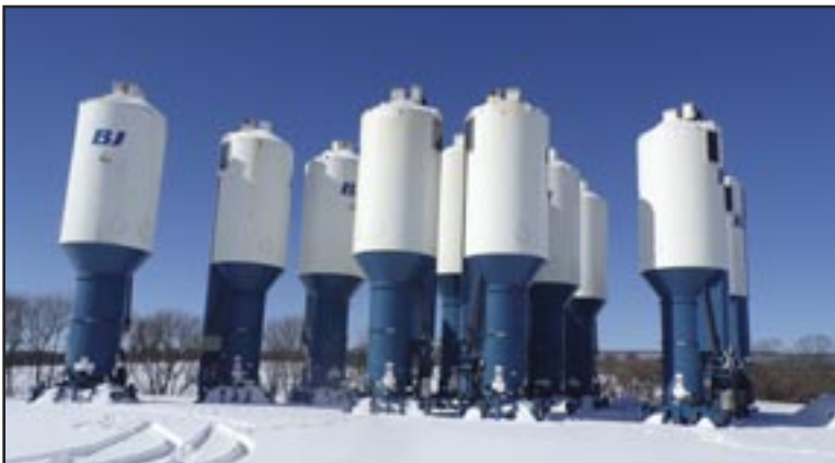
180T 3200 Cu FT Silos YD5

(6) 2014-2010 APPCO T/A DUAL BELT SAND CONVEYORS, P/B (2) CUMMINS 4 CYL DIESEL ENGINES