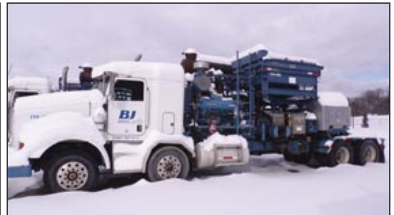
2007 Pete 357 w/ OPI-1800 Frac Pump YD5