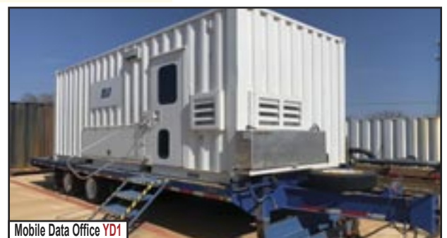
Mobile Data Office YD1