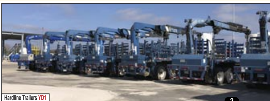
Hardline Trailers YD1

2020 GORILLA GARDNER DENVER 3000 TRIPLEX FRAC PUMP, P/B CUMMINS QSK60 DIESEL ENGINE, CAT TH55 TRANS., W/ 2020