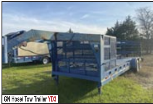
GN Hose/ Tow Trailer YD3