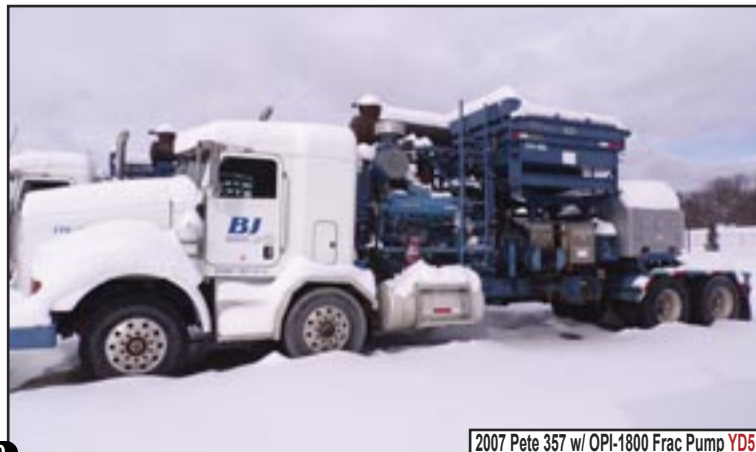
2007 Pete 357 w/ OPI-1800 Frac Pump YD5