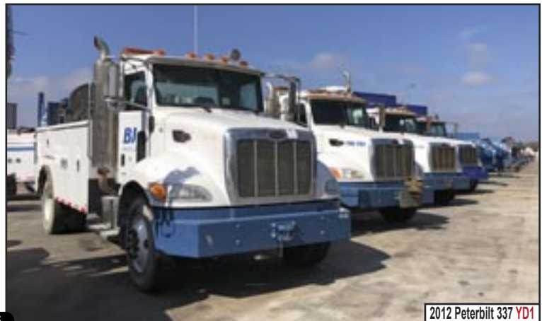
2012 Peterbilt 337 YD1

(7) 2013-2011 PETERBILT 367 T/A WINCH HAUL TRUCKS, P/B CUMMINS ISX 485HP DIESEL ENGINE, 8 SPD HI LOW EATON FULLER TRANS., 232" WB, W/ WET KIT, BRADEN HYDRAULIC AMS20-188 40K# WINCH W/ BRAKE ½ RTB, HR