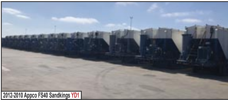
2012-2010 Appco FS40 Sandkings YD1