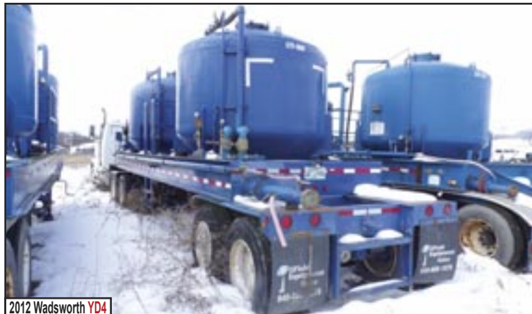
2012 Wadsworth YD4