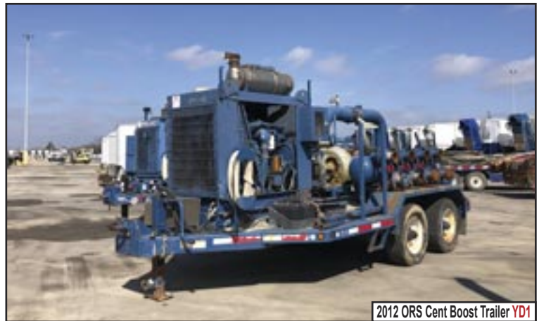
2012 ORS Cent Boost Trailer YD1

2019 GARDNER DENVER 2500Q QUINTUPLEX FRAC PUMP, P/B CAT 3512C BI FUEL ENGINE, CAT TH55 TRANS., W/ 2019 GARDNER DENVER FLUID END, MTD ON 2014 DRAGON 3 AXLE TRAILER, SHOWS 1785 PUMP HRS