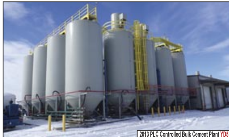
2013 PLC Controlled Bulk Cement Plant YD5

2011 AMERITRAIL COMPRESSOR TRAILER , P/B CUMMINS 4 CYL DIESEL ENGINE, GARDNER