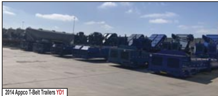
2014 Appco T-Belt Trailers YD1

2019 GARDNER DENVER 2500Q QUINTUPLEX FRAC PUMP, P/B CAT 3512C DIESEL ENGINE, CAT TH55 TRANS., W/ SPM QWS2500 FLUID END, MTD ON 2015 DRAGON 3 AXLE TRAILER, SHOWS 15548 ENGINE HRS & 2553 PUMP HRS