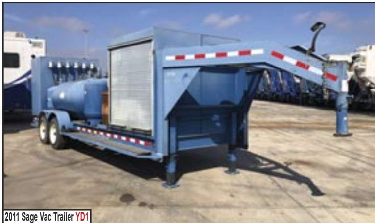
2011 Sage Vac Trailer YD1