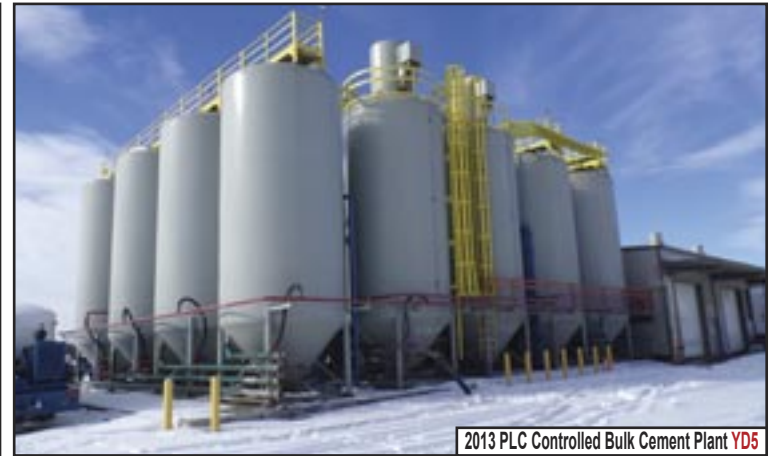
2013 PLC Controlled Bulk Cement Plant YD5

2011 AMERITRAIL COMPRESSOR TRAILER, P/B CUMMINS 4 CYL DIESEL ENGINE, GARDNER