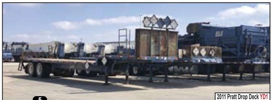
2011 Pratt Drop Deck YD1