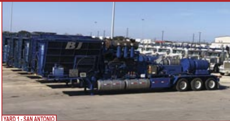
YARD 1 - SAN ANTONIO

2013 PLC CONTROLLED DOUBLE SIDED CEMENT BULK PLANT, W/ (14) 3000 CU FT SILOS, & (6) 700 CU FT BLEND TANKS W/ DUST COLLECTORS ON TOP, (2) MIXING TUBS, W/ AIR WALL ENVIROSYSTEM, 2012 CURTIS AIR COMPRESSOR SF-20, P/B 20 HP ELECTRIC MOTOR