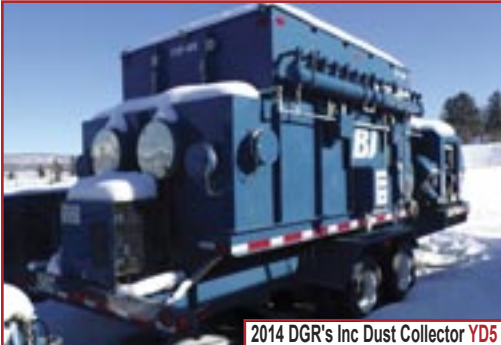
2014 DGR's Inc Dust Collector YD5