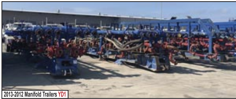
2013-2012 Manifold Trailers YD1