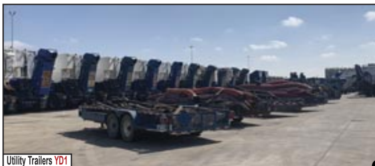
Utility Trailers YD1

SPM TRIPLEX FRAC PUMP , P/B CUMMINS SK50 DIESEL ENGINE, ALLISON S9823 TRANS., W/ 2019 SPM TWS2250 FLUID END, MTD ON 2011 PRATT T/A TRAILER, SHOWS 13686 ENGINE HRS & 2904 PUMP HRS