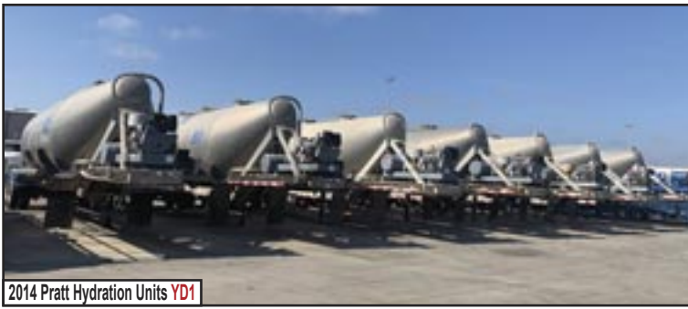
2014 Pratt Hydration Units YD1