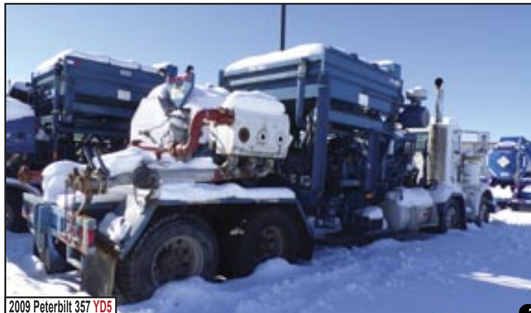
2009 Peterbilt 357 YD5

(3) 2011-2010 KEYSTONE T/A PUMP BOOSTER TRAILER, P/B CUMMINS 6.7 DIESEL ENGINE W/ 10X8X14 CENT PUMP (2) VALVE INTAKE MANIFOLDS & (8) VALVE MANIFOLD DISCHARGE