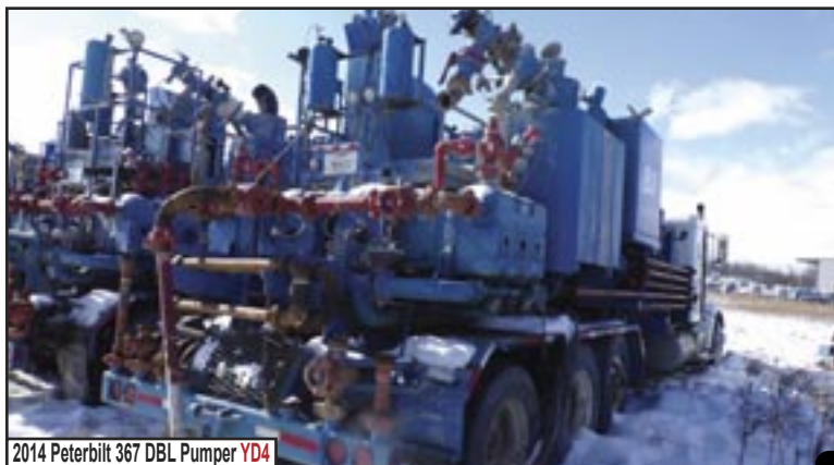
2014 Peterbilt 367 DBL Pumper YD4

1982 T/A BATCH MIXING TRAILER, W/ (2) BULK CEMENT PODS, P/B DETROIT 6V-92T DIESEL ENGINES, W/ HYD PUMP, OPERATORS CONTROLS