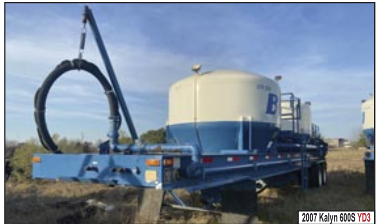
2007 Kalyn 600S YD3

2013 OVERBILT T/A TANK ACID 3 COMPARTMENT TRAILER, 5160 GALLON CAP, W/ MISSION 4X3X13 CENT PUMP, AIR VALVES