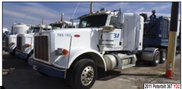
2011 Peterbilt 367 YD2