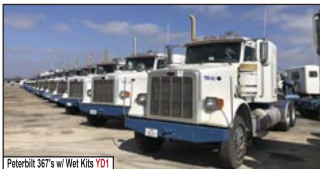
Peterbilt 367's w/ Wet Kits YD1

2018 GARDNER DENVER 2250T TRIPLEX FRAC PUMP , P/B CUMMINS QSK50 DIESEL ENGINE, ALLISON S9820 TRANS., W/ 2019 SPM TWS2250-SS FLUID END, MTD ON 2012 PRATT T/A TRAILER, SHOWS 11563 ENGINE HRS