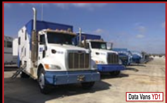
Data Vans YD1