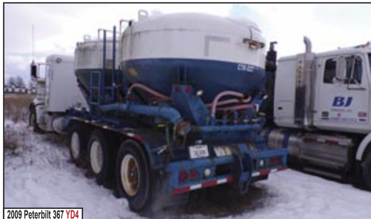
2009 Peterbilt 367 YD4