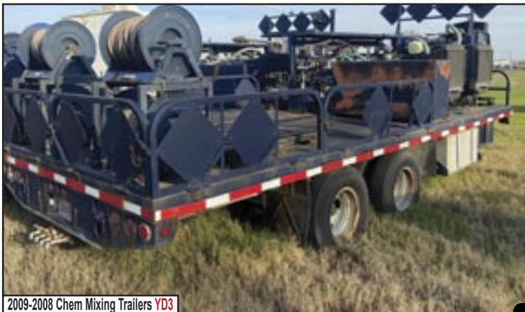
2009-2008 Chem Mixing Trailers YD3

(6) 2007 FRATMOBILE 53'L DRY VAN TRAILERS