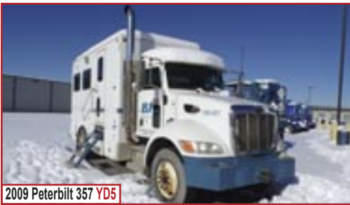
2009 Peterbilt 357 YD5