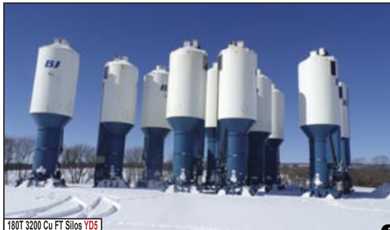
180T 3200 Cu FT Silos YD5

(6) 2014-2010 APPCO T/A DUAL BELT SAND CONVEYORS , P/B (2) CUMMINS 4 CYL DIESEL ENGINES