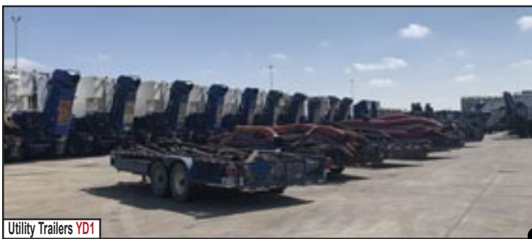
Utility Trailers YD1

SPM TRIPLEX FRAC PUMP , P/B CUMMINS SK50 DIESEL ENGINE, ALLISON S9823 TRANS., W/ 2019 SPM TWS2250 FLUID END, MTD ON 2011 PRATT T/A TRAILER, SHOWS 13686 ENGINE HRS & 2904 PUMP HRS