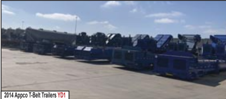
2014 Appco T-Belt Trailers YD1

2019 GARDNER DENVER 2500Q QUINTUPLEX FRAC PUMP, P/B CAT 3512C DIESEL ENGINE, CAT TH55 TRANS., W/ SPM QWS2500 FLUID END, MTD ON 2015 DRAGON 3 AXLE TRAILER, SHOWS 15548 ENGINE HRS & 2553 PUMP HRS