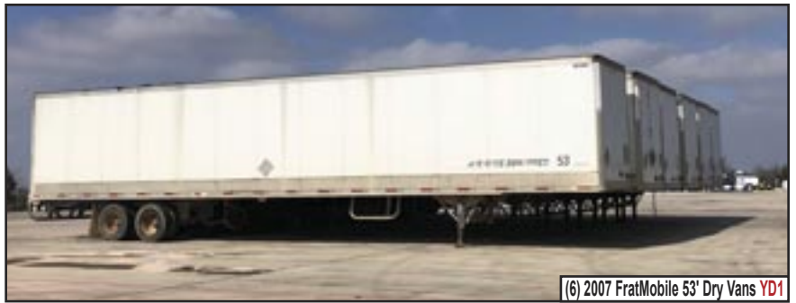
(6) 2007 FratMobile 53' Dry Vans YD1

GORILLA GARDNER DENVER TRIPLEX FRAC PUMP, P/B