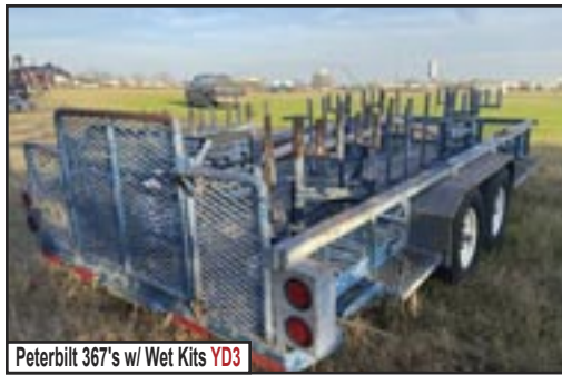
Peterbilt 367's w/ Wet Kits YD3