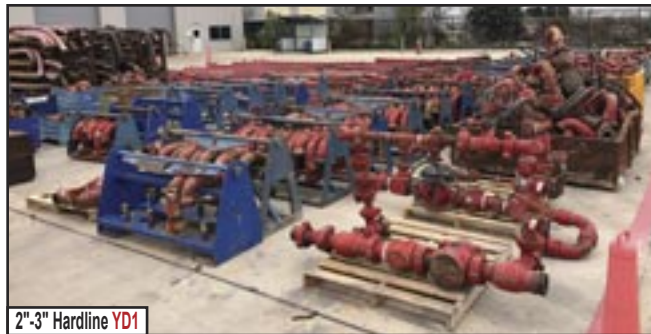
2"-3" Hardline YD1

GARDNER DENVER FLUID END, MTD ON 2007 KALYN 3 AXLE TRAILER, SHOWS 6574 ENGINE HRS & 7443 PUMP HRS