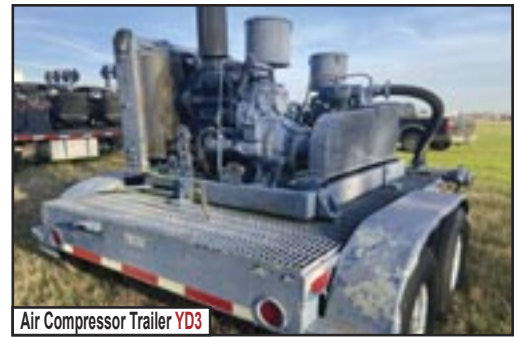
Air Compressor Trailer YD3