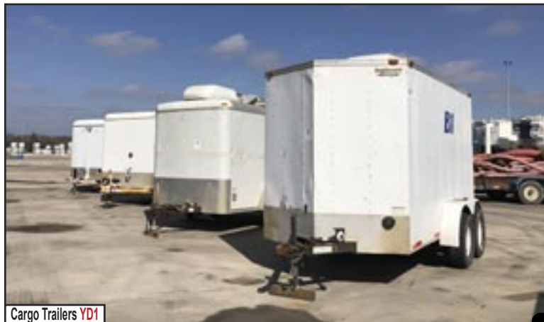
Cargo Trailers YD1

2019 GARDNER DENVER 2250T TRIPLEX FRAC PUMP, P/B CUMMINS QSK50 DIESEL ENGINE, ALLISON S9820 TRANS., W/ 2019 SPM TWS2250-SS FLUID END, MTD ON 2013 RHINO T T/A TRAILER, SHOWS 16696 ENGINE HRS