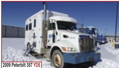
2009 Peterbilt 357 YD5