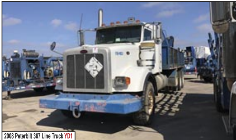
2008 Peterbilt 367 Line Truck YD1

2017 GARDNER DENVER 2250T TRIPLEX FRAC PUMP, P/B CUMMINS QSK50 DIESEL ENGINE, ALLISON S9820 TRANS., W/ 2019 SPM TWS2250-SS FLUID END, MTD ON 2012 PRATT T/A TRAILER, SHOWS 5859 ENGINE HRS