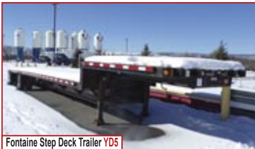
Fontaine Step Deck Trailer YD5