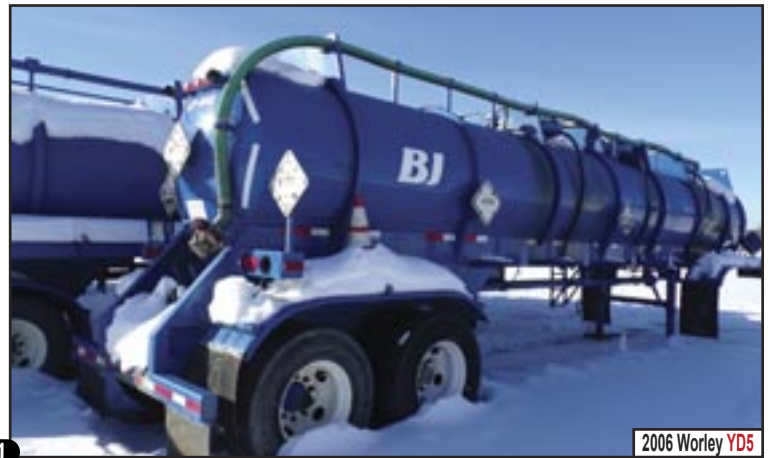
2006 Worley YD5