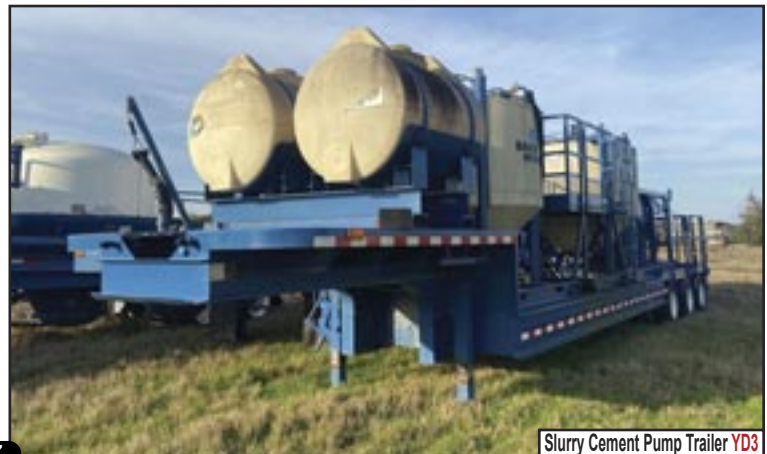
Slurry Cement Pump Trailer YD3

(6) 2007 FRATMOBILE 53'L DRY VAN TRAILERS