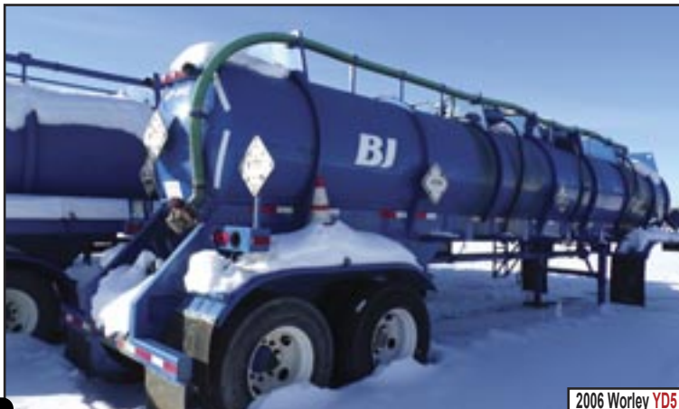
2006 Worley YD5