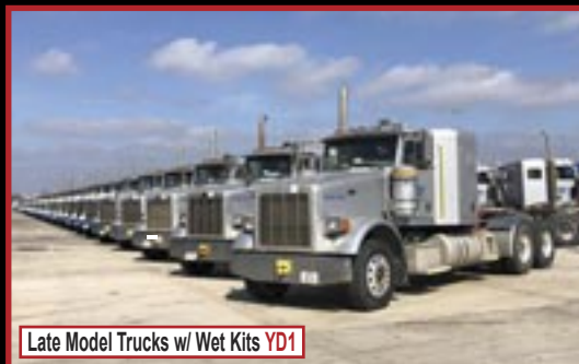
Late Model Trucks w/ Wet Kits YD1