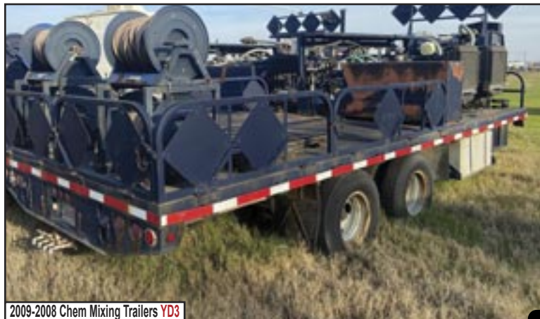
2009-2008 Chem Mixing Trailers YD3

(4) 2014 PRATT T/A HYDRATION UNITS, P/B DETROIT S-60 DIESEL ENGINES, (2) 14X12 CENT PUMPS,