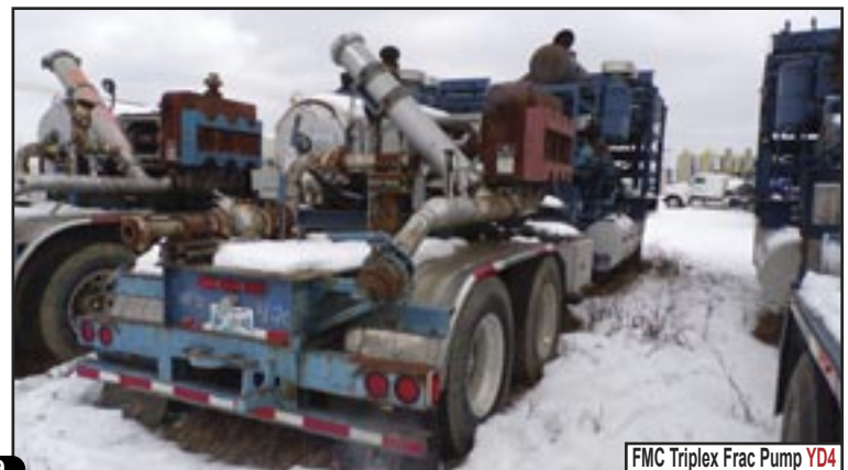
FMC Triplex Frac Pump YD4