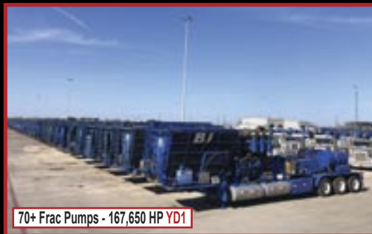
70+ Frac Pumps - 167,650 HP YD1

HUGE SELECTION OF BJ FRAC EQUIPMENT • TRUCKS TRAILERS • CEMENT & ACID EQUIPMENT