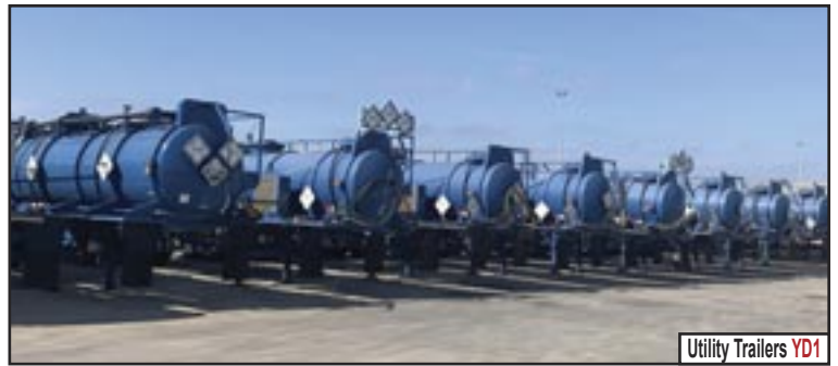
Utility Trailers YD1

The Following CAT 3512C Powered / CAT TH55 Trans Frac Spread is available for immediate purchase!