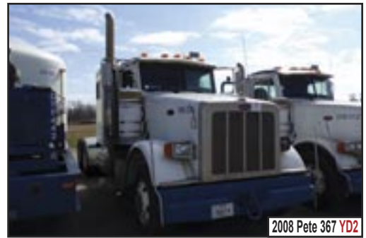
2008 Pete 367 YD2