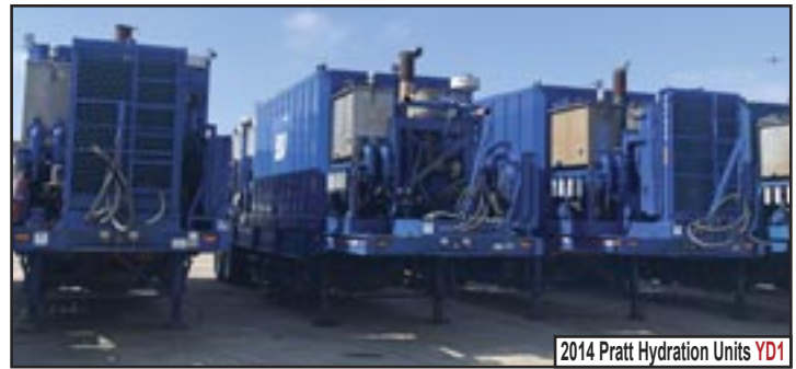
2014 Pratt Hydration Units YD1

2018 GARDNER DENVER QUINTUPLEX FRAC PUMP , P/B CAT 3512C DIESEL ENGINE, CAT TH55 TRANS., W/ GARDNER DENVER FLUID END, MTD ON 2015 DRAGON 3 AXLE TRAILER, SHOWS 16527 ENGINE HRS & 167 PUMP HRS