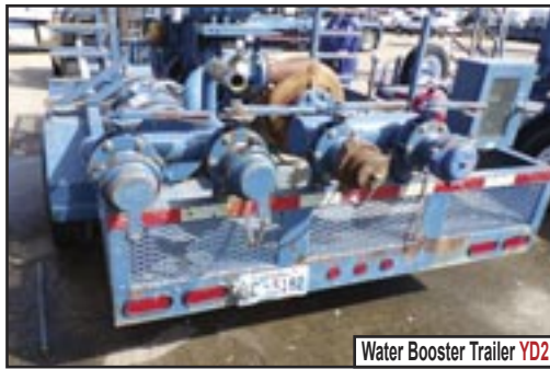
Water Booster Trailer YD2