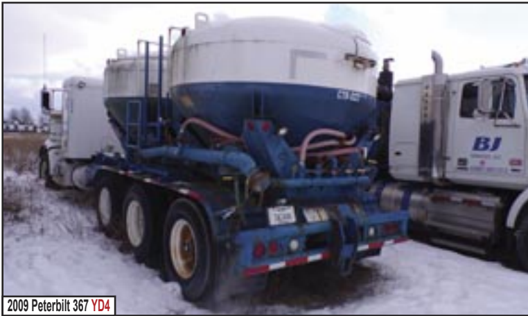
2009 Peterbilt 367 YD4