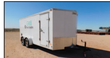
FRANKS 1287/160 WELL SERVICE RIGS DY1 • YD1

2002 DODGE RAM 2500 EXT CAB LWB 2X4 PICKUP, P/B V8 MAGNUM GAS ENGINE, AUTO TRANS., MM, MW, ML, SHOWS 248,477 MILES