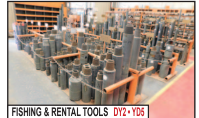
FISHING & RENTAL TOOLS DY2 • YD5