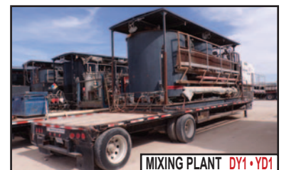
MIXING PLANT DY1 • YD1