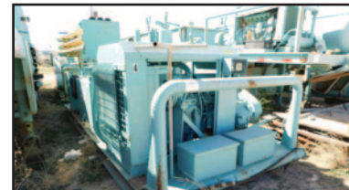
G.DENVER 200FX DY2 • YD4