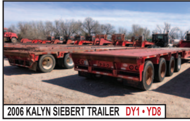
2006 KALYN SIEBERT TRAILER DY1 • YD8