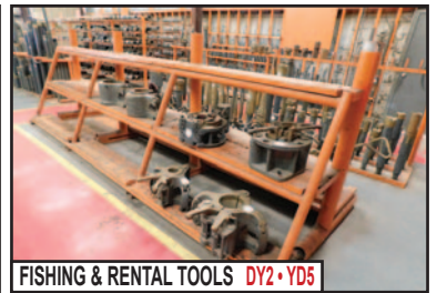
FISHING & RENTAL TOOLS DY2 • YD5