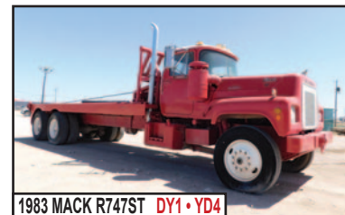
1983 MACK R747ST DY1 • YD4