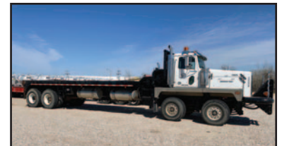
2007 WESTERN STAR TANDEM STEER TRUCK DY1 • YD8