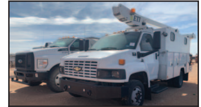
2009 CHEVROLET C4500 BUCKET TRUCK DY1 • YD5