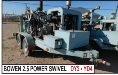
BOWEN 2.5 POWER SWIVEL DY2 • YD4