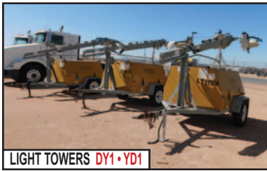
LIGHT TOWERS DY1 • YD1