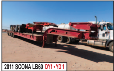
2011 SCONA LB60 DY1 • YD 1