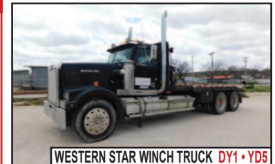
WESTERN STAR WINCH TRUCK DY1 • YD5