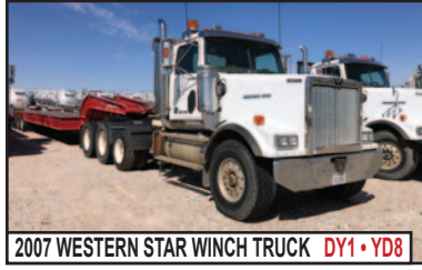
2007 WESTERN STAR WINCH TRUCK DY1 • YD8