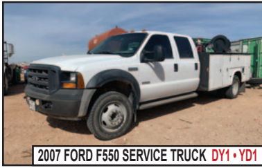
2007 FORD F550 SERVICE TRUCK DY1 • YD1