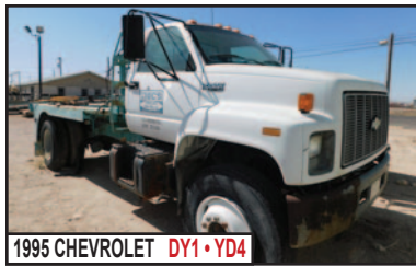
1983 FORD F150 XLT LARIAT EXT CAB, 2X4 PICKUP, P/B FORD V8 GAS ENGINE, AUTO TRANS., PW, PL, MM, A/C, HEAT, RADIO, SHOWS 54,821 MILES