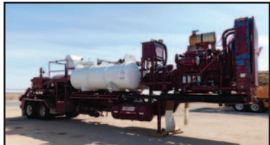
2007 NOV ROLLIGON QUINTUPLEX DBL PUMPER DY1 • YD 1