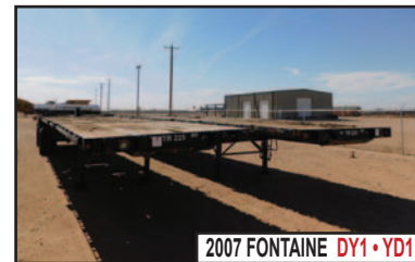
2007 FONTAINE DY1 • YD1