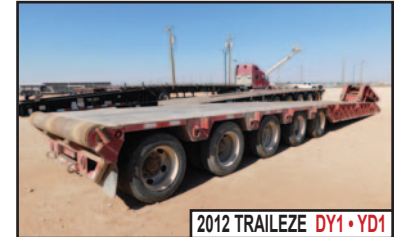
2012 TRAILZEZE DY1 • YD1