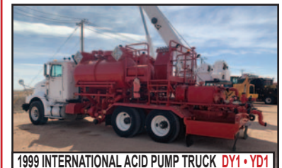
1999 INTERNATIONAL ACID PUMP TRUCK DY1 • YD1