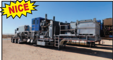
2018 PREMIER COIL SOLUTIONS DBL PUMPER DY1 • YD 1