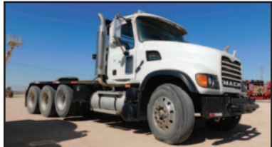
2004 MACK CV713 WINCH TRUCK DY1 • YD 1