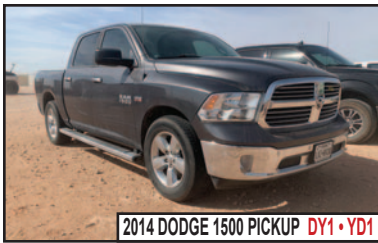
2014 DODGE 1500 PICKUP DY1 • YD1

1997 MACK RD690S T/A DAYCAB ROAD WINCH TRUCK , P/B MACK EM7-300, MAXITORQUE 7 SPD TRANS., 205"WB, PTO, BRADEN WINCH, HR, 5TH WHEEL, AIR RIDE SUSP., SHOWS 531,158 MILES & 28,292 HRS