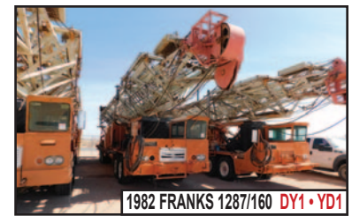
1982 FRANKS 1287/160 DY1 • YD1

2004 MACK CV713 4 AXLE WINCH/ HAUL TRUCK , P/B MACK AI-427 DIESEL ENGINE, 18 SPD TRANS., 228"WB, 17'L OFS BED W/ TULSA WINCH, HR, FRAME WIDTH RTB, 5TH WHEEL, TOOLBOXES, SHOWS 444,194 MILES