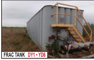
FRAC TANK DY1 • YD6