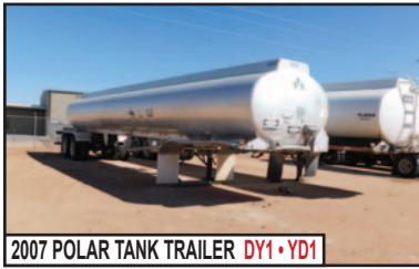
2007 POLAR TANK TRAILER DY1 • YD1