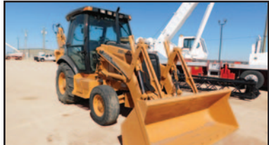
CASE 580 SUPER M EXTENDA BACKHOE DY1 • YD 1