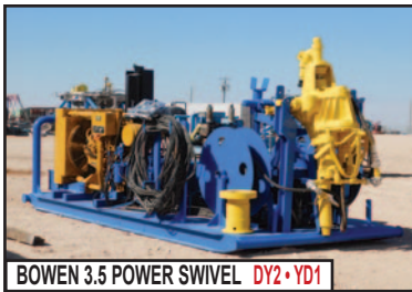
BOWEN 3.5 POWER SWIVEL DY2 • YD1