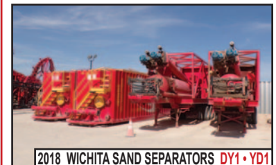
2018 WICHITA SAND SEPARATORS DY1 • YD1