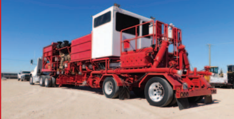
OMEGA TRIPLEX ACID PUMPER TRAILER DY1 • YD 1

WIRELINE TRUCKS HAUL TRUCKS TRAILERS • PICKUPS WELL SERVICE RIGS CONSTRUCTION FISHING & RENTAL TOOLS