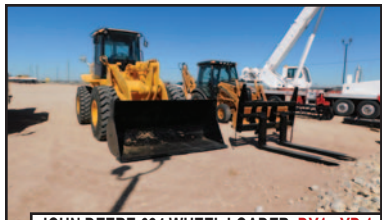
JOHN DEERE 624 WHEEL LOADER DY1 • YD 1