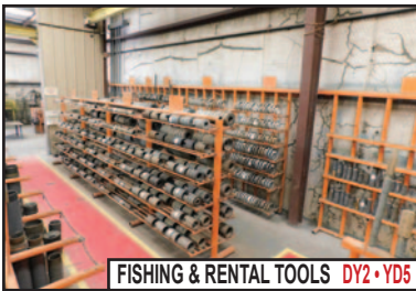
FISHING & RENTAL TOOLS DY2 • YD5