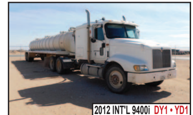
2012 INT'L 9400i DY1 • YD1