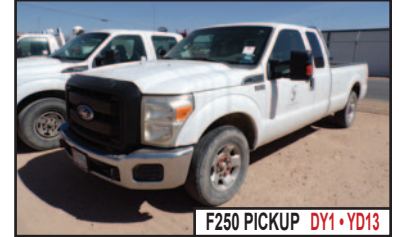
F250 PICKUP DY1 • YD13