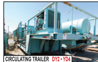
CIRCULATING TRAILER DY2 • YD4