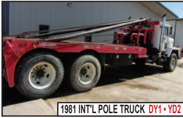
1981 INT'L POLE TRUCK DY1 • YD2