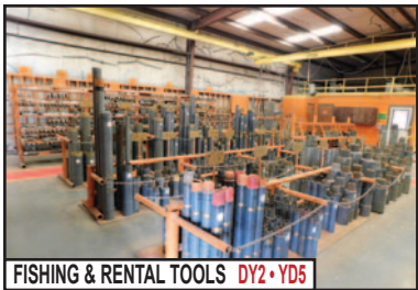
FISHING & RENTAL TOOLS DY2 • YD5