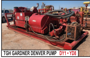
TGH GARDNER DENVER PUMP DY1 • YD8