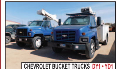
CHEVROLET BUCKET TRUCKS DY1 • YD1