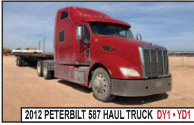
2012 PETERBILT 587 HAUL TRUCK DY1 • YD1

(2) 2018 TSI FLARE STACKS , 50' TALL MTD ON S/A TRAILER, W/ PROPANE PILOT, W/ 16' OUT RIGGERS ON EACH SIDE