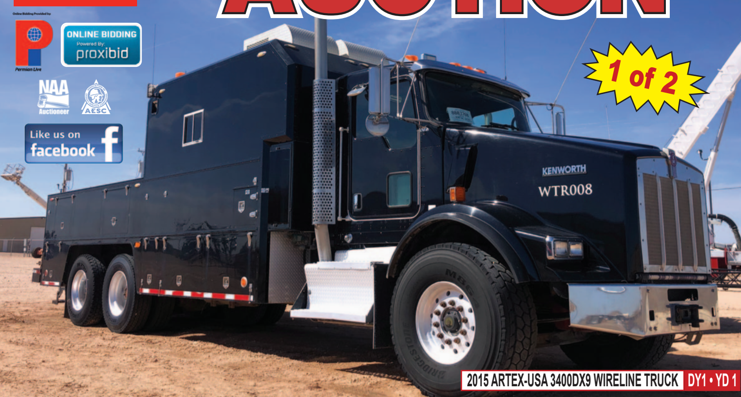
2015 ARTEX-USA 3400DX9 WIRELINE TRUCK DY1 • YD 1

5% Buyer Premium On Site • 7% Buyer Premium On Line • Auctioneers | Sixto Paiz – #17750 • Eric Dyess – TX Lic# 16926