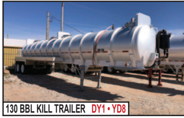
130 BBL KILL TRAILER DY1 • YD8