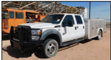
2011 FORD F550 WIRELINE PICKUP DY1 • YD 1