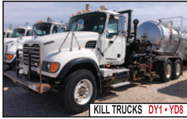
KILL TRUCKS DY1 • YD8

1983 FORD F150 XLT LARIAT EXT CAB, 2X4 PICKUP, P/B FORD V8 GAS ENGINE, AUTO TRANS., PW, PL, MM, A/C, HEAT, RADIO, SHOWS 54,821 MILES