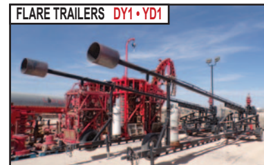
FLARE TRAILERS DY1 • YD1