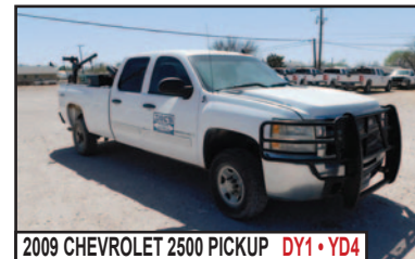
2009 CHEVROLET 2500 PICKUP DY1 • YD4