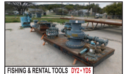
FISHING & RENTAL TOOLS DY2 • YD5