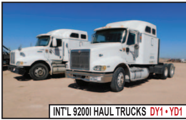
INT'L 9200I HAUL TRUCKS DY1 • YD1