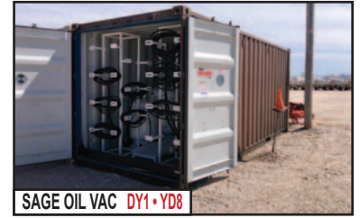
SAGE OIL VAC DY1 • YD8