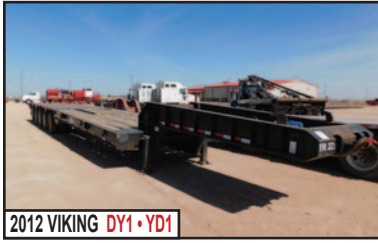
2012 VIKING DY1 • YD1