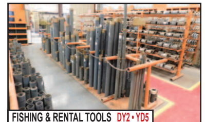
FISHING & RENTAL TOOLS DY2 • YD5