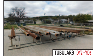
TUBULARS DY2 • YD5