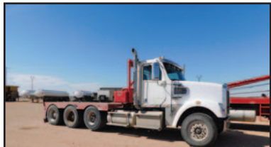
2012 FREIGHTLINER CORONADO SD WINCH TRUCK DY1 • YD 1