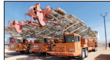
(3) FRANKS 1287/160 DY1, YD1 DY1 • YD1