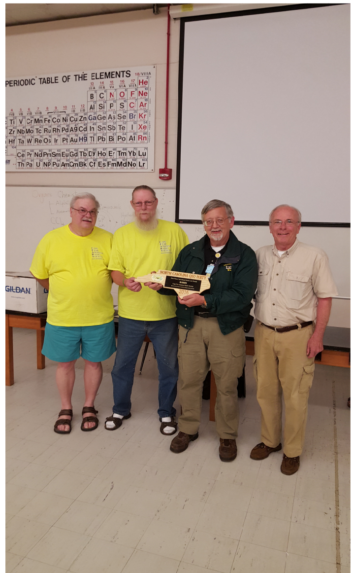
Cape Fear Amateur Radio Society is awarded 1st Place in the 2016 NC QSO Party for the fourth year in a row!!!!

The winner for the Club In-State Low Power category this year is The Cape Fear Amateur Radio Society K4MN operating in Cumberland County. CFARS came out ahead of the pack to keep their title as the top LP club entry. K4MN ended up with a score of 207,246 points and worked a total of 63 counties. Coming in second place for the In-State LP Club category is the Alamance Amateur Radio Club K4EG in Alamance County. AARC had a total score of 99,345 points and worked 60 counties in NCQP this year. - (From the RARS website)