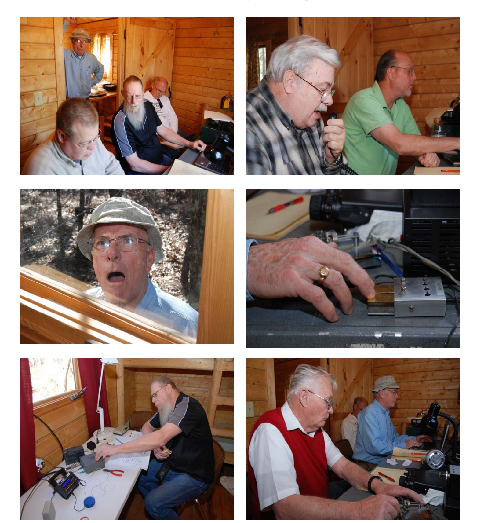
2013 NC QSO Party CFARS Style