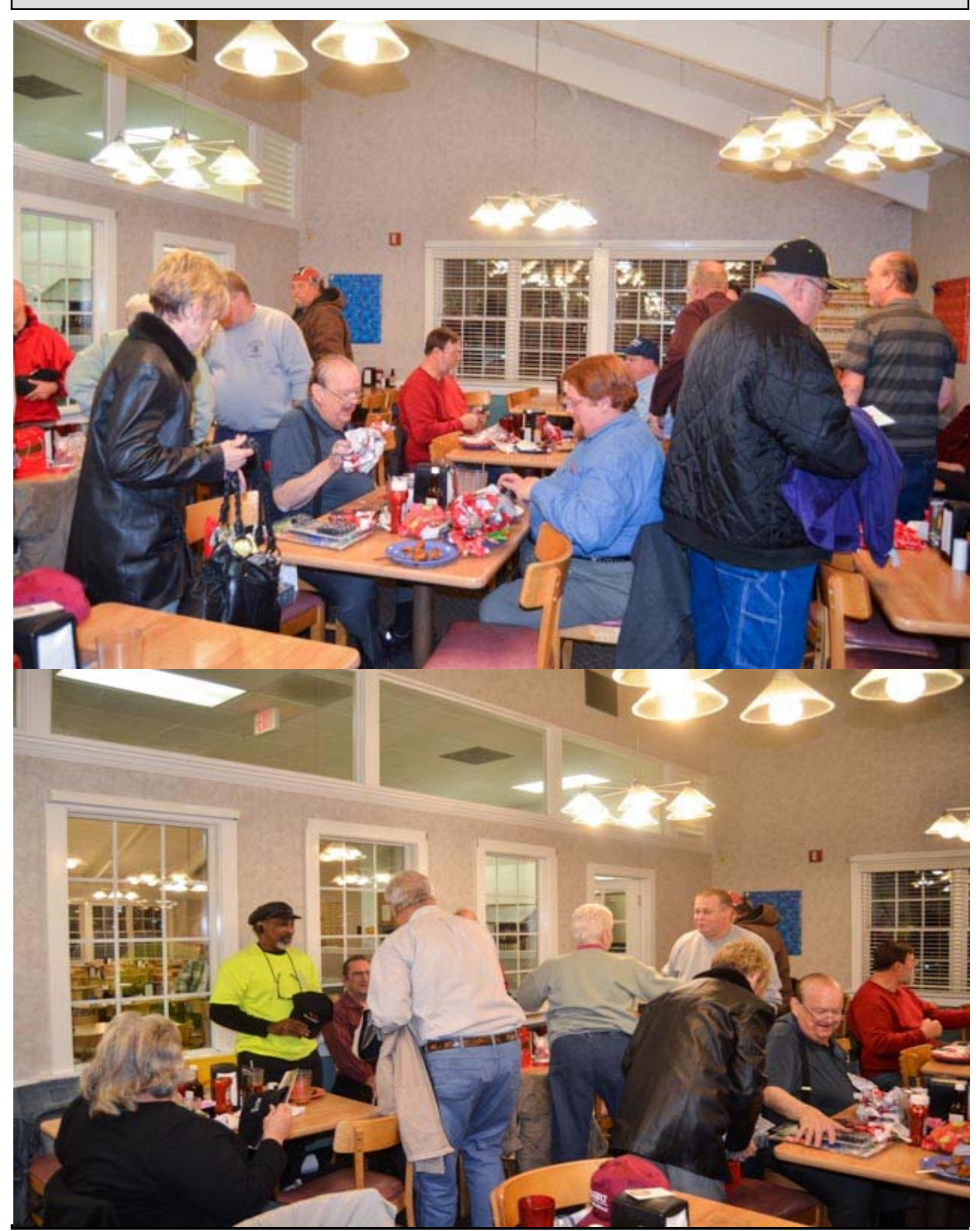
CFARS News Page 8