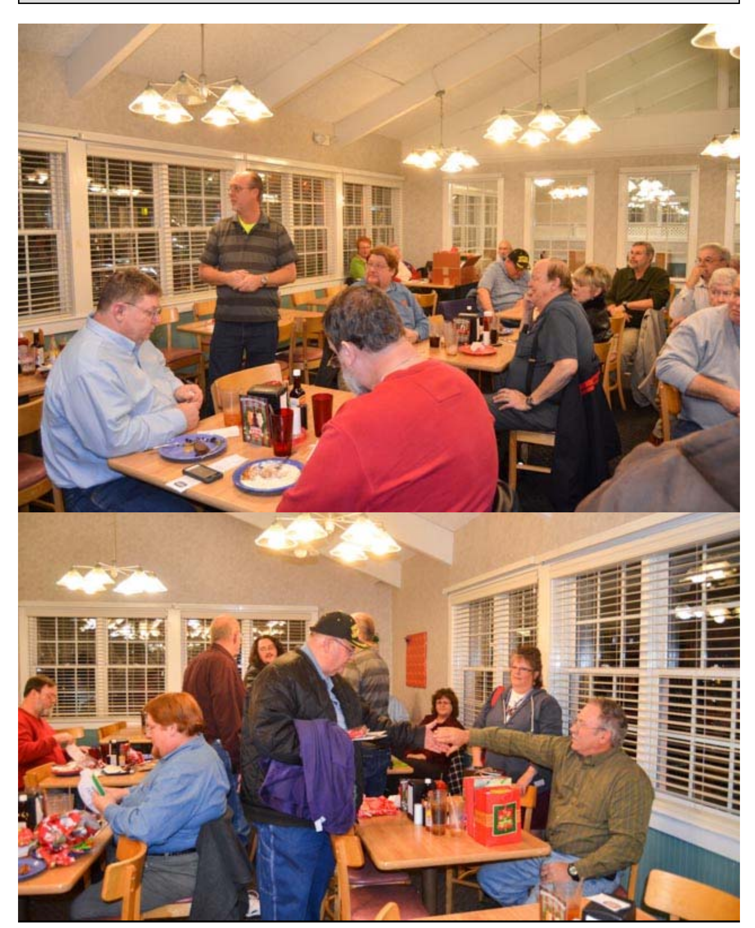
CFARS News Page 7