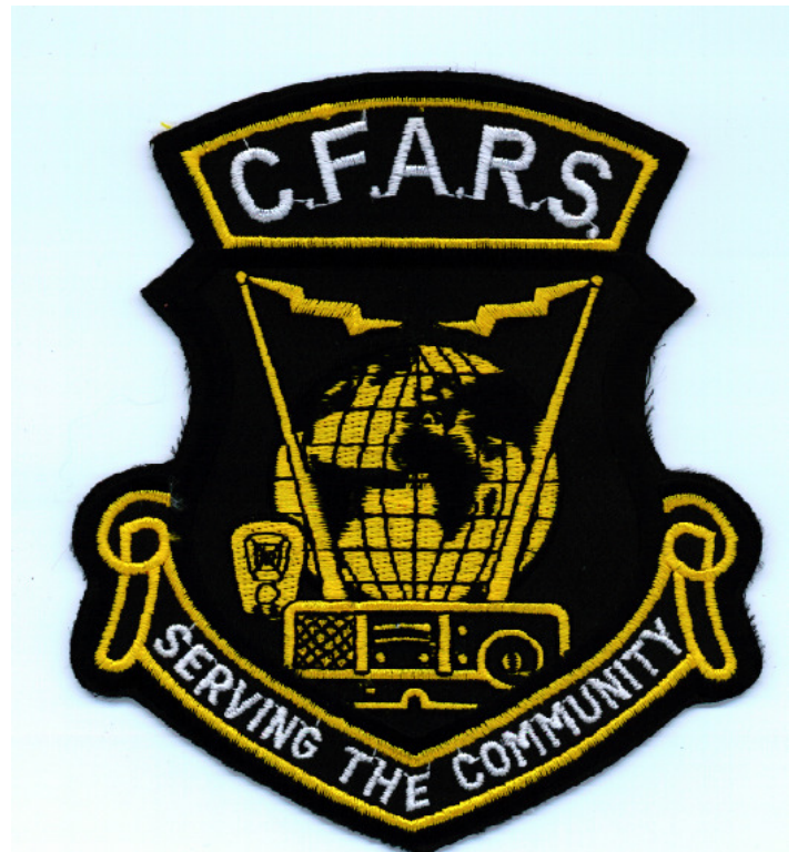
CFARS Club patches are available for purchase for $5. See Kelly N4EWG to get your patch today!!!!

K4MN 2 m 146.910/146.310 70 cm 444.400/449.400 K4MN 6 m 53.810/52.810 WA4FLR 2 m 147.330/147.930