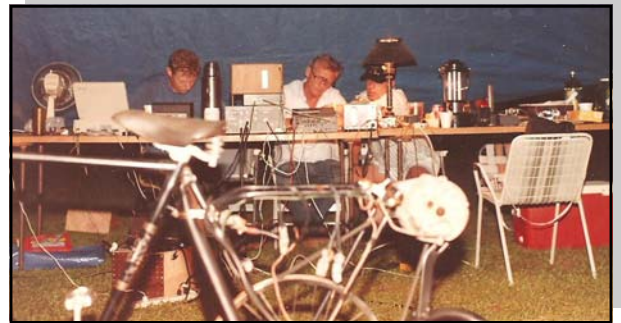
Field Day 2010 at Methodist University