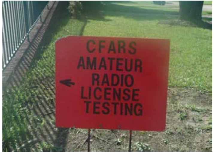
Right this way to take your Amateur Radio Exam.

Our next scheduled VE Test session is October 13, 2012. This is the last scheduled exam for 2012. Please bring original of license, a copy of the license, any CSCE's earned and $15 cash if you plan on testing.