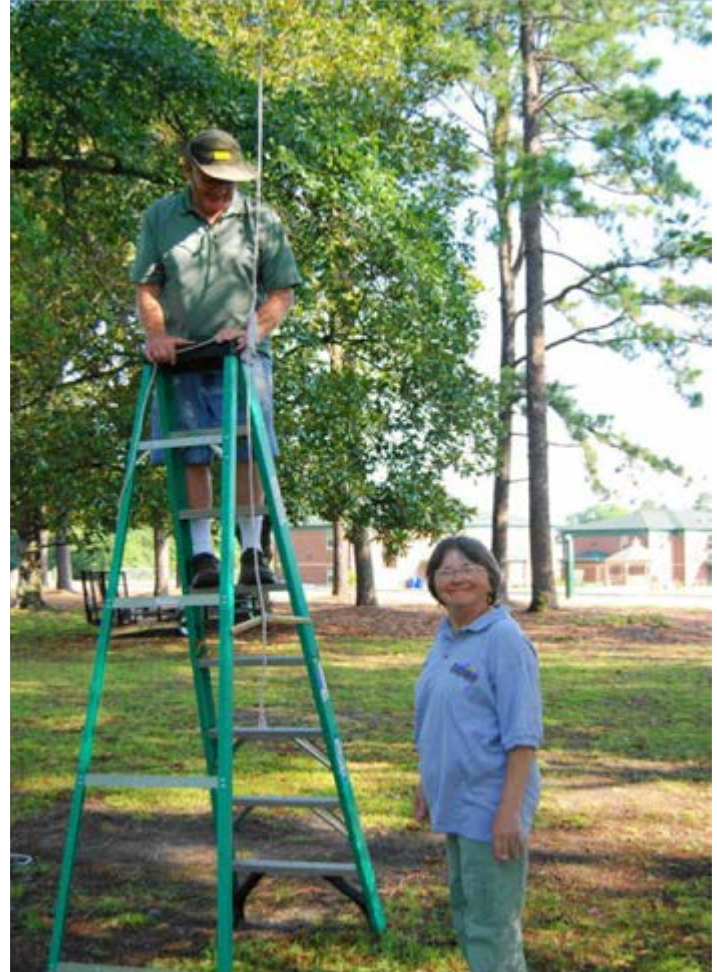
Antenna work in progress!!!!