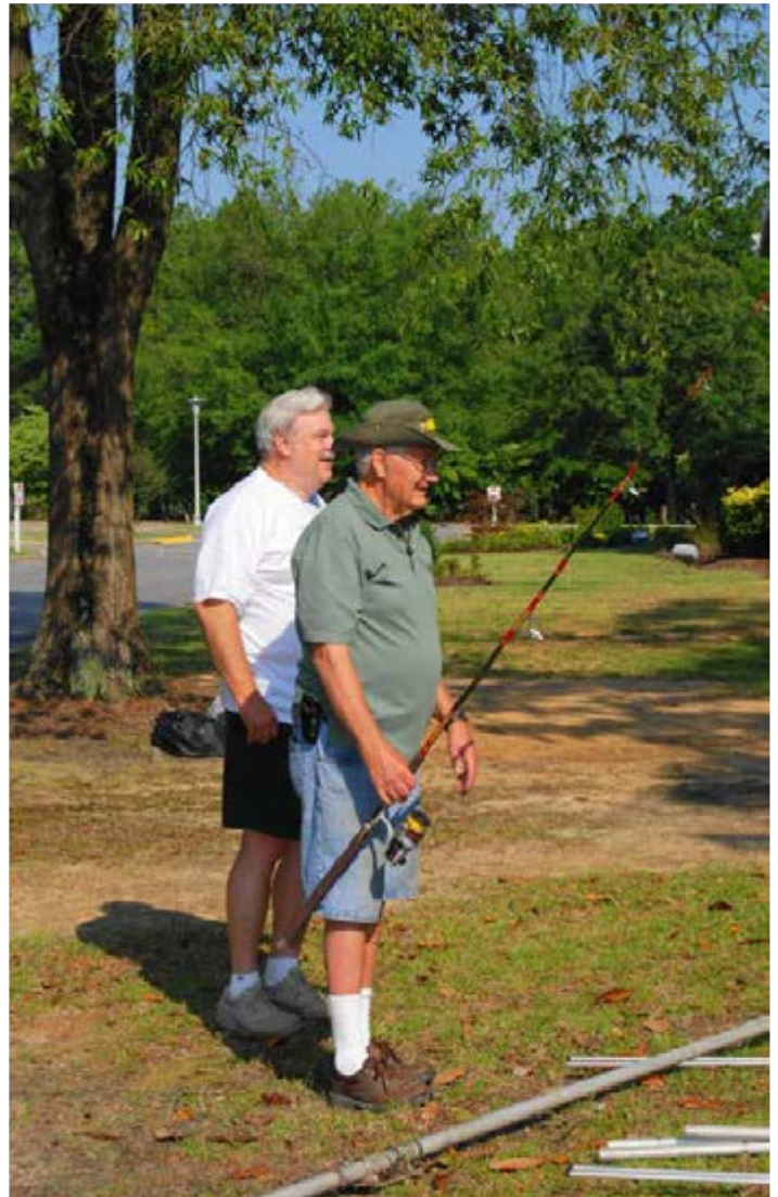
Where is the pond?