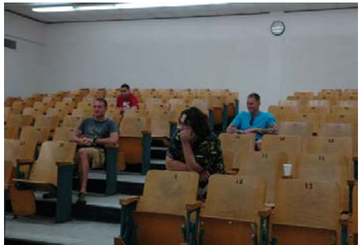
Applicants waiting to take their exams...