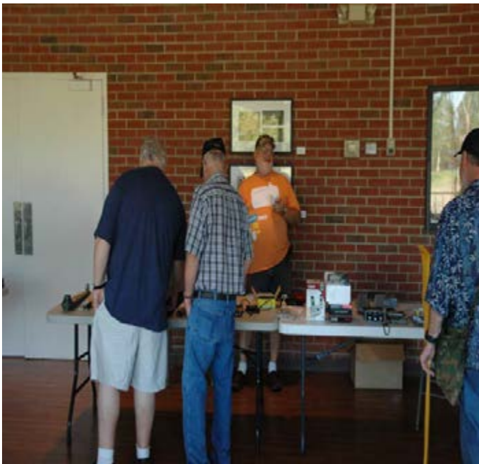
W3OJO talking to swapfest attendees