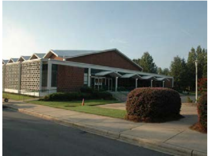
Reeves Auditorium...CFARS Swapfest style