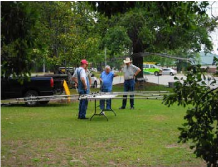
Antenna work in progress for a great Field Day 2012!!!