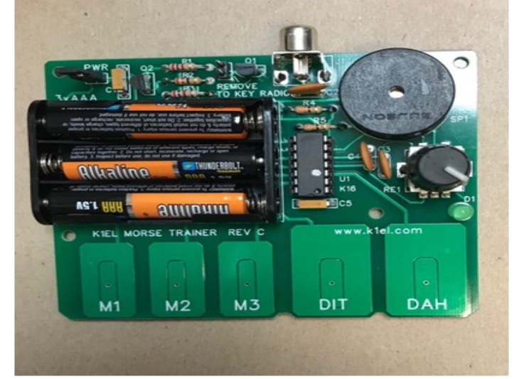
The keyer kit as it arrived