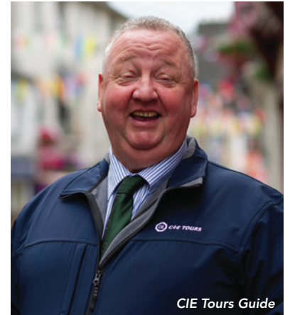
CIE Tours Guide

All-inclusive pricing and more than 90 years of experience means value and peace of mind when you travel with CIE Tours.