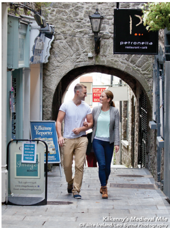
Kilkenny's Medieval Mile

Prices valid through 5/31/2023 and are per person, land only, based on double occupancy in USD, and vary by departure date and availability. Prices, attractions and itineraries are subject to change.