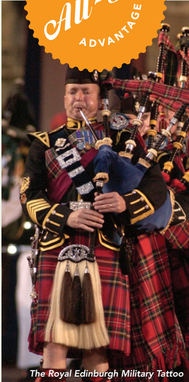
The Royal Edinburgh Military Tattoo