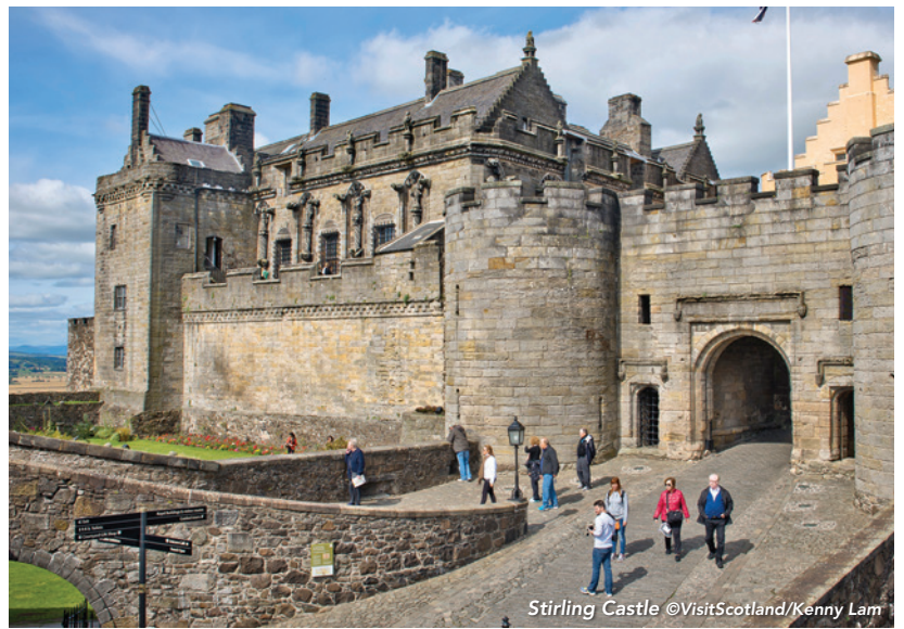
Stirling Castle