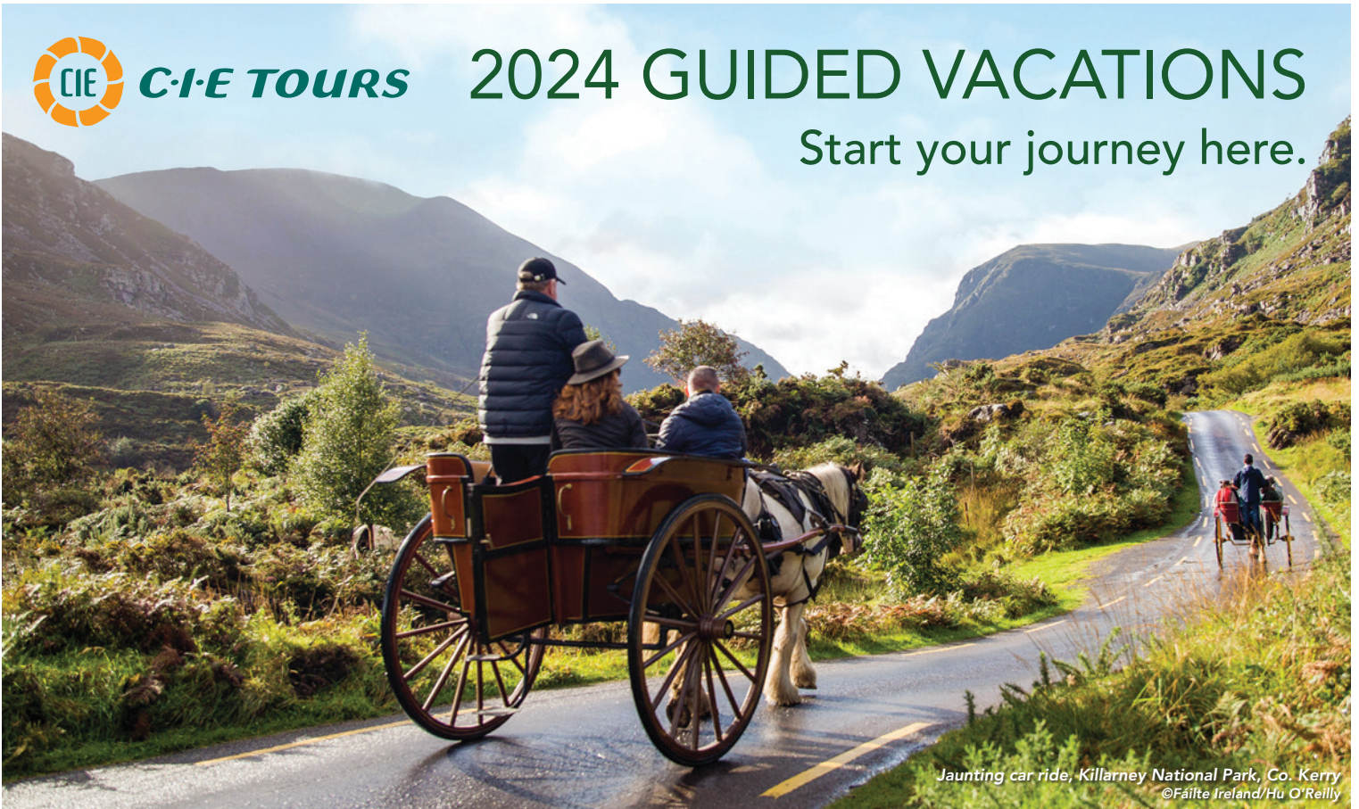
Jaunting car ride, Killarney National Park, Co. Kerry