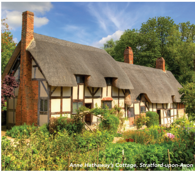
Anne Hathaway's Cottage, Stratford-upon-Avon