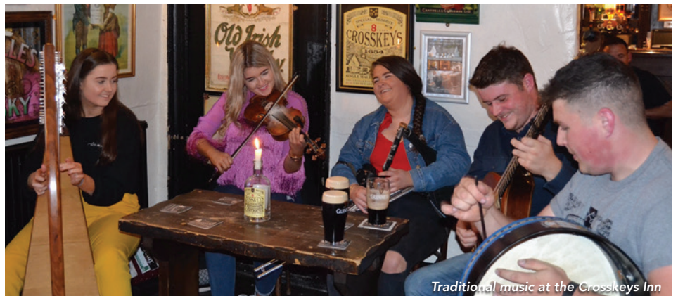
Traditional music at the Crosskeys Inn

We're with you every step of the way, managing logistics so you can enjoy the experience. Our nine decades of experience means we've planned your itinerary to maximize your vacation time, selected the perfect accommodations, and reserved your spot in line at popular attractions. Your route has been mapped and we do the driving; all you need to do is relax in our comfortable motorcoach and enjoy the scenery. With CIE Tours, you don't have to worry about quality or value; just leave it to us.