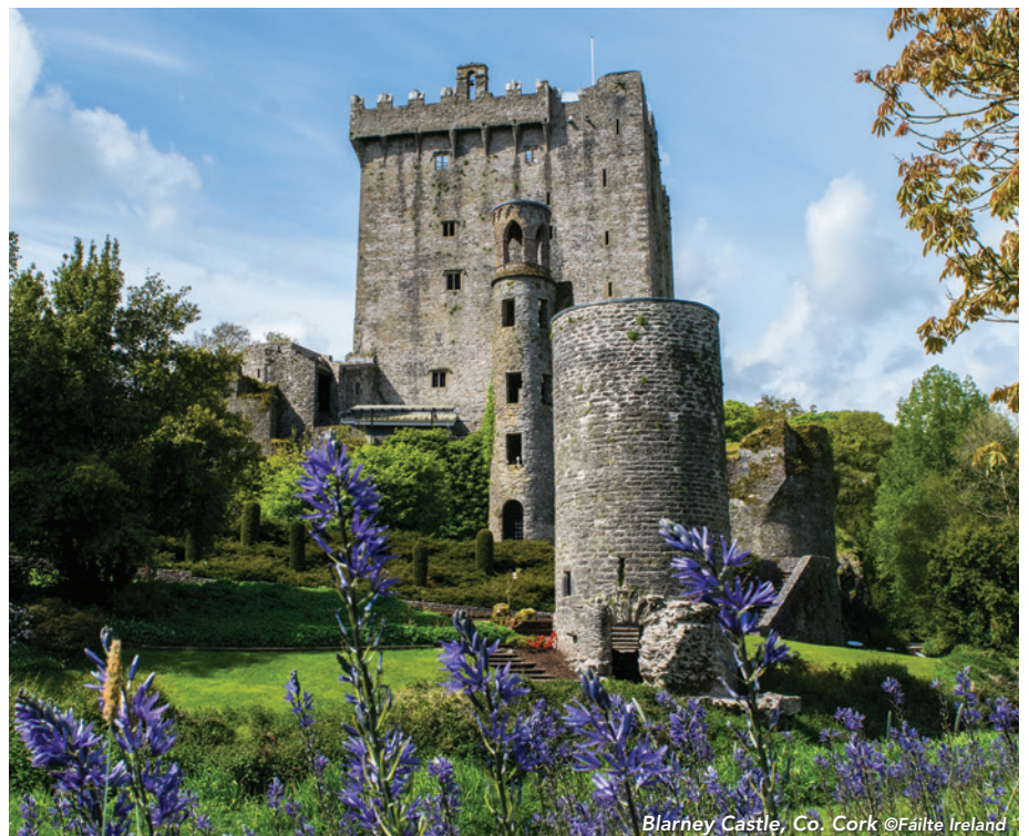
Blarney Castle, Co. Cork