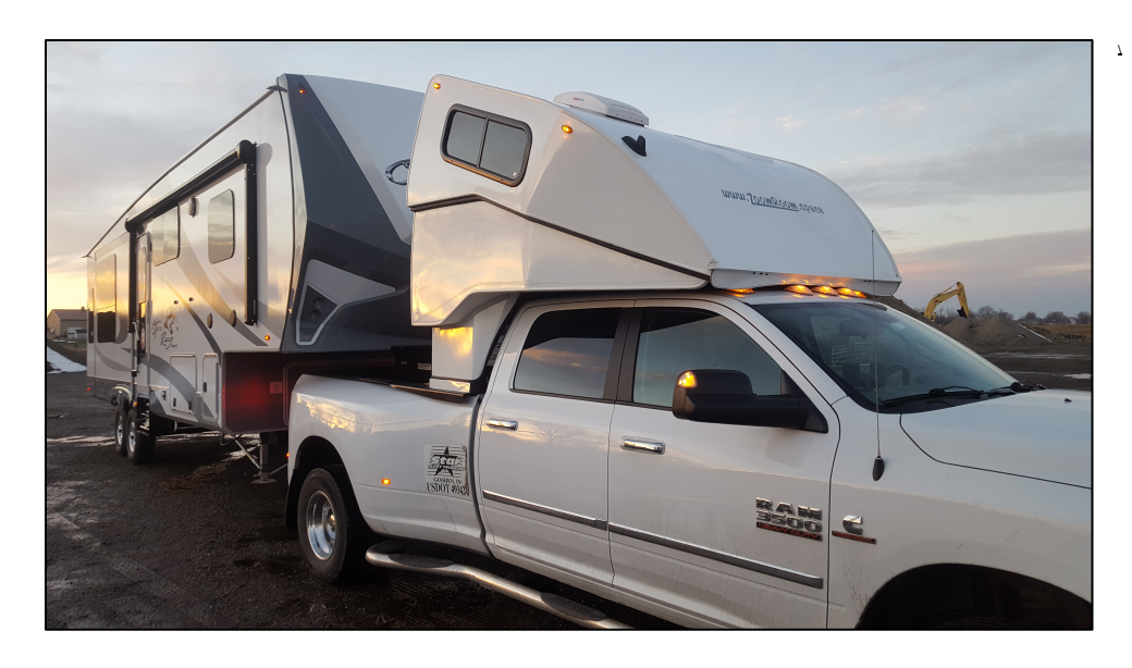
A SWITCH RAISES AND LOWERS THE UNIT TO EASILY ADJUST FOR OPTIMAL WIND DEFLECTION WHILE TOWING, OR FOR SLEEPING - DRIVE IT IN ANY POSITION