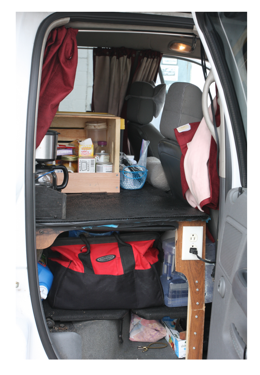
WITH THE BACK SEAT NOW AVAILABLE THERE'S ROOM FOR AN <u>EAT-HEALTHY</u> KITCHEN, TOOLBOX, CLOTHING, OFFICE AND EVEN A PRIMITIVE TOILET