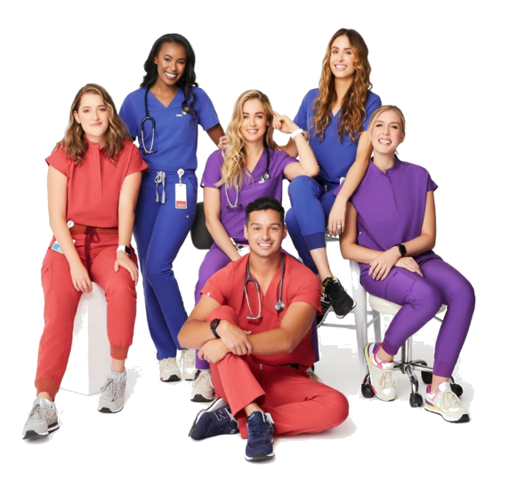
Become part of our story