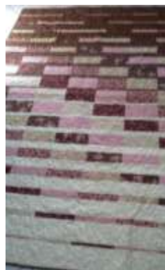
Modern strippy (light to dark, single bed size) 56"x85" value $410.00