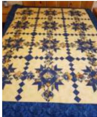
Size 60" x 78" Value $400.00