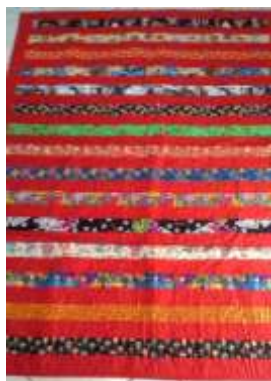
Red strippy (lap or small bed) 44" x 60" value $230.00

If you wish a quilt for a raffle or silent auction for your organization in the Durham region, we have a couple on hand you can apply for. I have the forms to send you to apply. See photos below. More will be quilted this fall.