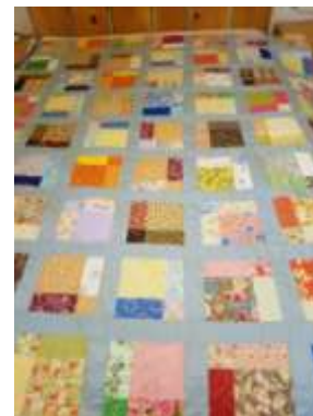
Size 66" x 72" Value $375.00