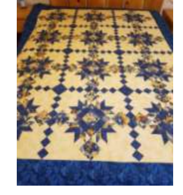
Size 60" x 78" Value $400.00