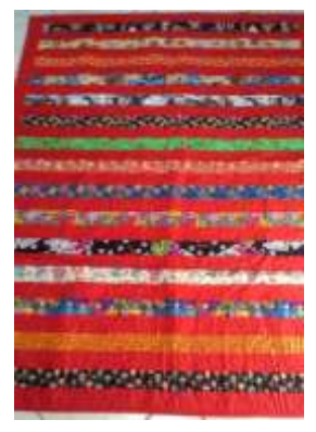
Red strippy (lap or small bed) 44" x 60" value $230.00

If you wish a quilt for a raffle or silent auction for your organization in the Durham region, we have a few on hand. I have the forms to send you to apply. See photos below. More will be quilted this fall.