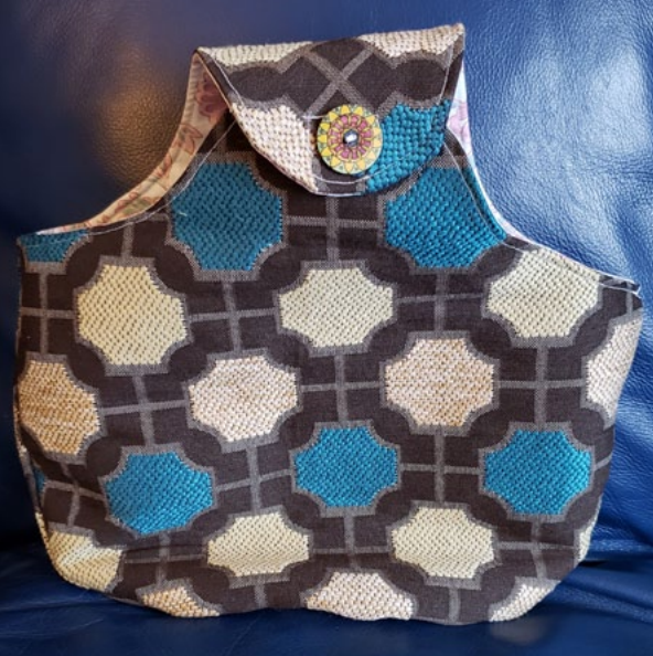
My First Walker Bag

I hope I can encourage you to put forward your talents for next