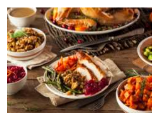
DTQG 2022 Dec 12 Catered Dinner – Laura B.

Full guild members (registered and paid) may sign up to attend a catered holiday dinner prior to the December guild meeting. The dinner will cost $30 per person (INCLUDES tax) and it will be held at the guild meeting location, with food being served at 5:30 pm on 2022 December 12. Those participating in the dinner are asked to arrive at 5:15 pm so that dinner can start on time and be done before the actual meeting. Members who are not attending the catered dinner are asked to arrive for the meeting at the normal 6:45 time, prior to the start of the guild meeting at 7:00 pm.