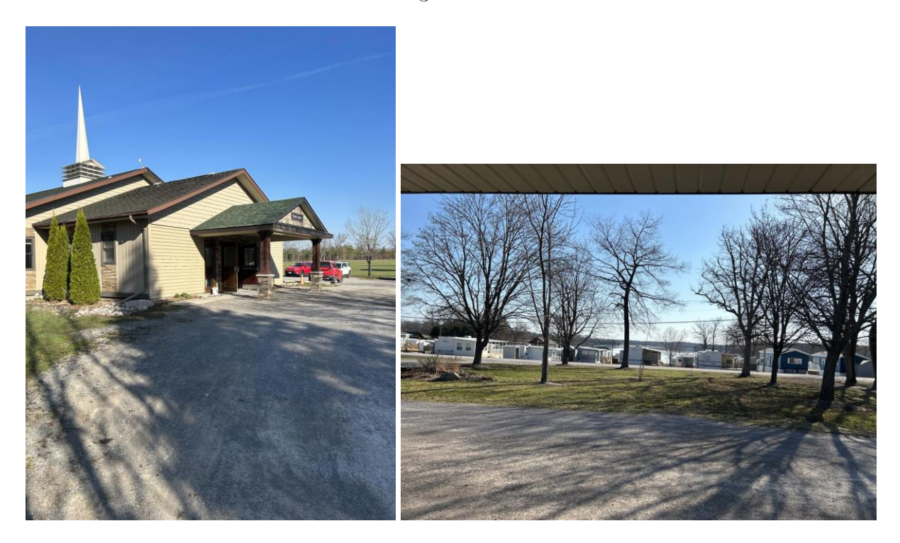
Here is the chapel where we sew and a beautiful view from the chapel door. The weather was outstanding!