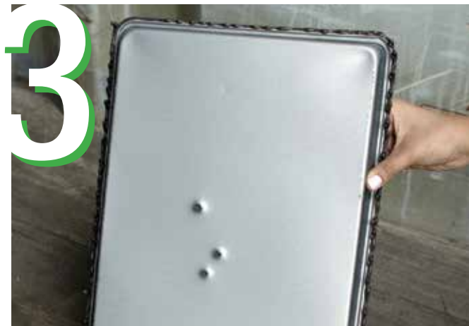
Bullets penetrated through the pan.