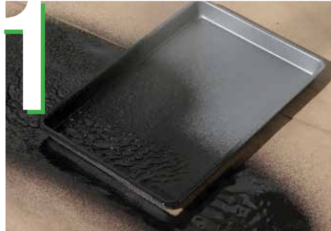
EXPANDOTHANE sprayed on a non-stick cooking pan.