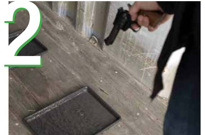
Three 22 caliber shots fired at the pan.