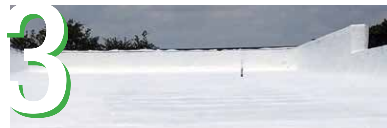
UV PROTECTIVE COATING APPLIED