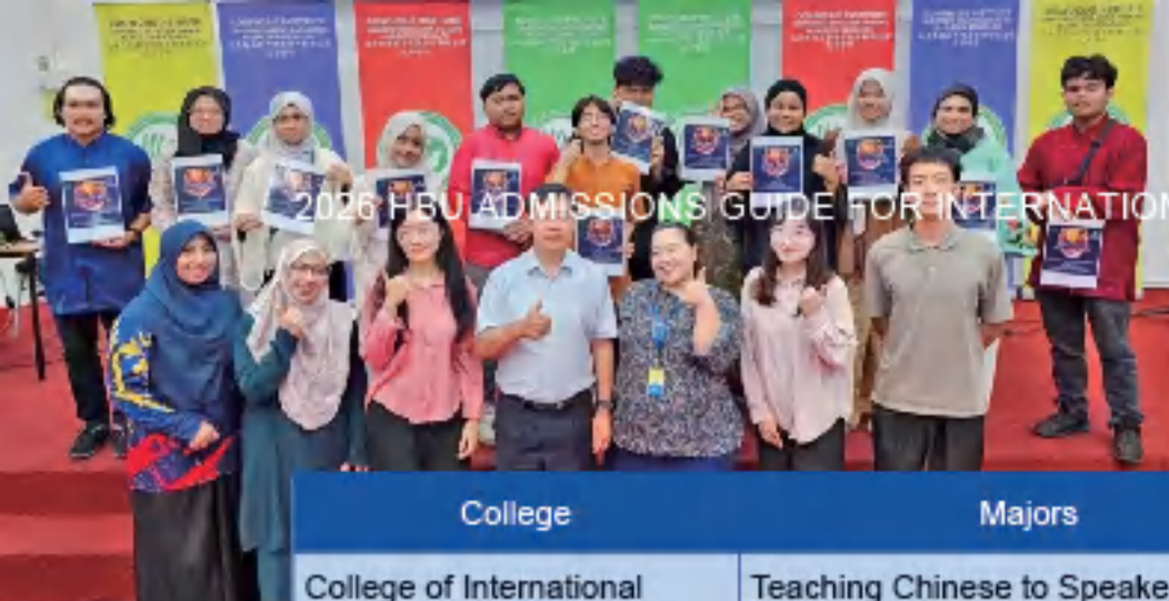
2026 HBU ADMISSIONS GUIDE FOR INTERNATIONAL APPLICANTS