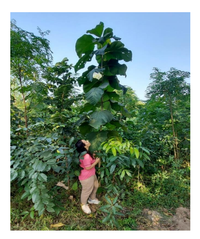
November 2022. Left: A teak sapling in a plantation control area. Right: A teak sapling in a Miyawaki section, planted at the same time.

Our pioneering work has already received <u>prominent coverage</u> in Nepal's leading English language paper, the Nepali Times. See QR code on right . That exposure has led to enquiries and visits from across Nepal with MWT offering free consultancy to any organisation that wishes to replicate the project.