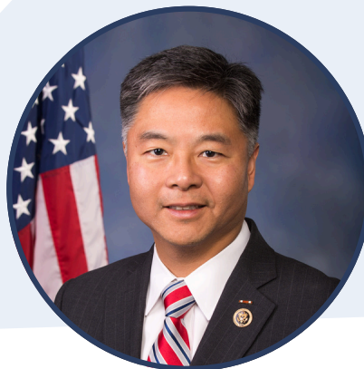
Ted Lieu ASPIRE PAC and Democratic Vice Chair