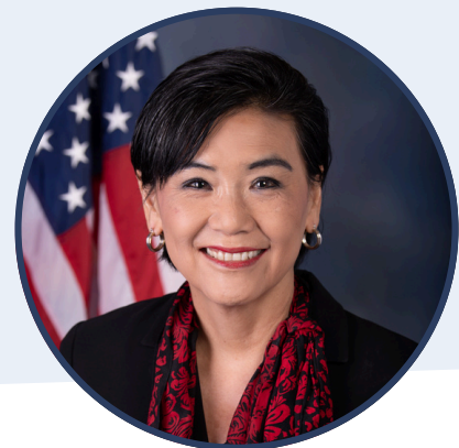
Judy Chu CAPAC Chair

We invite you to join us together with key Members of Congress to the: