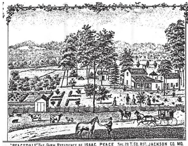
PEACEDALE THE FARM RESIDENCE OF ISAAC PEACE SEC. 23 T. 50. R. 81. JACKSON CO. MO.

In the early 1840's Isaac purchased Peacedale Farm in section 23, of township 50, range 81 and owned between 800 and 900 acres of land in Jackson County. The farming operation included livestock, dairy, corn, soybeans, wheat, grain sorghum, hay and pasture forage as well as garden vegetables and fruit. The larger barn on the property was actually moved from the west side of Twyman Road to the East side in the early 1900's.